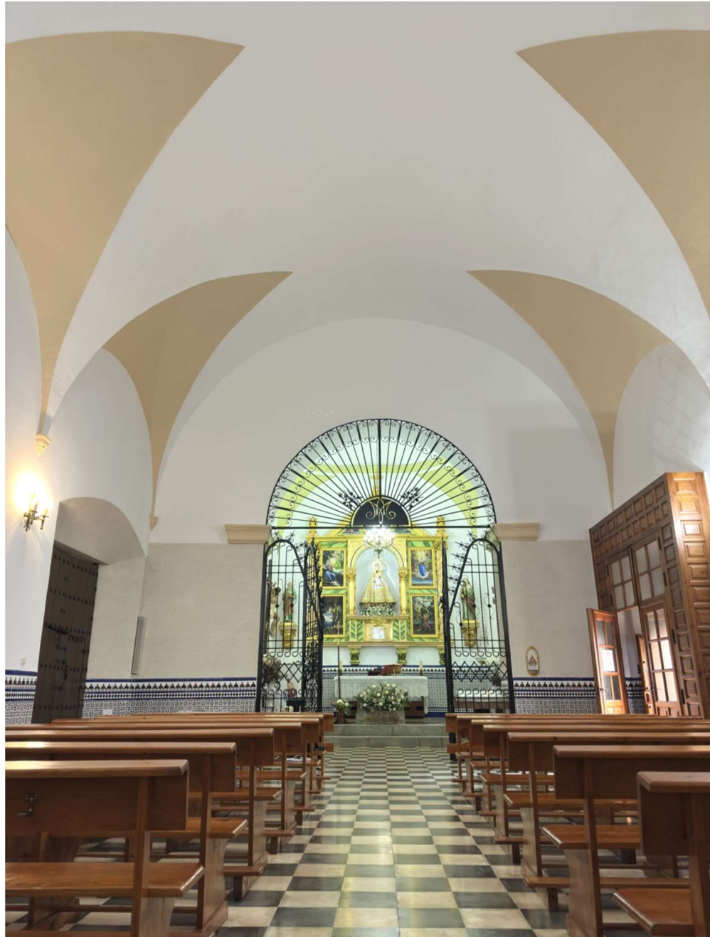
Interior of the hermitage with the altarpiece protected by a grille.