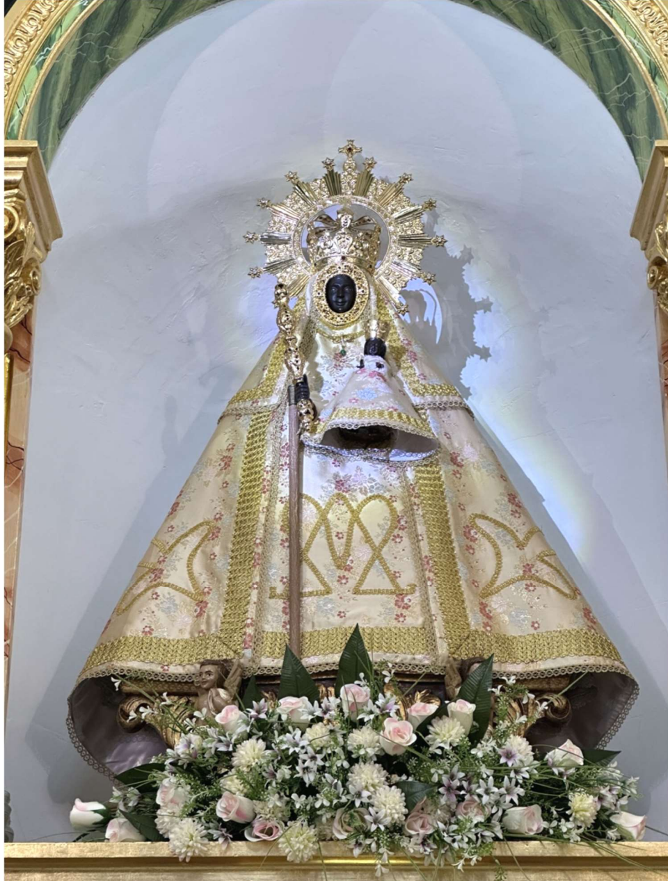
Image of the dark-skinned Virgin of the Ermita de la Virgen de los Remedios.