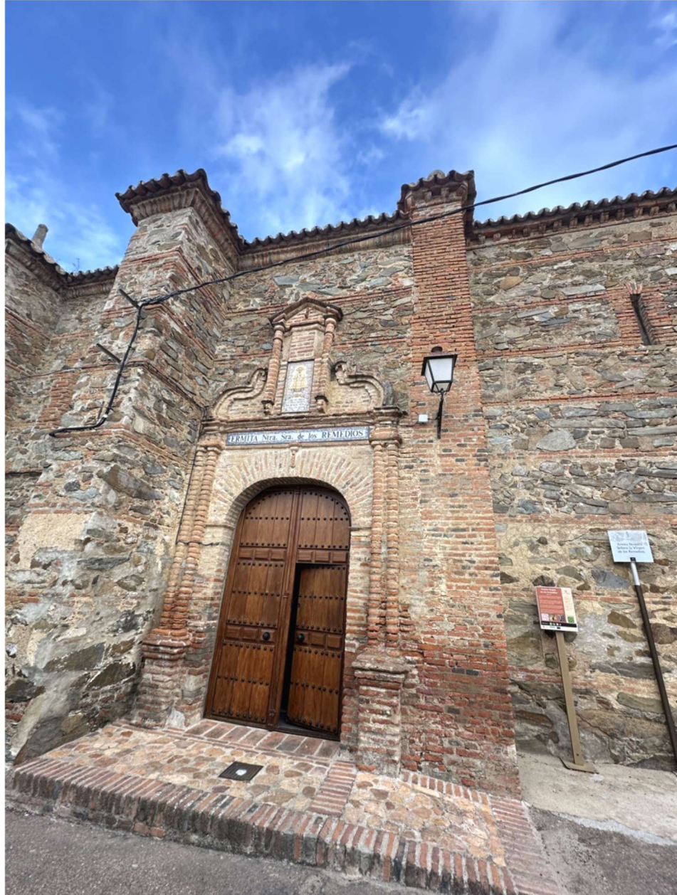
Main façade of the hermitage.