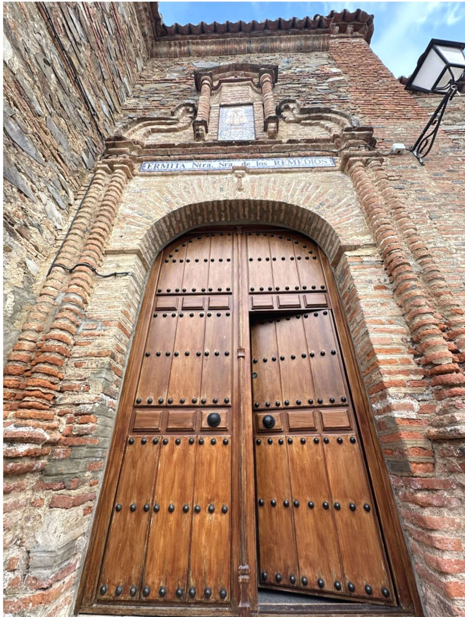
Detail of the door and access area.