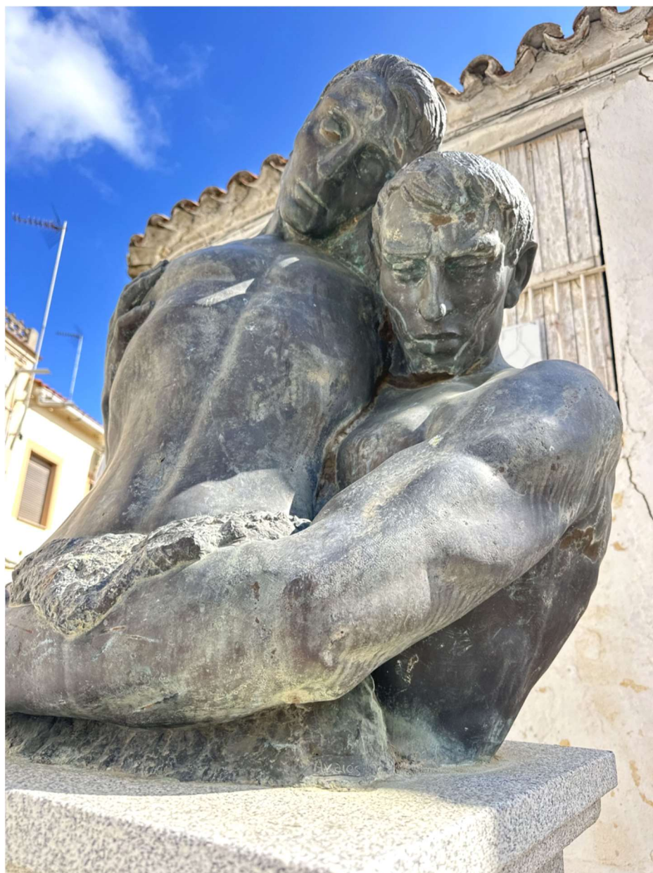
Detail of the sculpture "Hell for the Fallen".