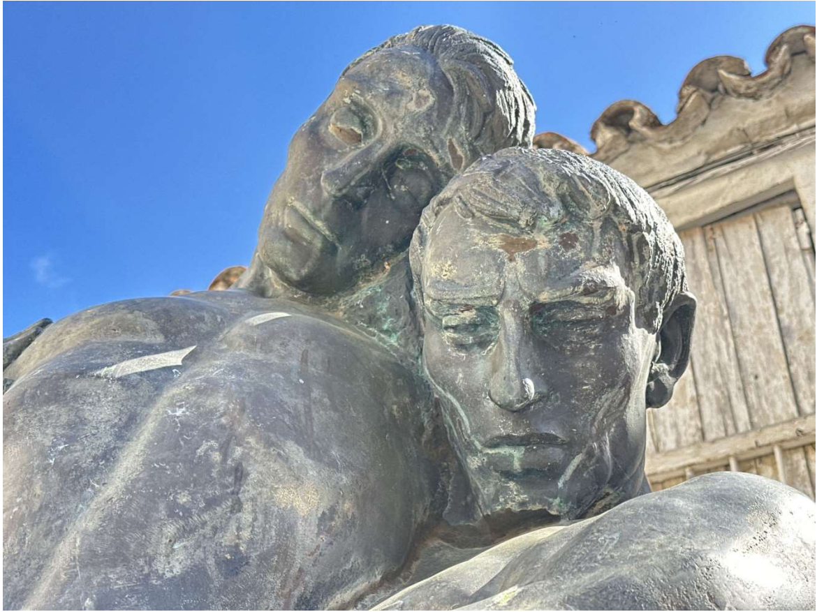
Close-up of the sculptural work.