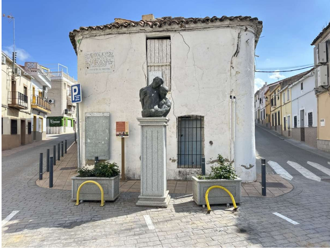
Sculpture by Juan de Ávalos in Casas de Don Pedro.