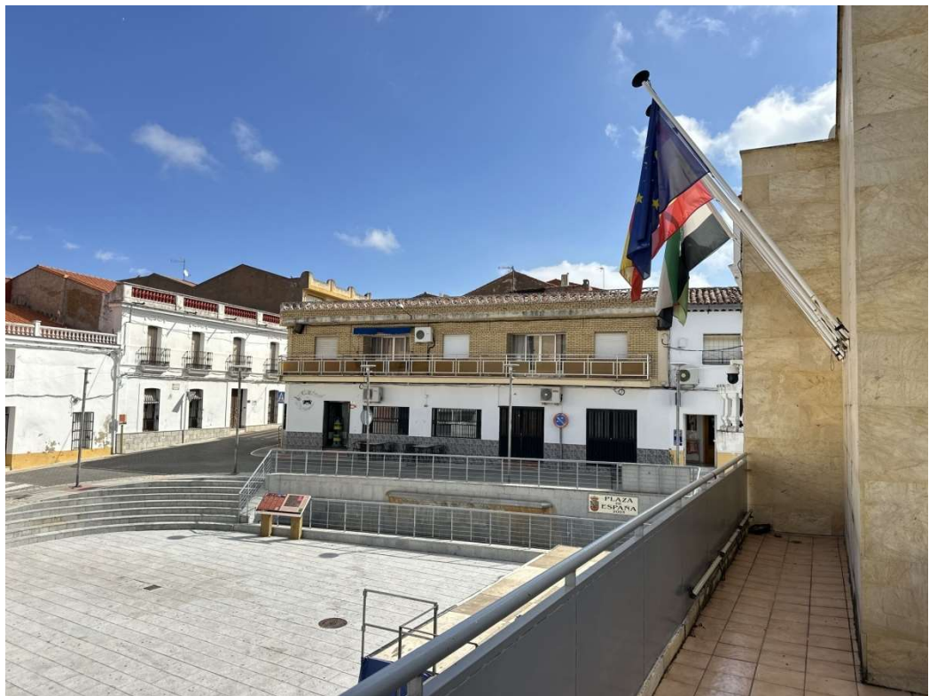
Images of the renovated Plaza de España viewed from the Town Hall.