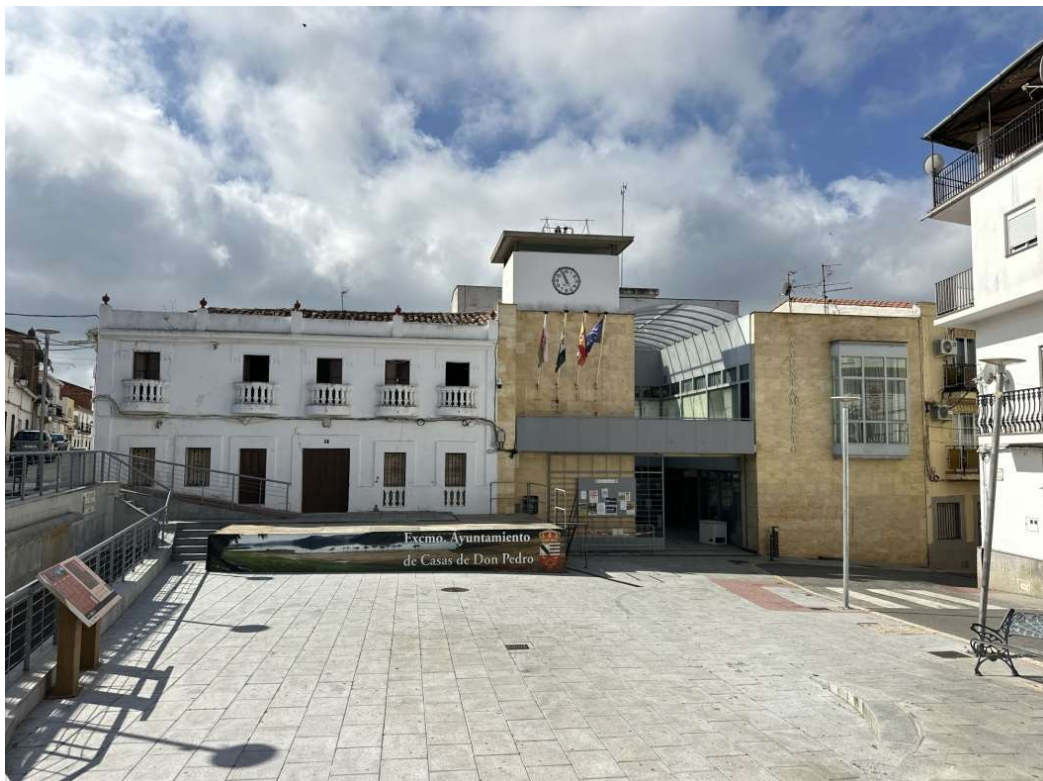
Image of the Plaza de España with the Town Hall in the background.