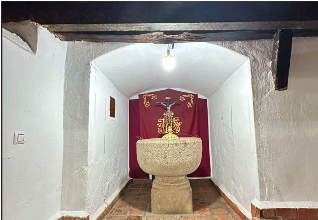
Granite baptismal font.