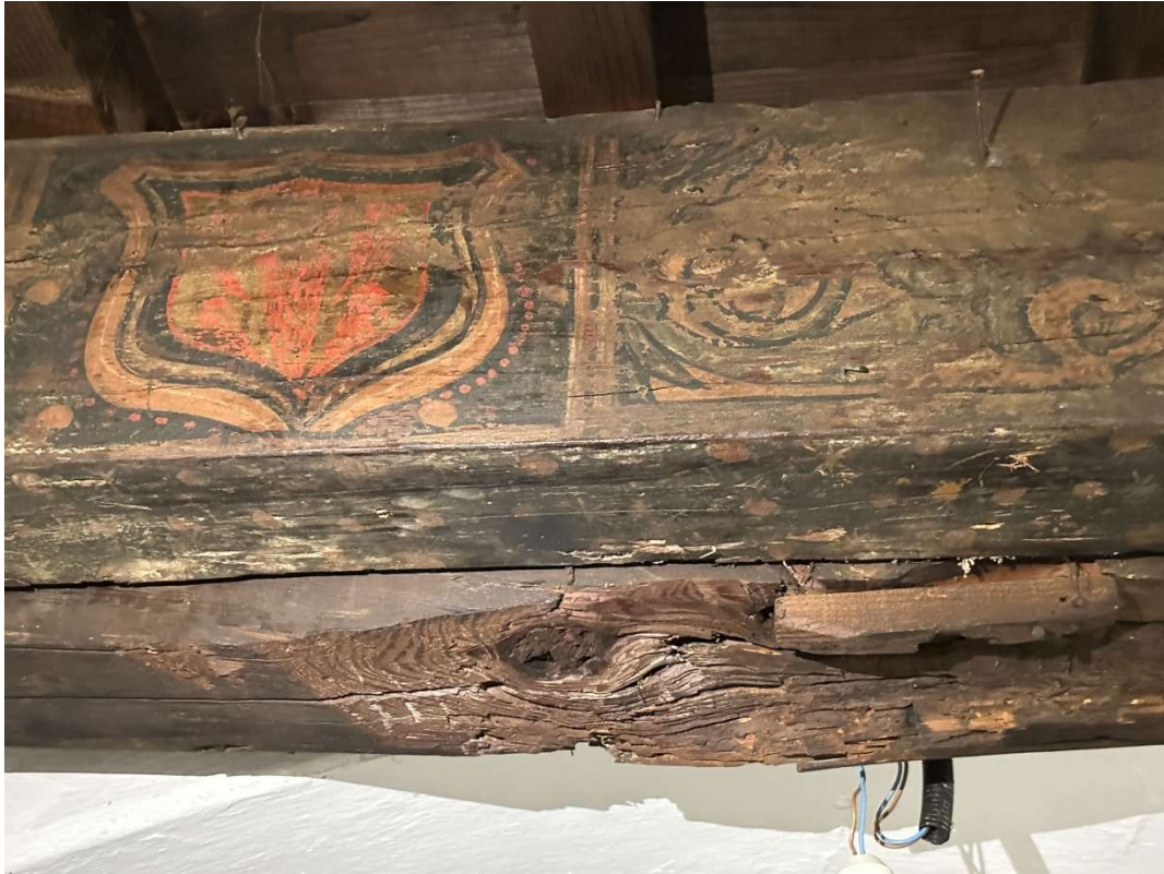
Polychrome wooden beam.