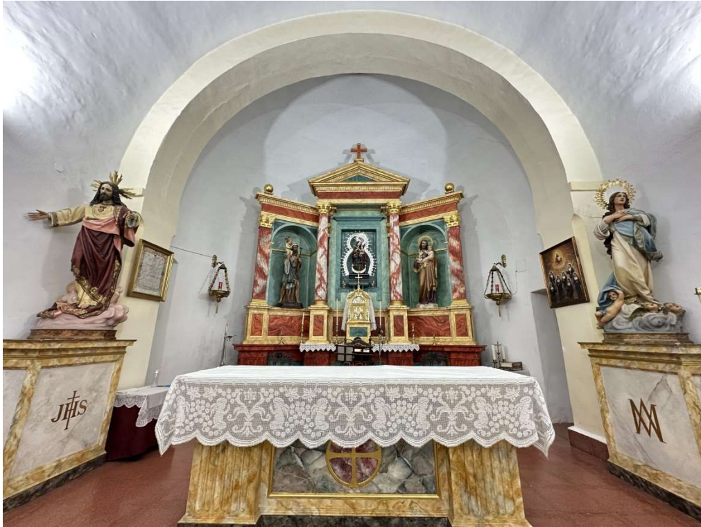
Detail of the presbytery and the altarpiece.