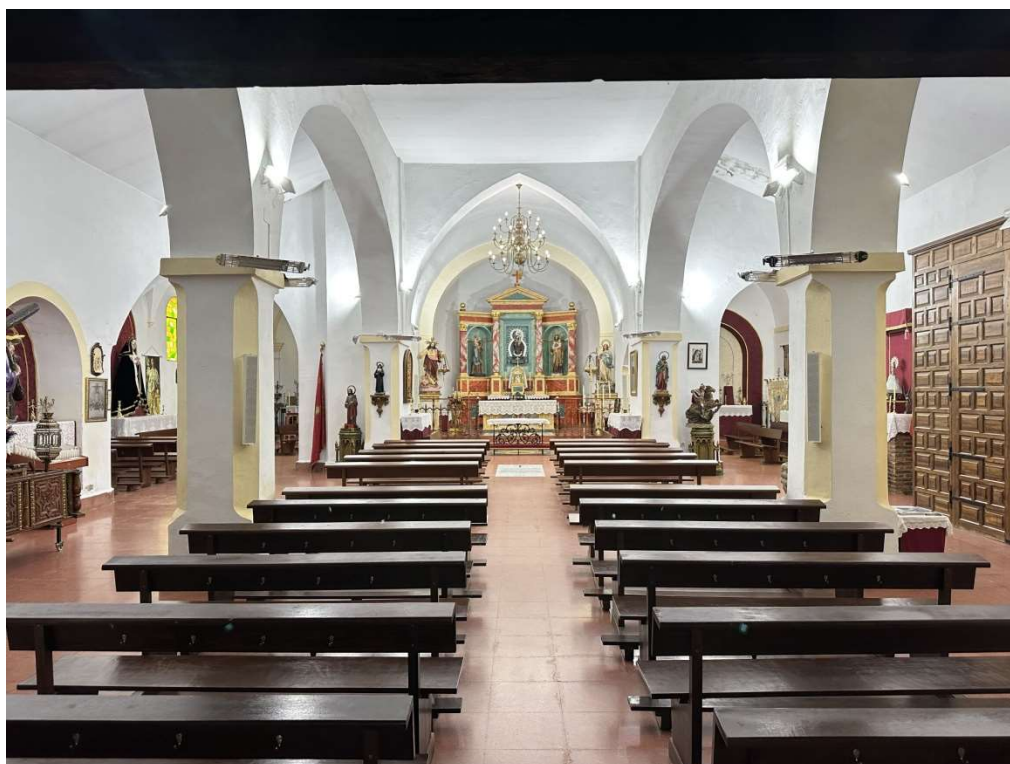
General view of the interior of the church.