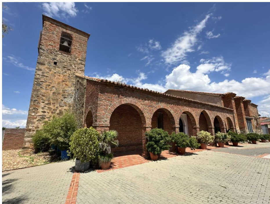
General view of the church.