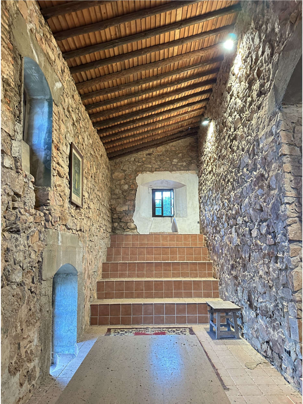
Interior room of the restored Casa del Santero.