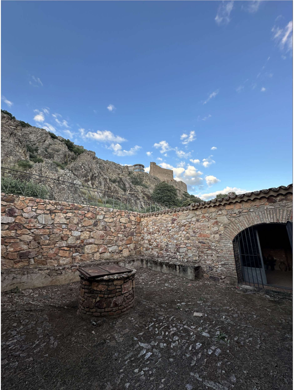
Courtyard and well in the Casa del Santero.