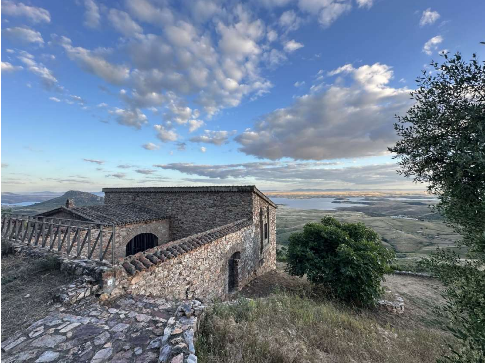
Exterior and interior views of the Casa del Santero.