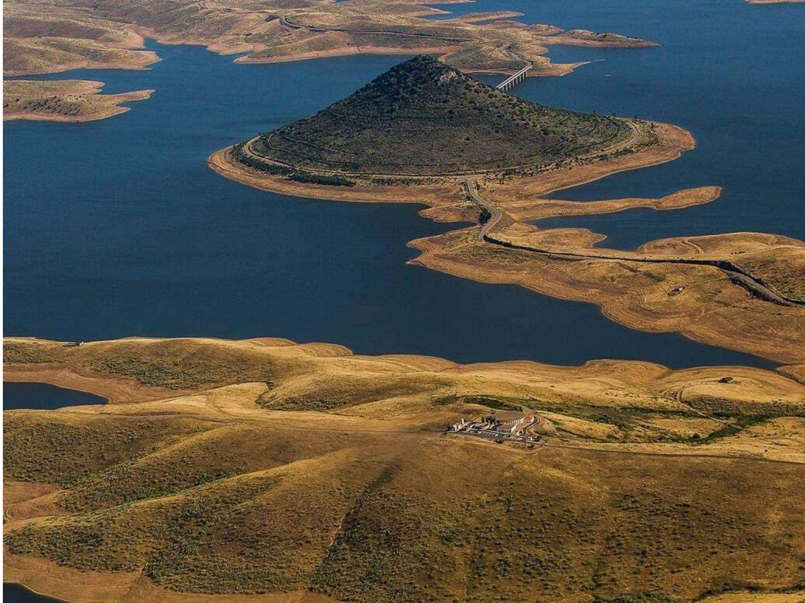
The geometric singularity of the hill has made it the setting for numerous promotional campaigns.