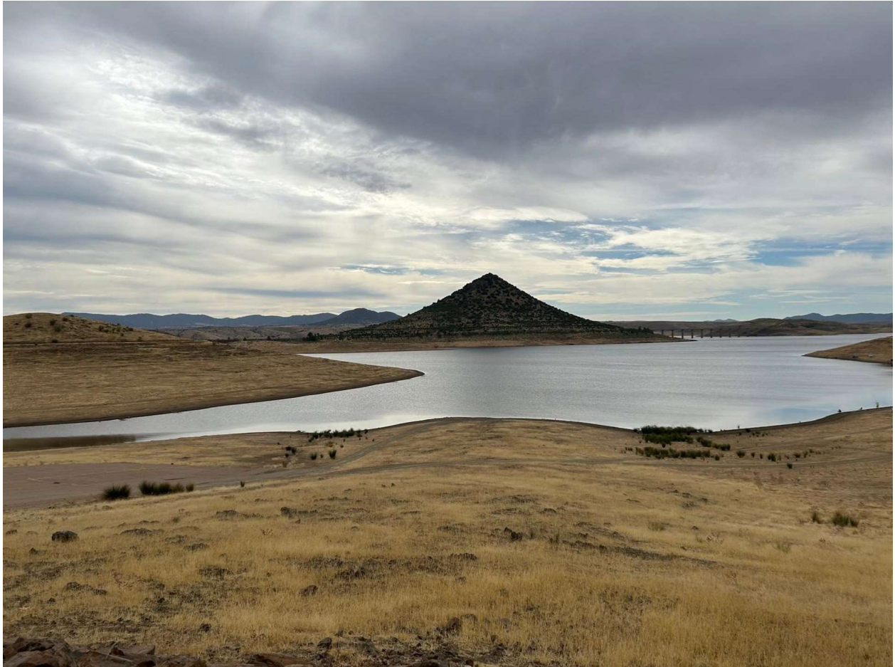
In addition to its impressive views, the site has great environmental value.