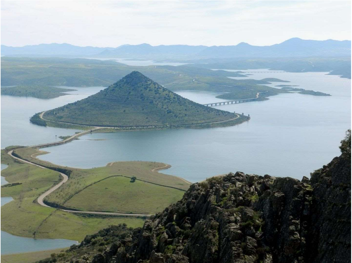
Cerro Masatrigo, declared a Natural Monument of Extremadura in 2023.