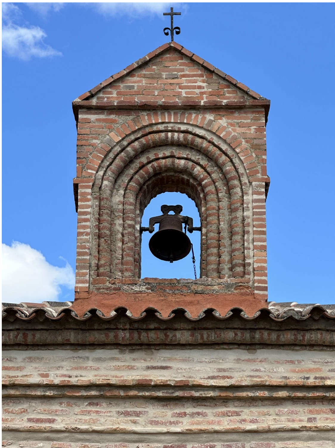
Brick bell gable with bell on the hermitage.