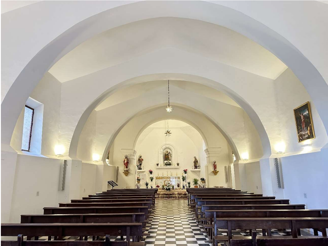
General view showing the four semicircular arches supporting the beams, floor structures and roof.