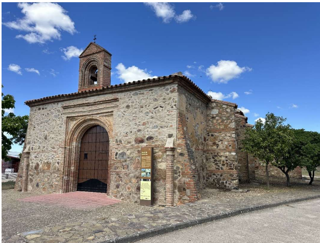
Views of the hermitage from different angles.