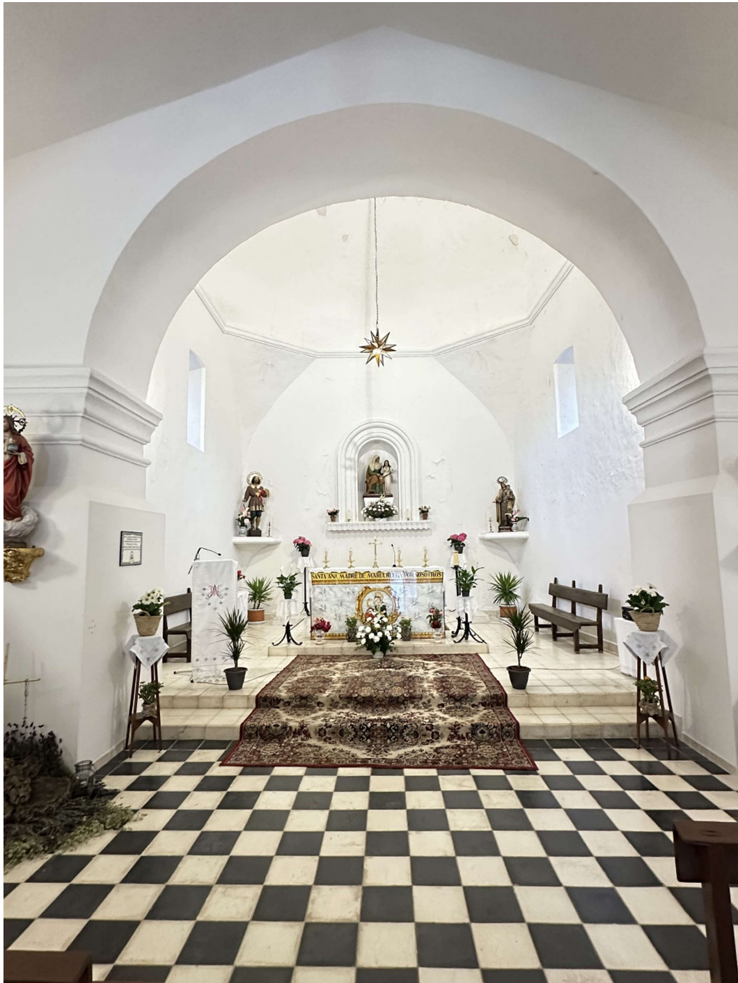
Hemispherical dome resting on an octagonal base supported by the walls and the arch.