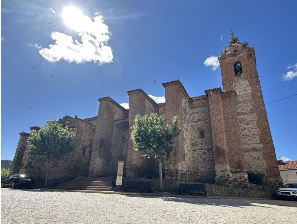
Exterior view of the temple (above) and interior view.