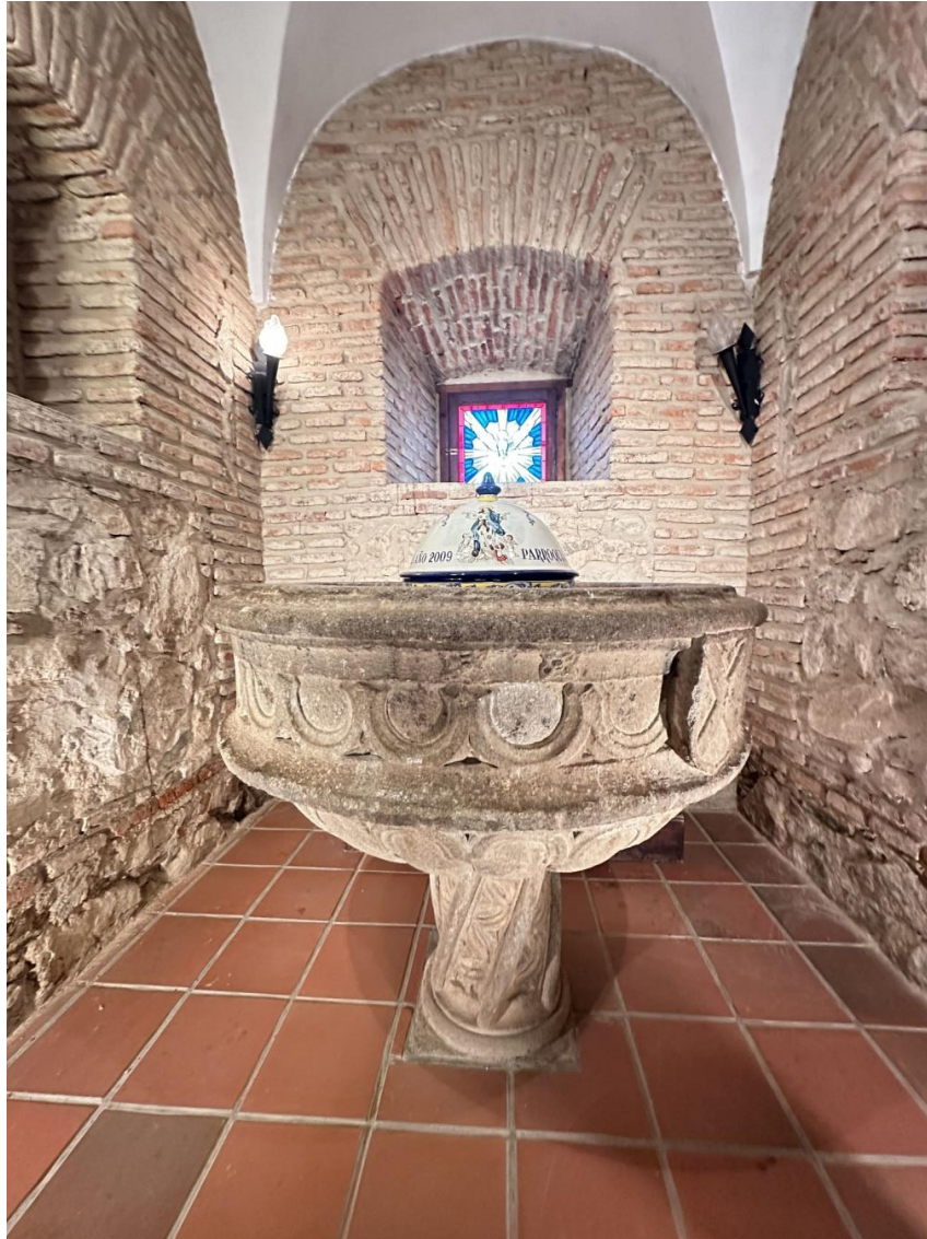
Image of the granite baptismal font, dating from the year 1515.