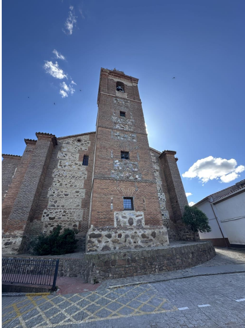
Façade of the church, featuring a solid stone and brick construction.