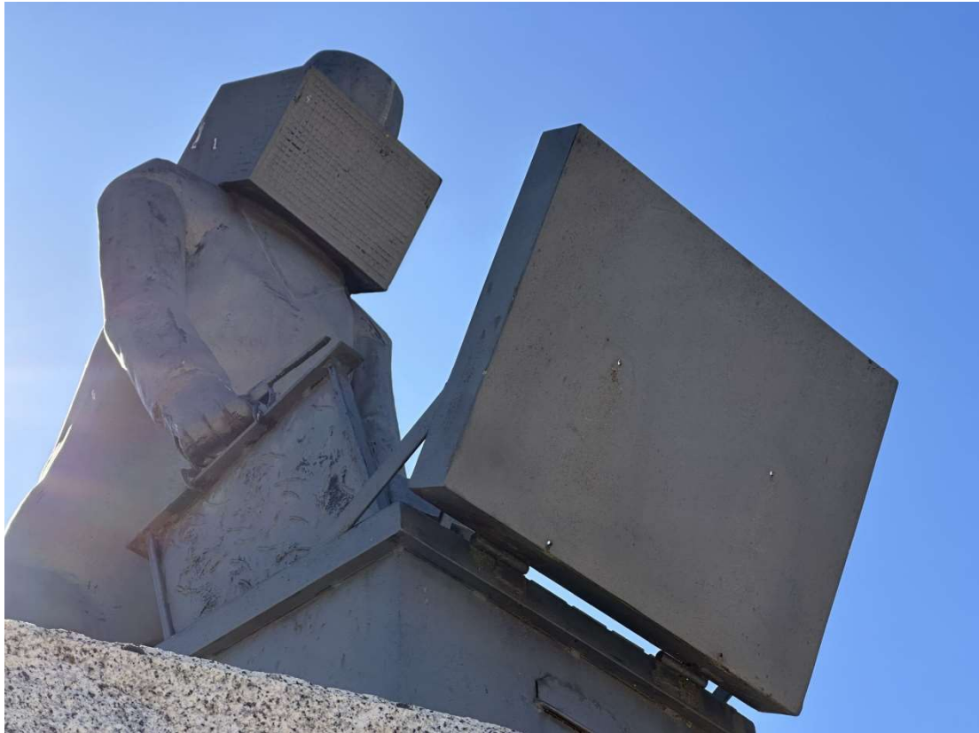
Images of the monument to beekeeping located next to Parque de Santa Ana.