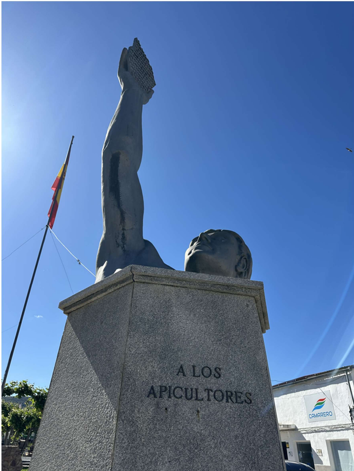
Granite base and bronze sculpture paying tribute to the beekeepers.