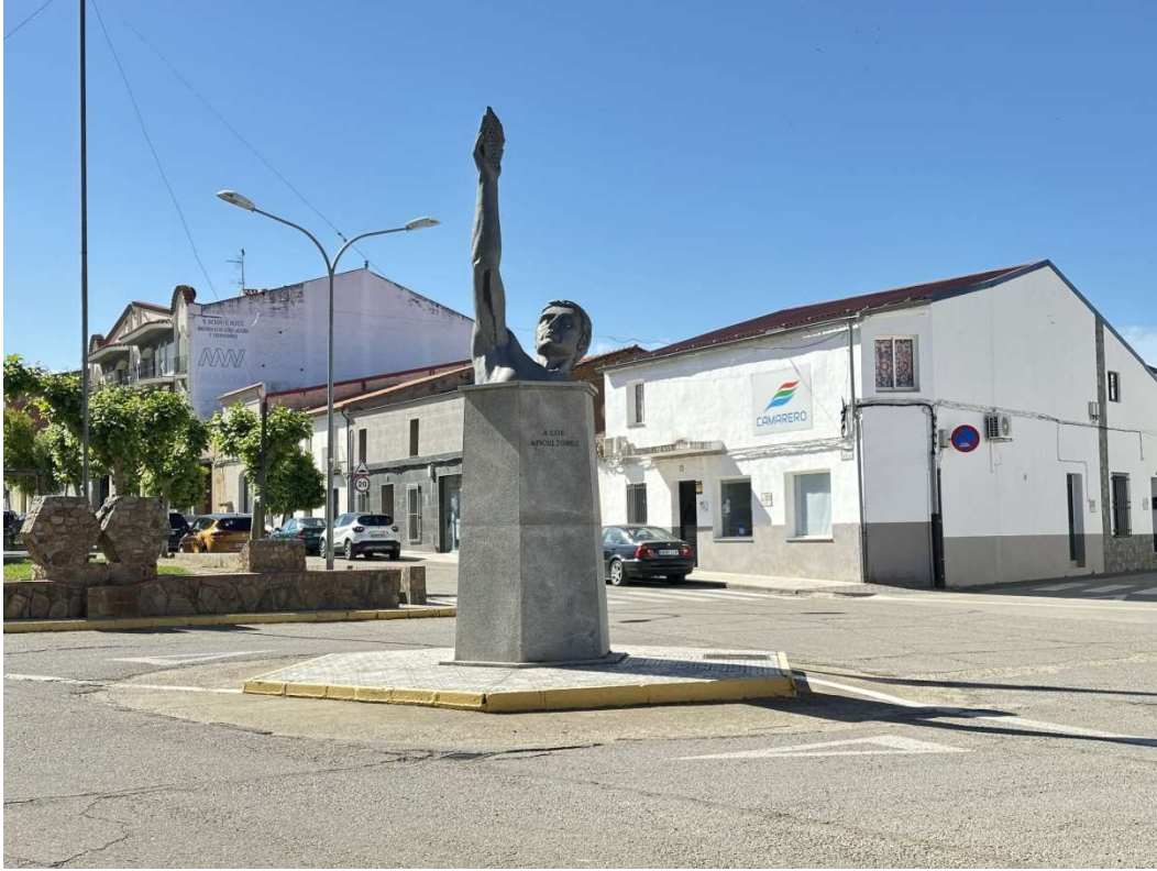
Monument to the beekeepers in Parque de la Constitución.