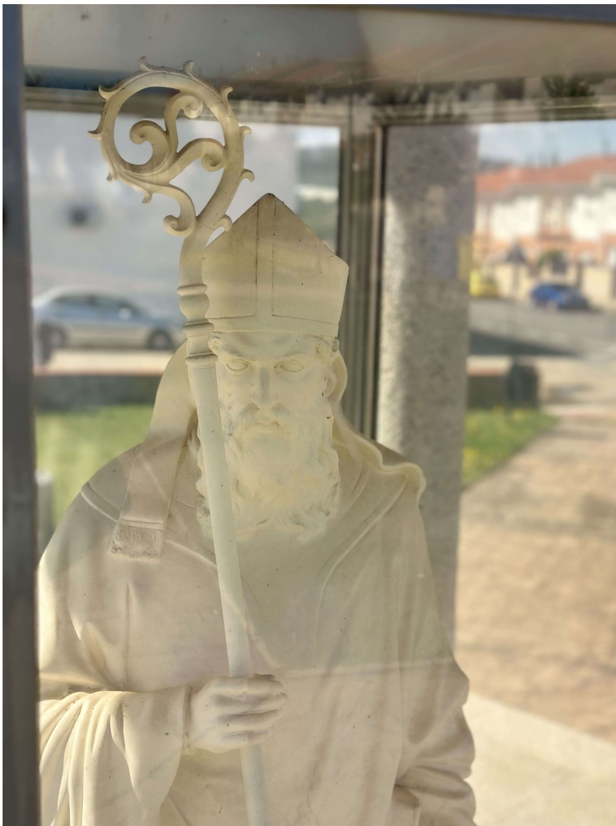
Image of San Ambrosio in the park of the same name.