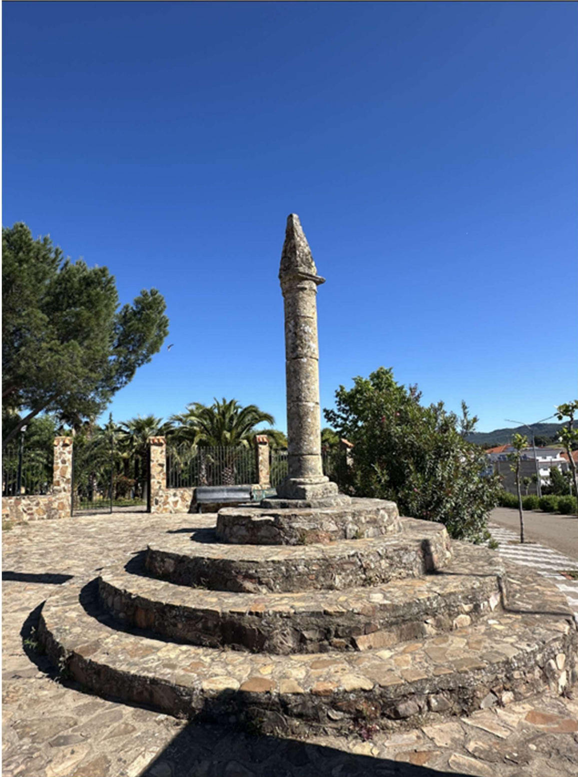
Stepped base on which the Rollo de Santa Ana stands.