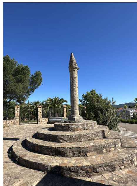
Images of the Rollo de Santa Ana.