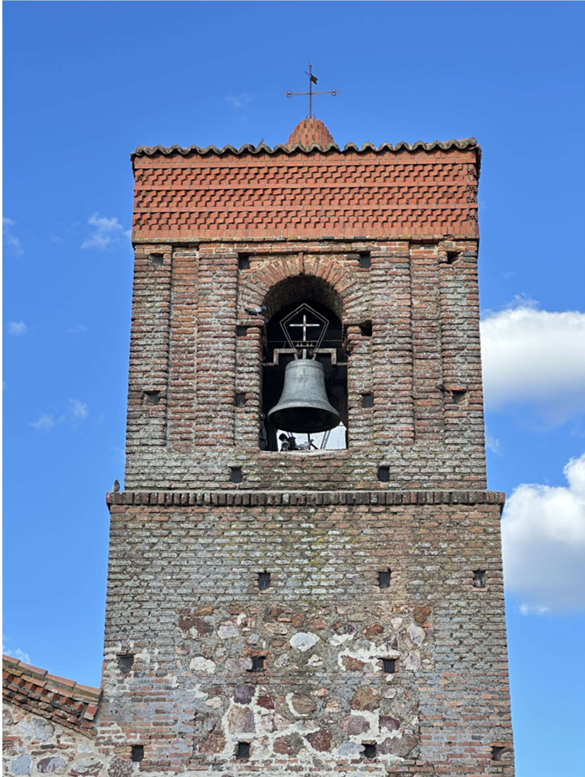
Detail of the quadrangular tower integrated into the temple façade.