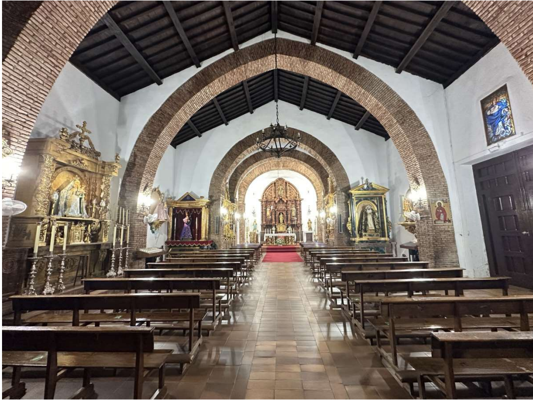
Main nave divided into four sections by pointed arches supporting the wooden roof.