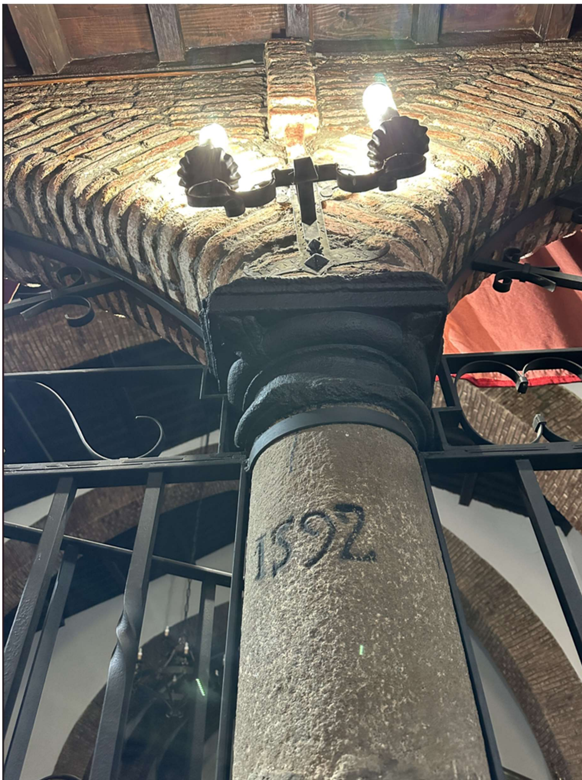
Inscription on one of the stone columns at the entrance to the temple.