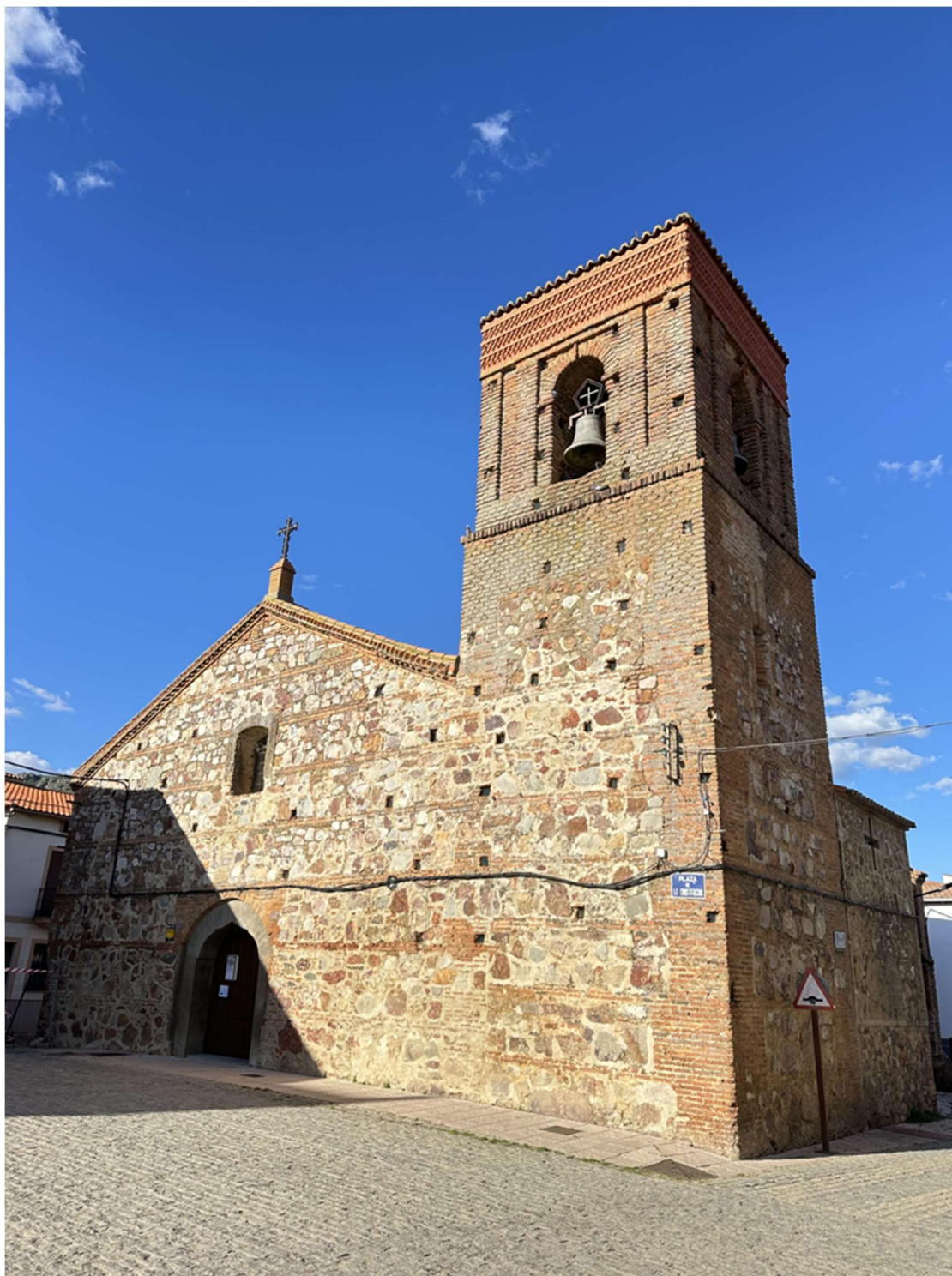
Main façade of the church.