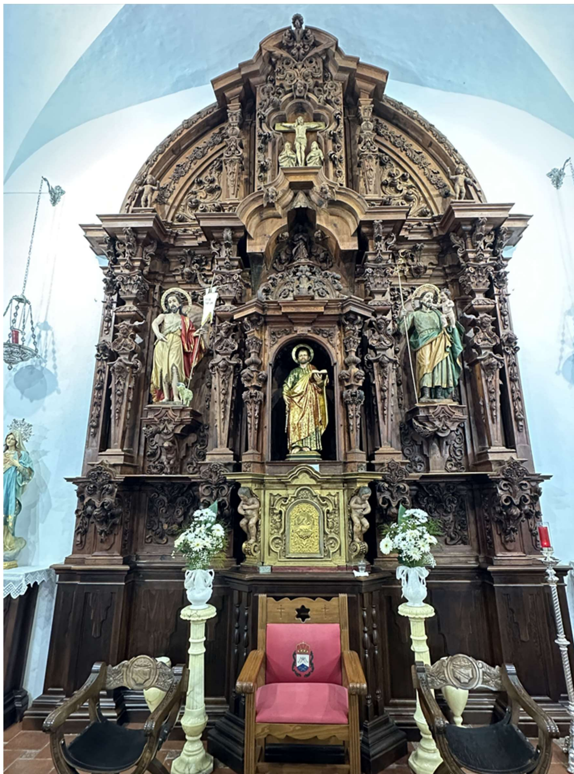
Recently restored Baroque main altarpiece with images of San Juan, San Pedro and San José.