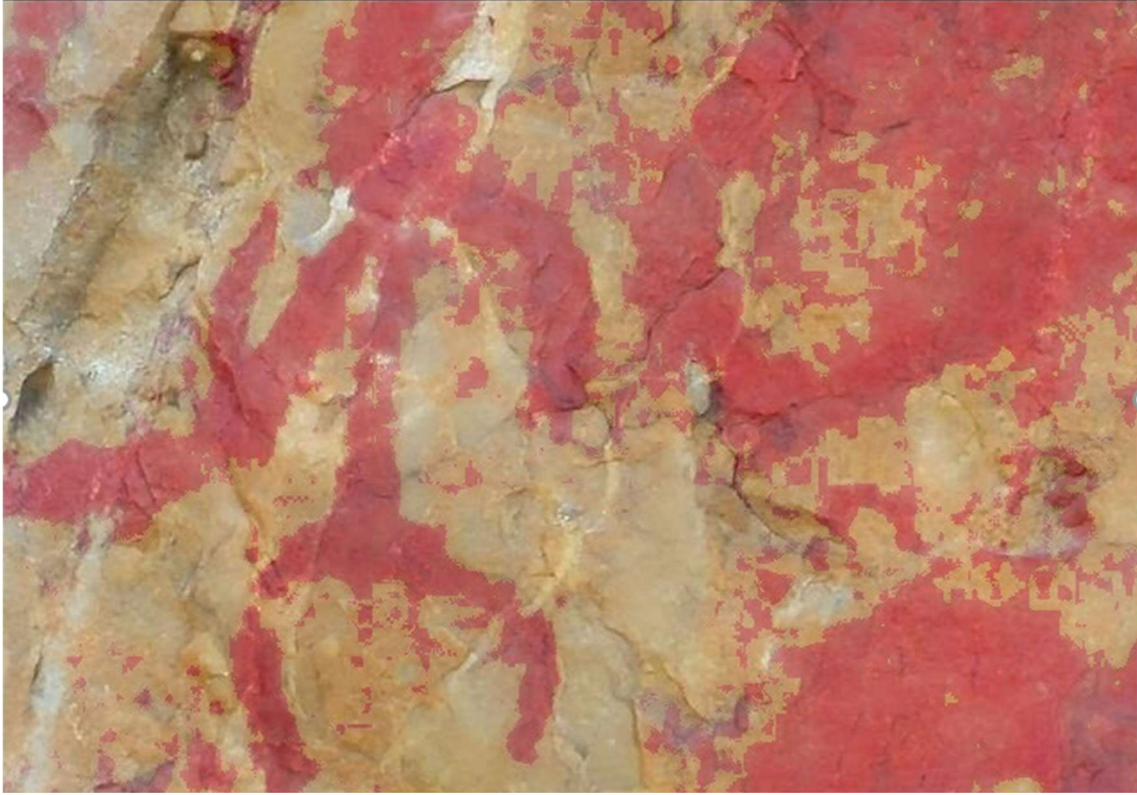
In the images, human and animal figures in the paintings.