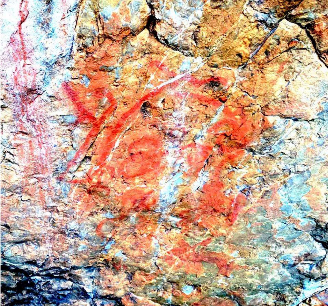
Detail of the paintings on the Stone.