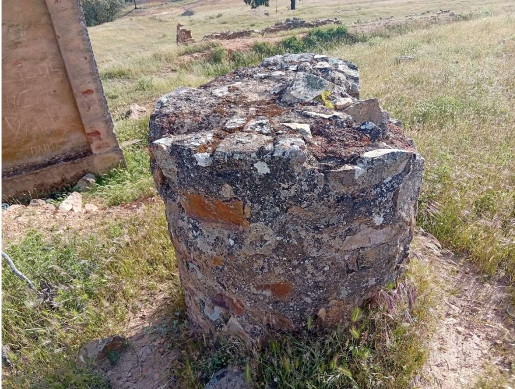
Roman remains found in the area.