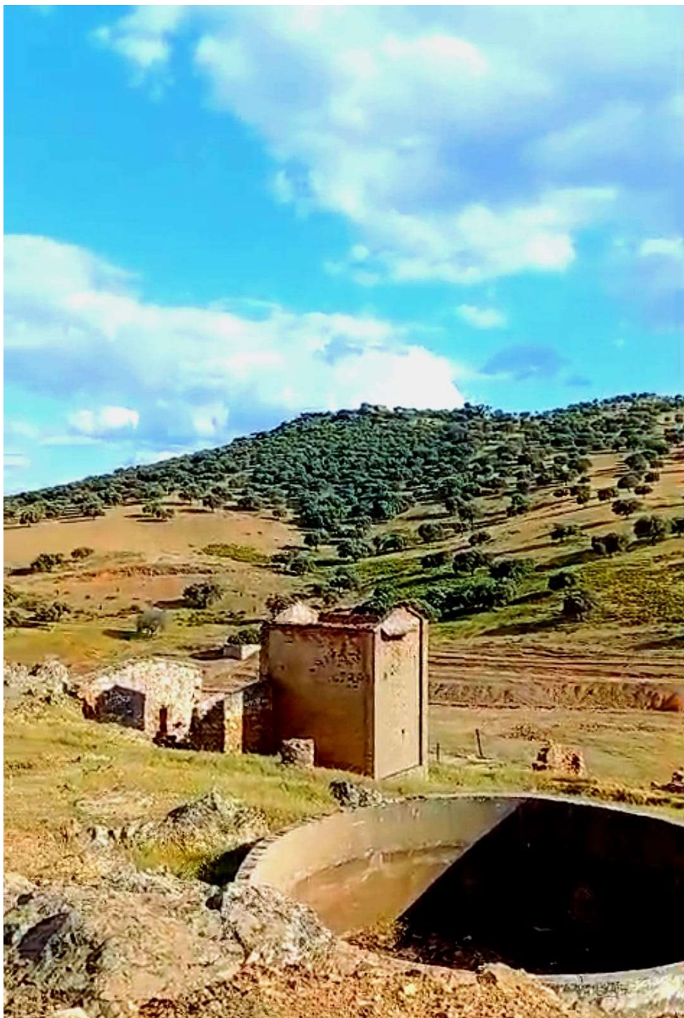
The ensemble forms part of the extensive Roman heritage preserved in the comarca of La Siberia.