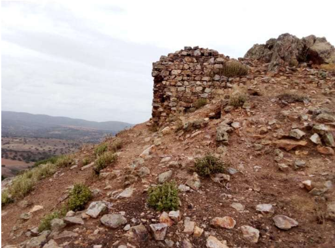
La Minilla forms part of the historical and archaeological memory of Garlitos.