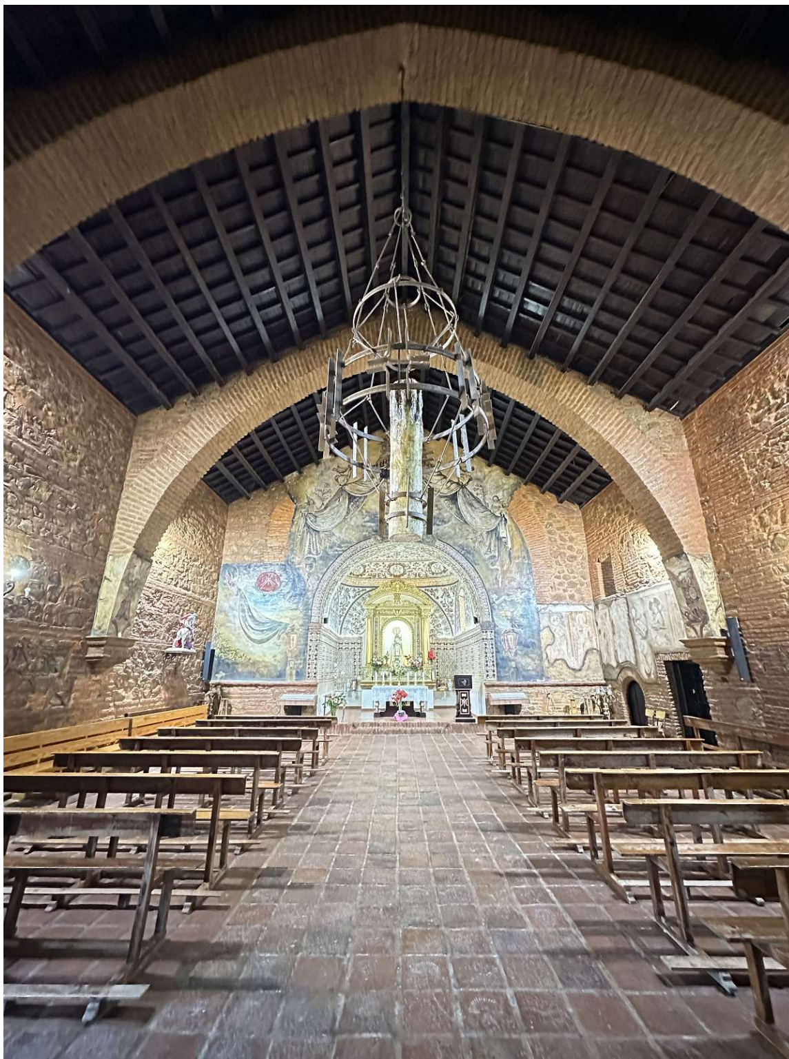
Interior of the hermitage.