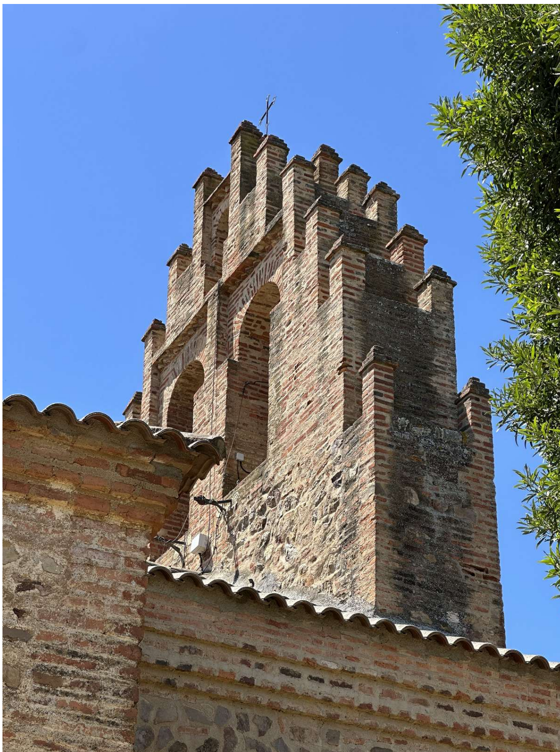
Stepped bell gable of the hermitage.