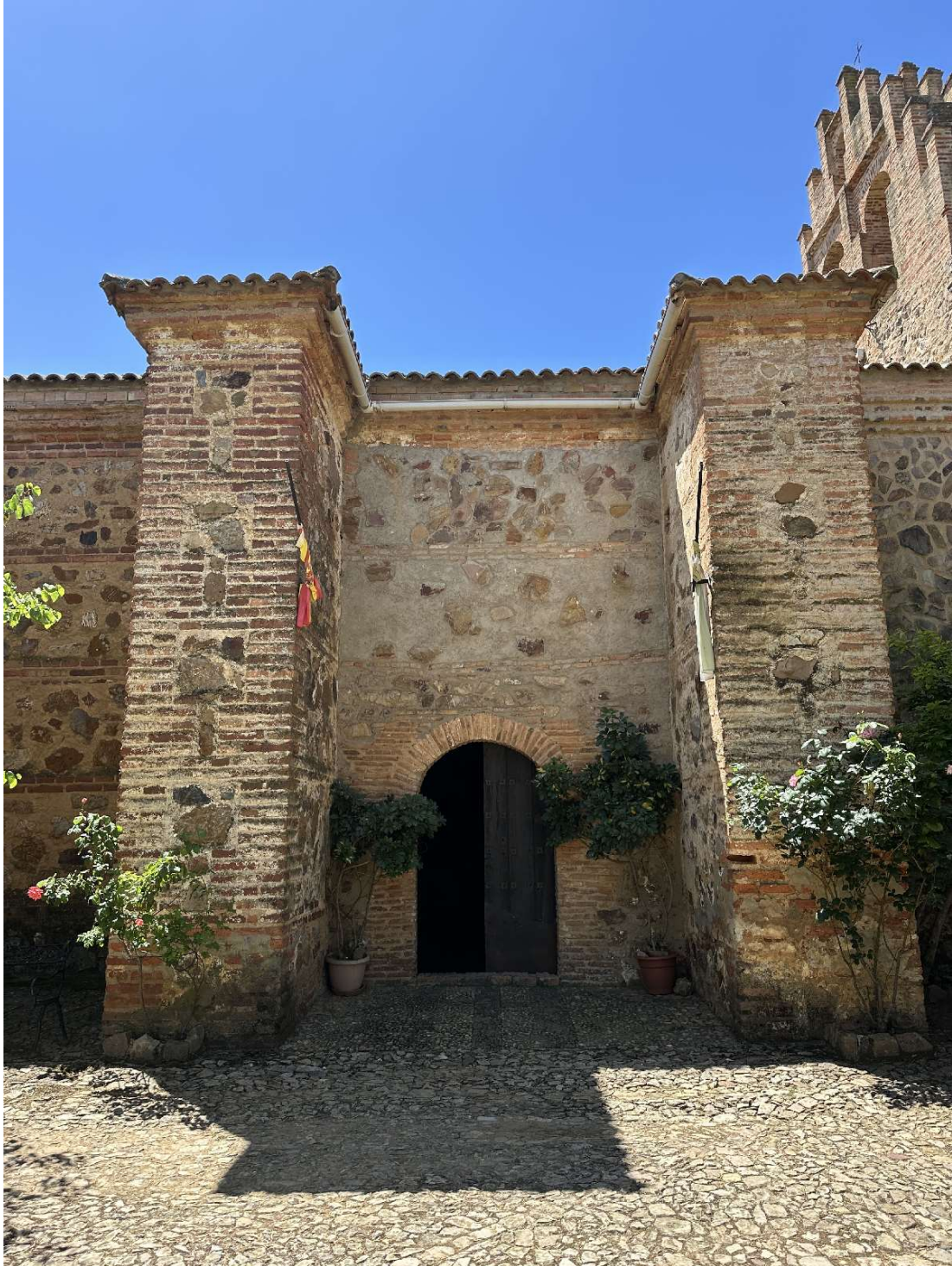
Main entrance to the hermitage.