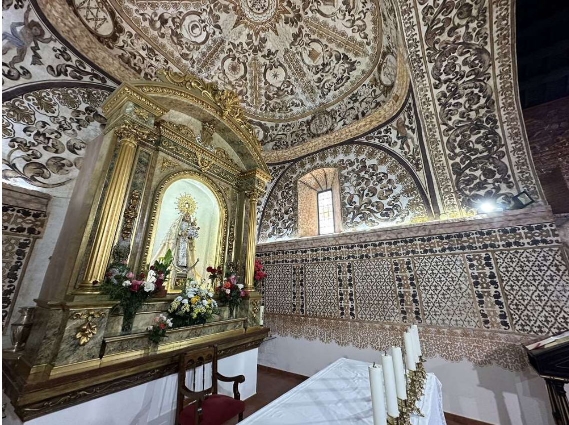
Presbytery and dome of the hermitage.