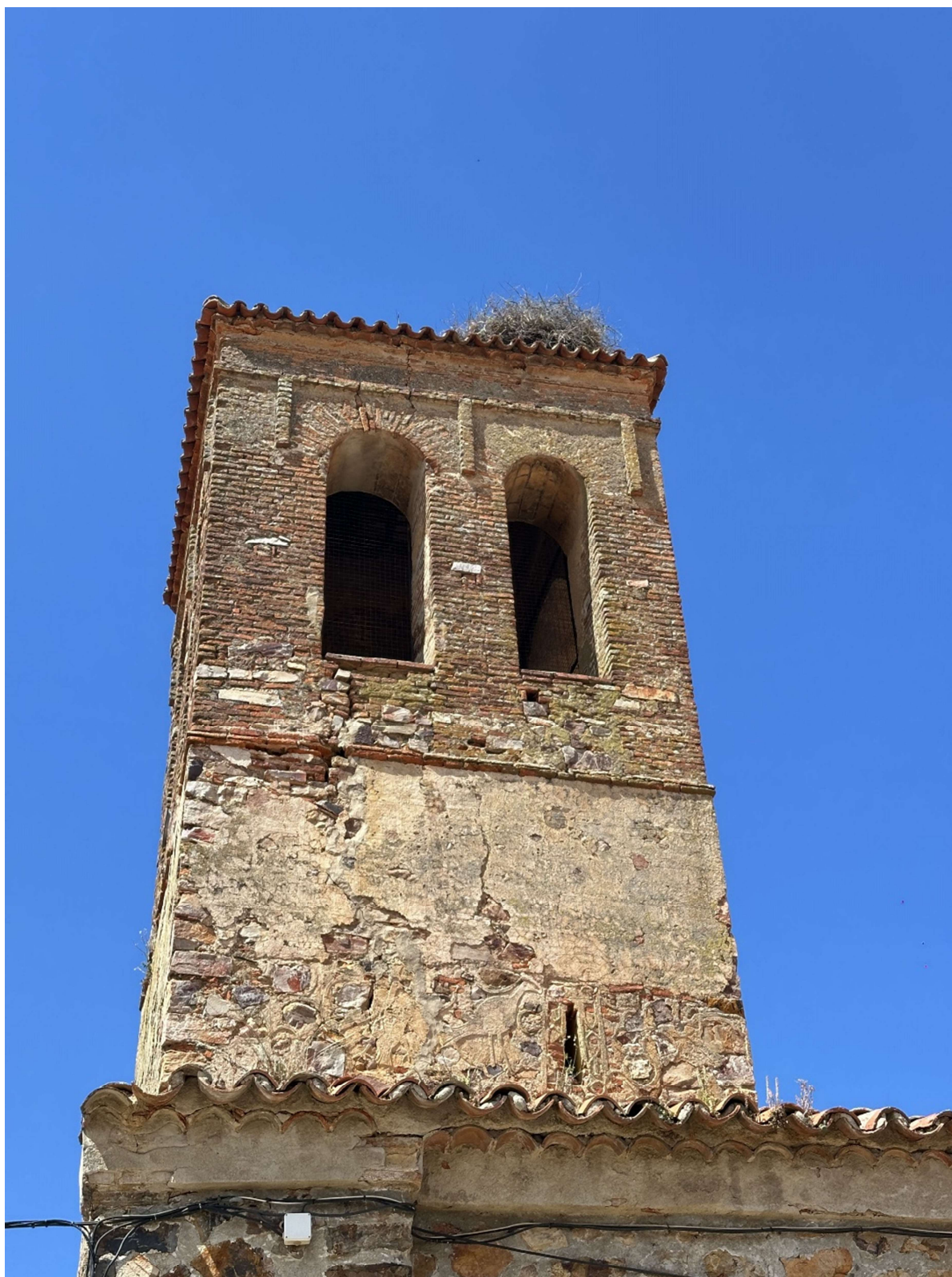
The tower constitutes one of the building's singular elements and shows two differentiated construction phases.