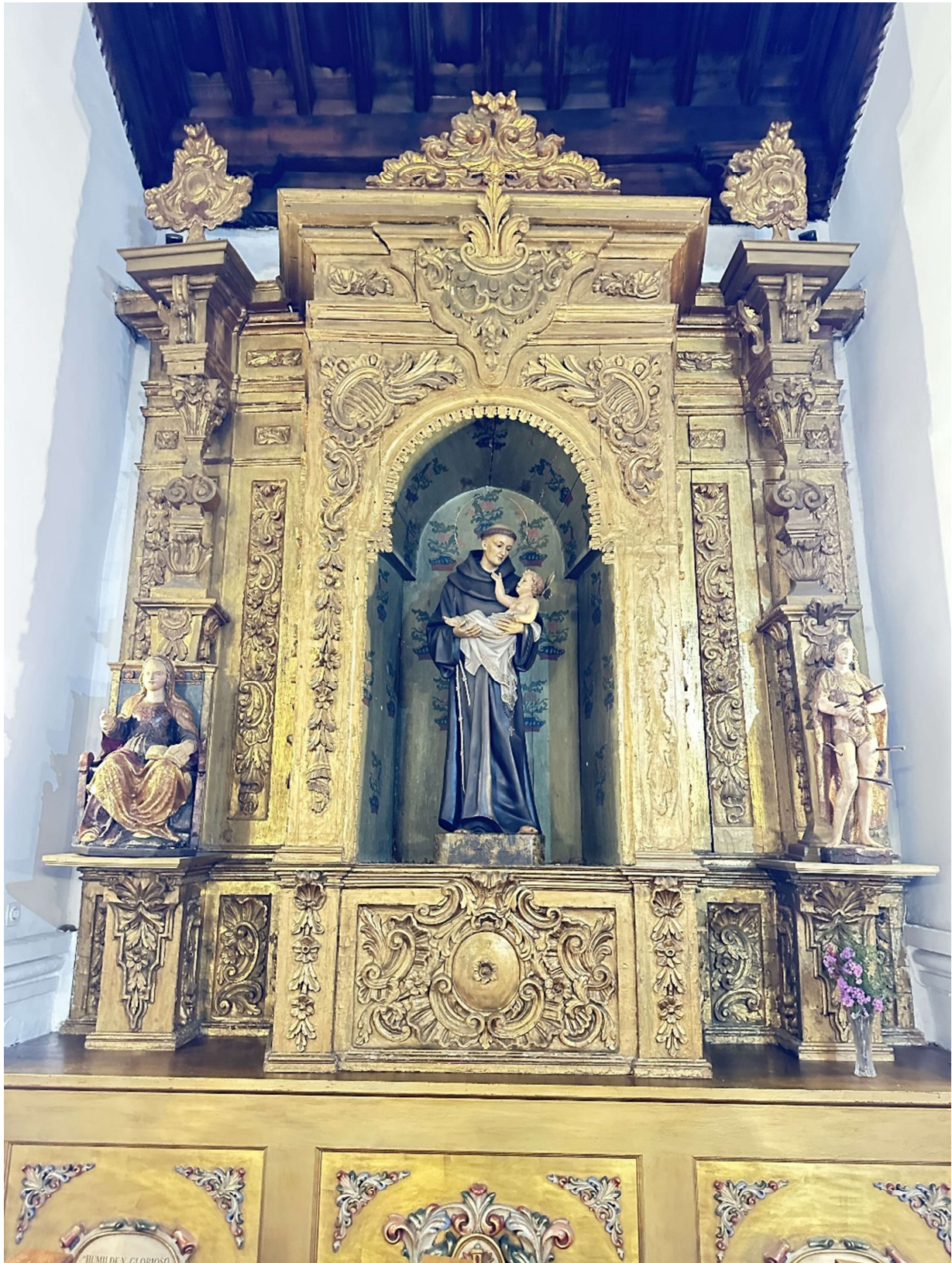
Detail of the church interior.