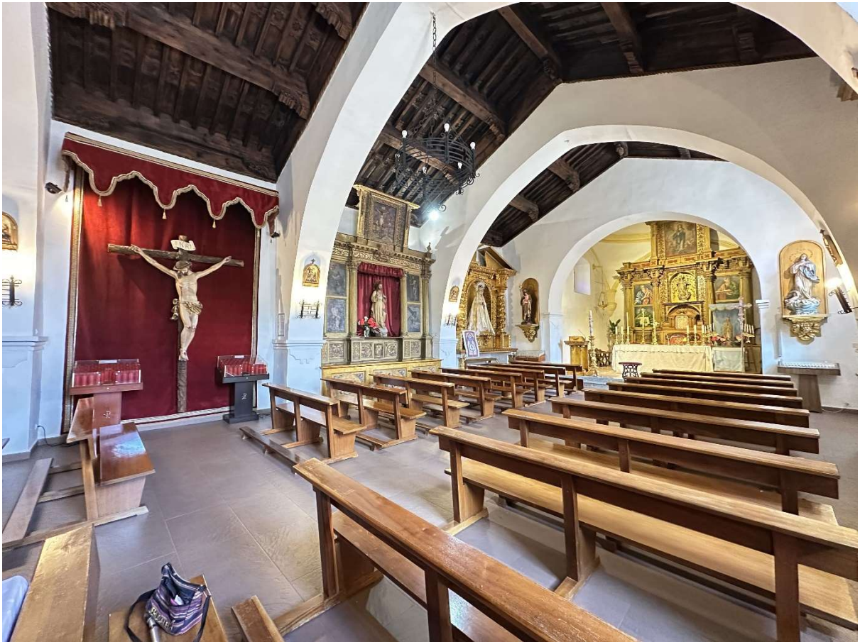
View of the church showing the wooden ceiling.