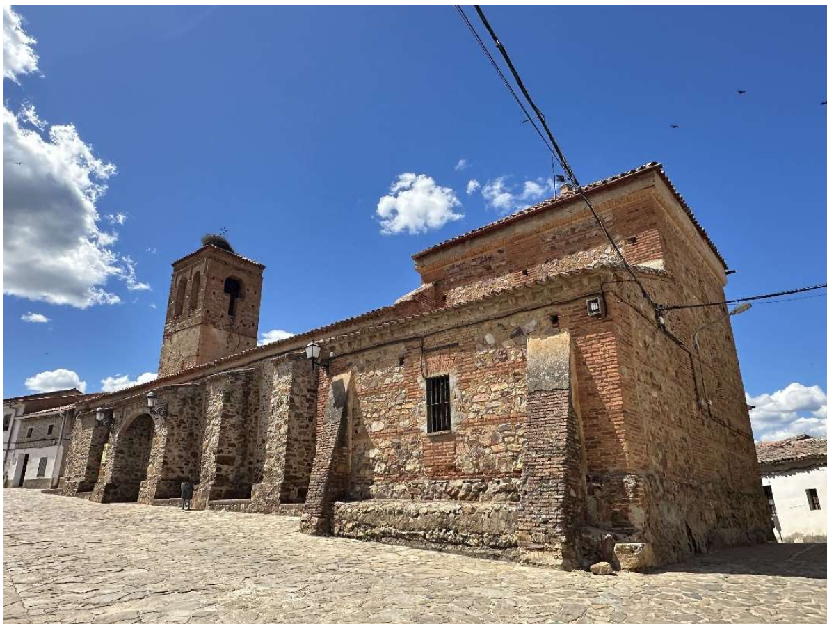
View of the church, showing a model of rural religious architecture developed within the Extremaduran Mudéjar tradition.