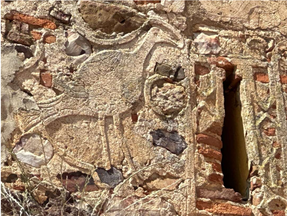
Detail of a dove sculpted on the church façade.