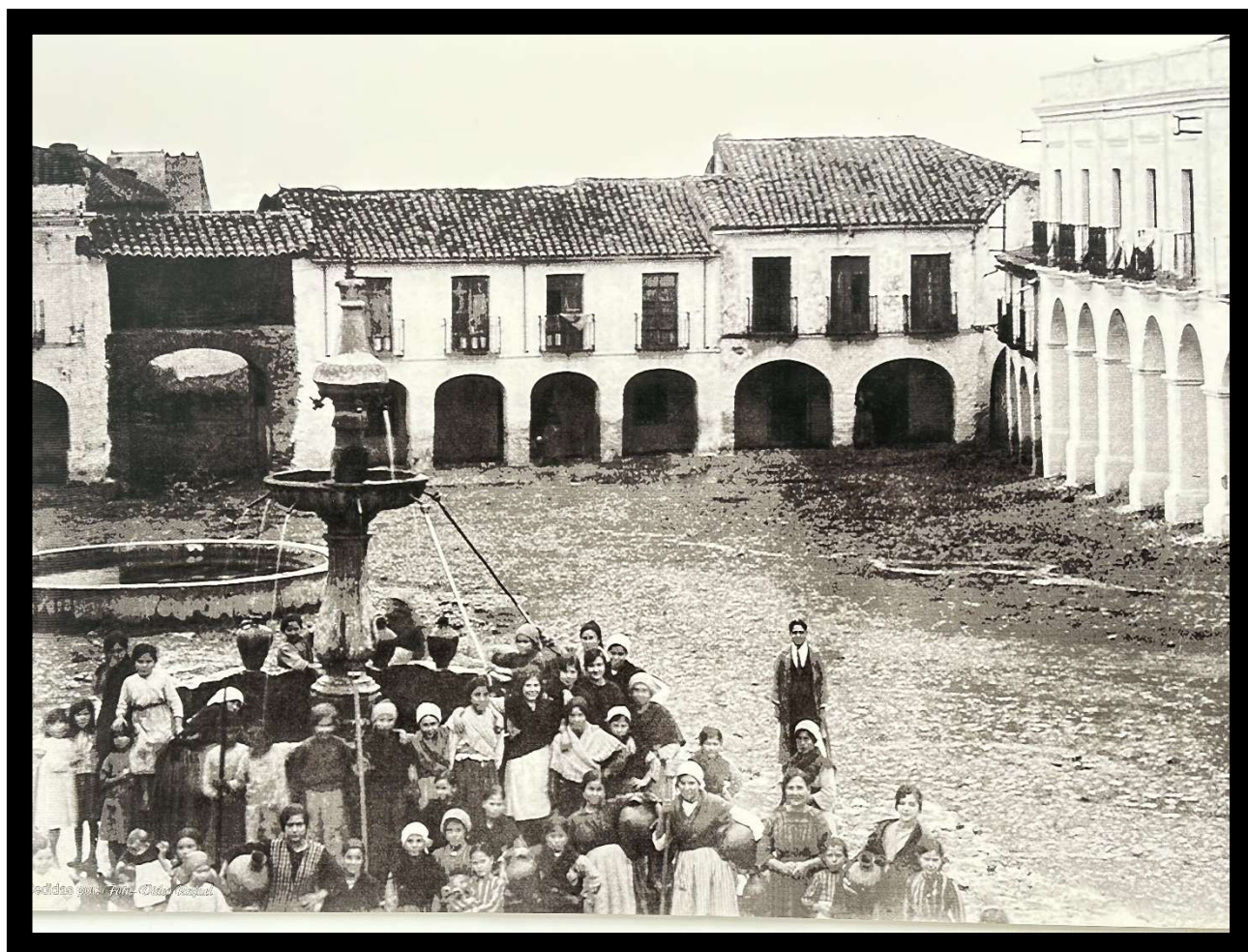
Residents in the square when the town hall originally stood in this location.