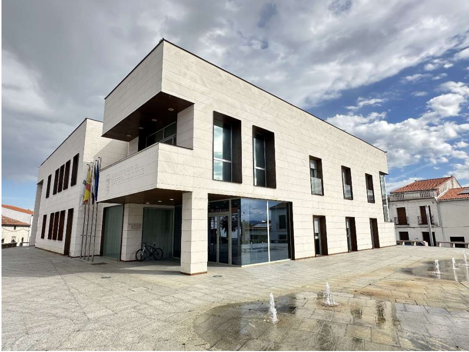
The current town hall seen from different angles.