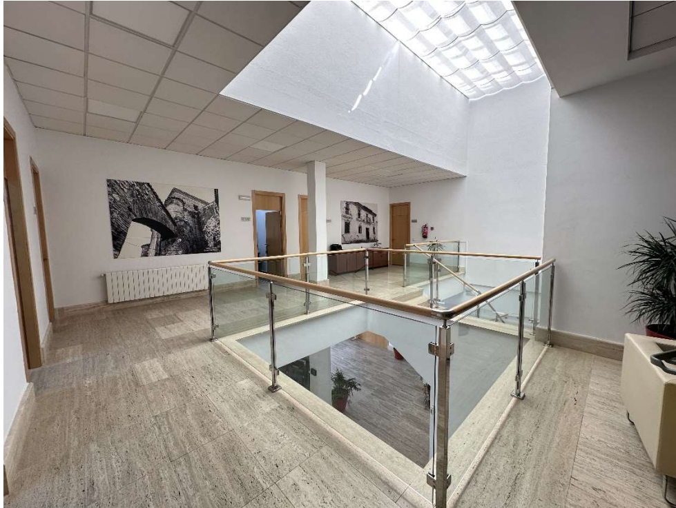
Interior of the town hall facilities.