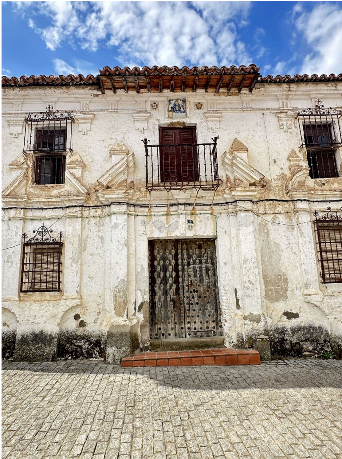
Detail of the façade, entrance door, iron grilles and roof structure, which retain their original appearance.