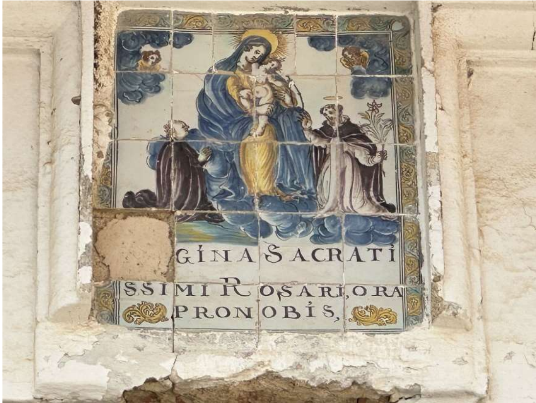
Tile composition located on the upper part of the Casa de los Chacones.