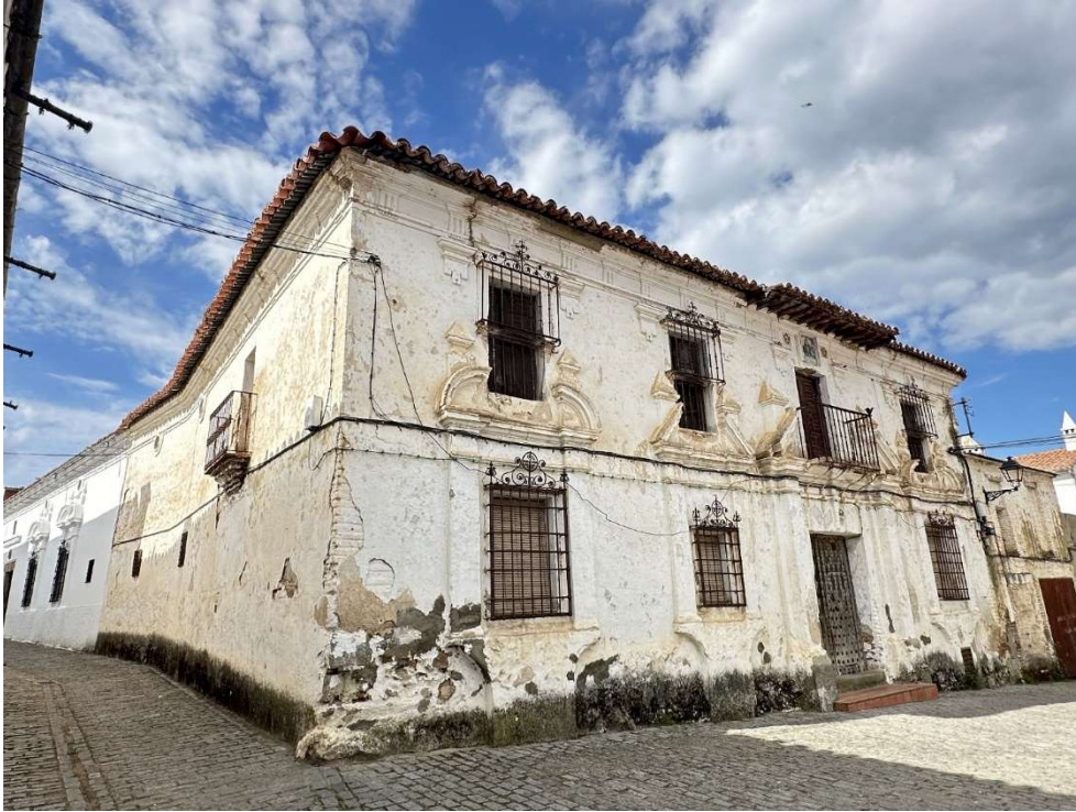
View of the Casa de los Chacones on Calle San Juan, Herrera del Duque.