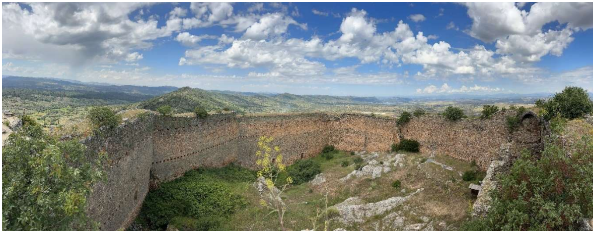
Panoramic view of the fortress.