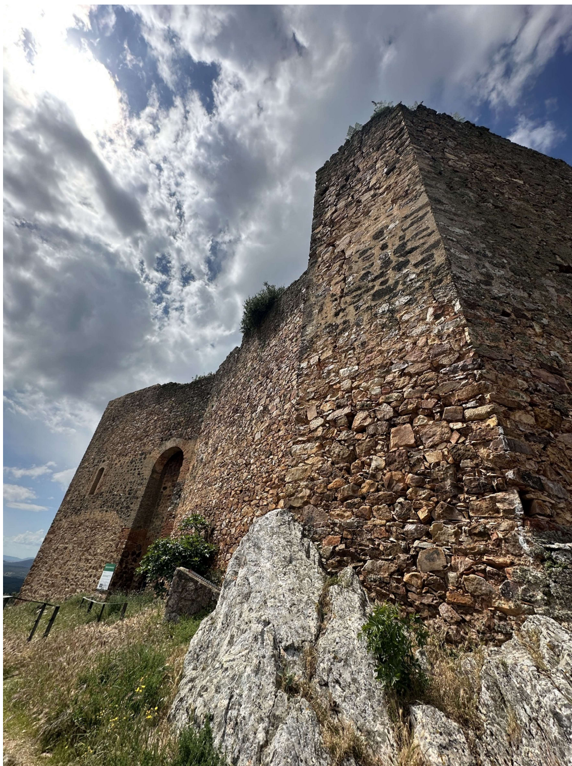
Side view of the castle and access area.