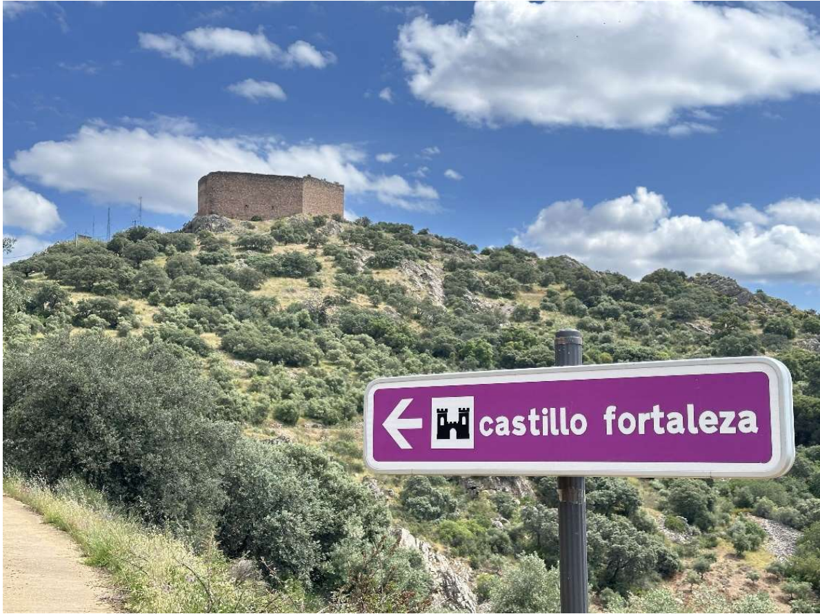
Road leading to the castle with the fortress at the top.