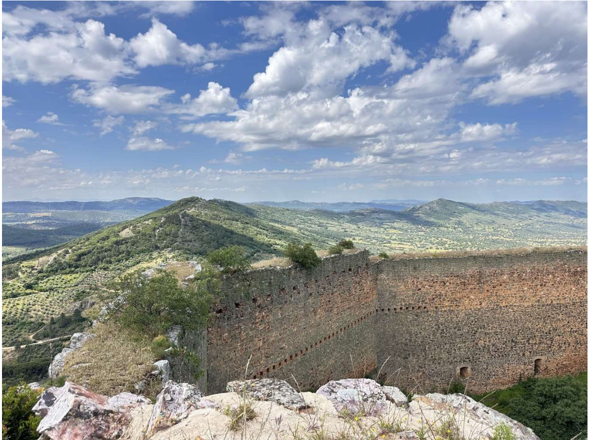
Impressive views of the La Siberia region from the top of the castle.