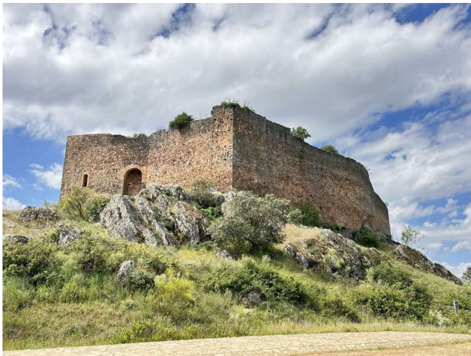
Exterior view of the castle.