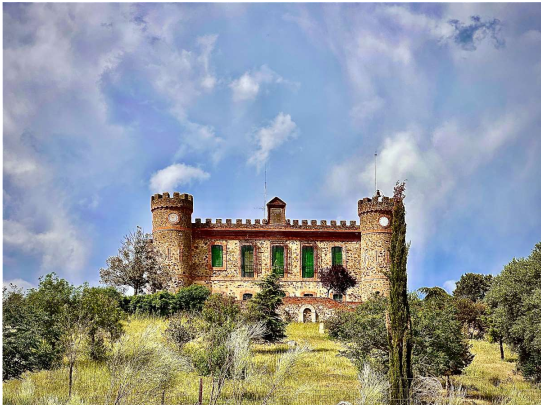
The Palacio de Cijara has undergone various transformations over time.