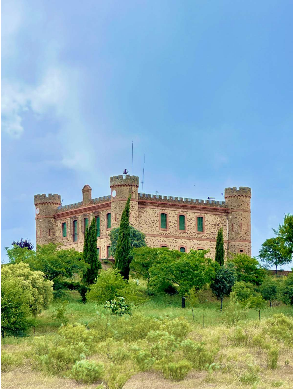
Several elements of the original enclosure have disappeared or have been modified, but the building continues to preserve much of its landscape, architectural and historical value.