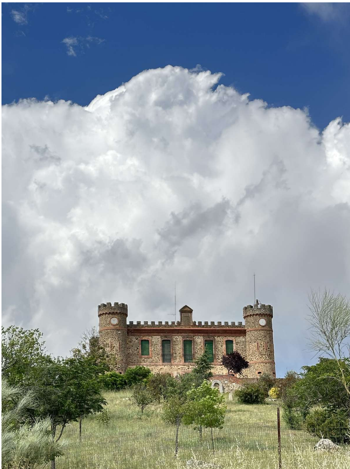
Cloud formation over the Palacio de Cijara.