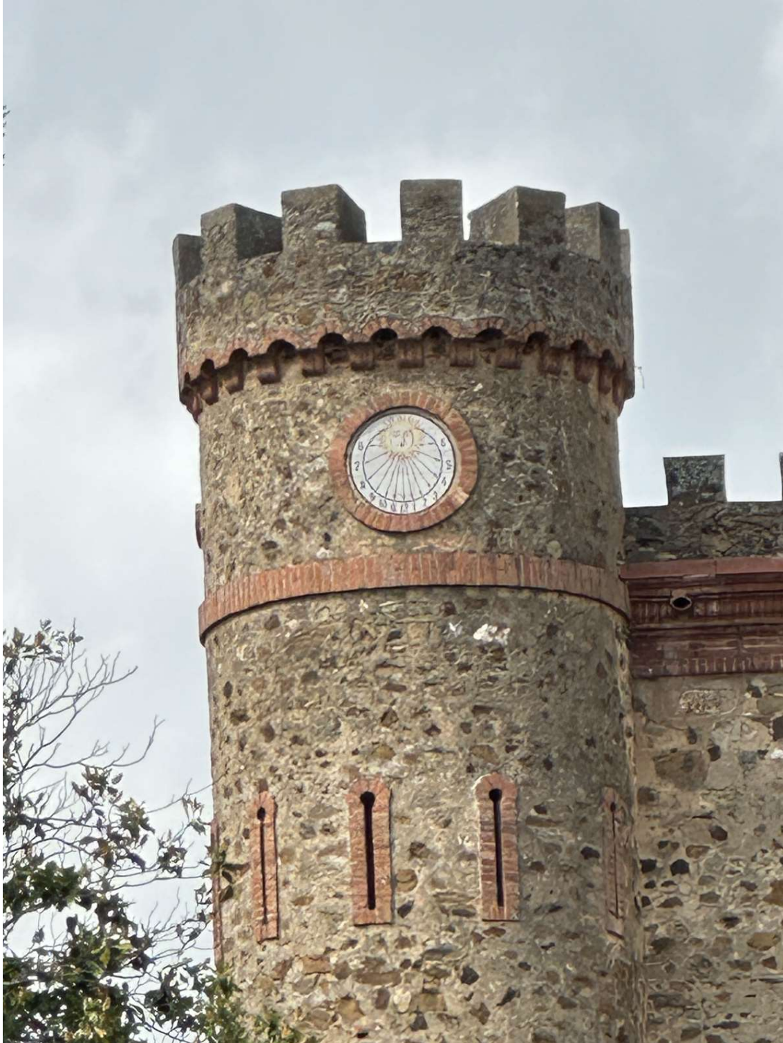
The complex presents a powerful rectangular structure reinforced by high circular towers at the corners