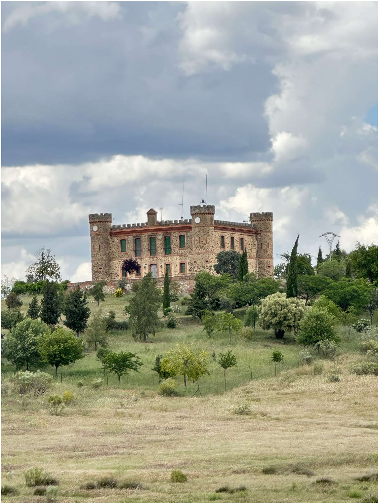
According to some scholars, the palace sought to symbolically recover the memory of the manor house of La Golosilla.