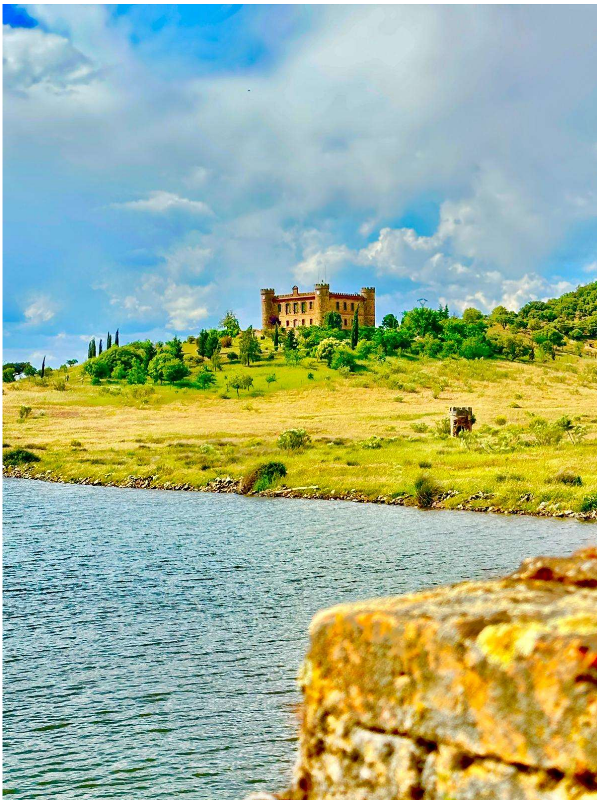
View of the Palacio de Cijara from the nearby bridge that provides access.