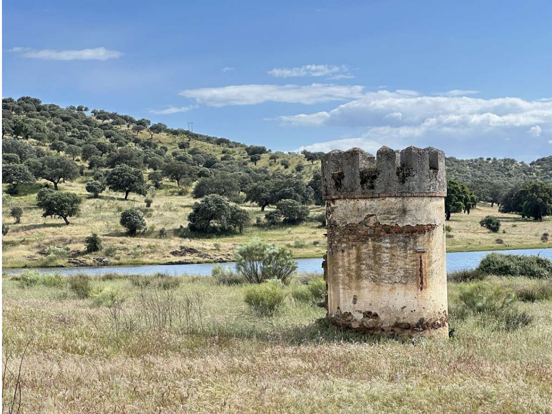
The palace also served as a concentration camp.