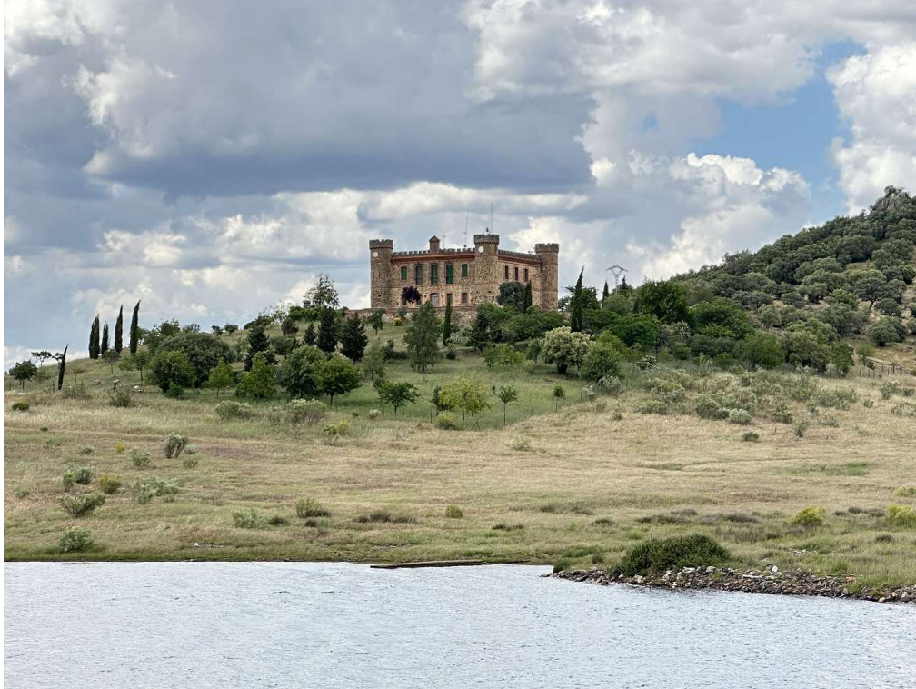
The palace is integrated into a landscape of extraordinary environmental value.