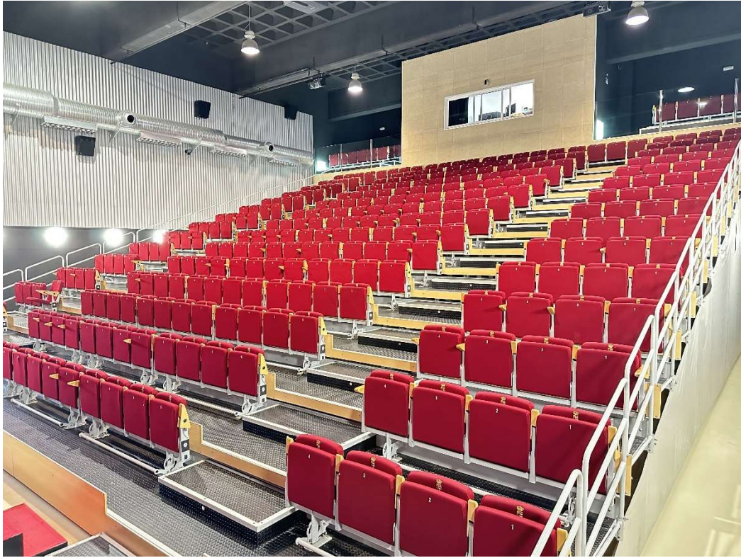
View of the auditorium from another perspective and interior corridor of the facilities.