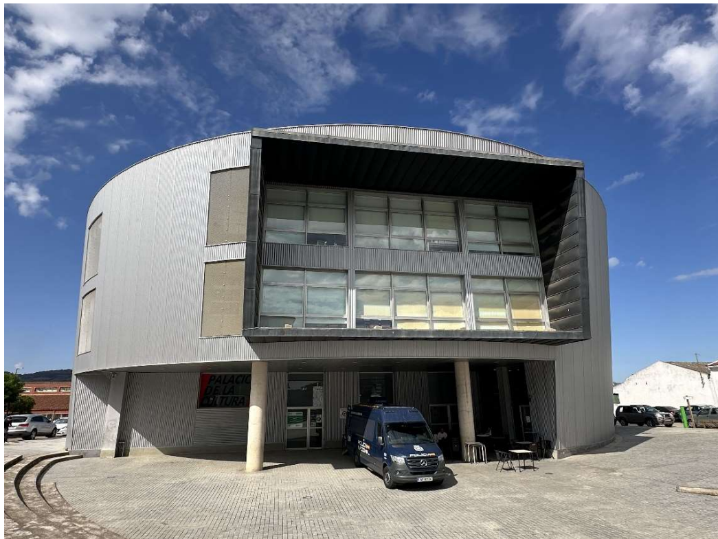
Front view of the Palace of Culture.