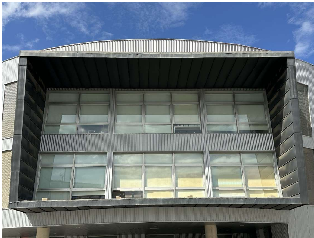
Detail of the upper part of the building. Below, auditorium.