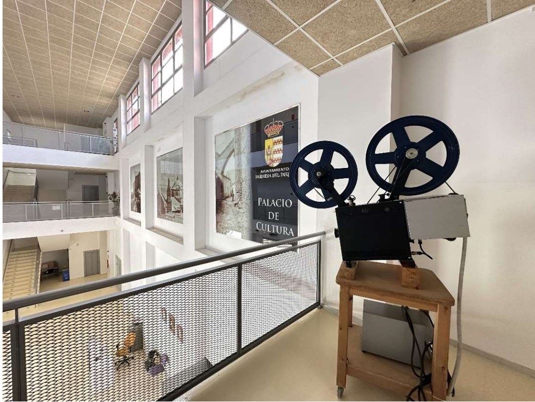
Second floor of the Palace of Culture of Herrera del Duque.