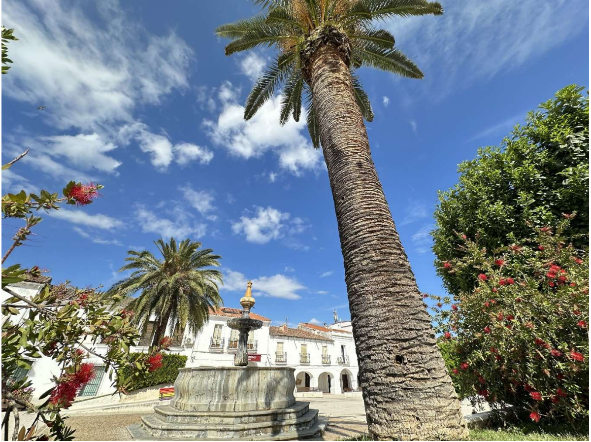
Image of the fountain and the square.