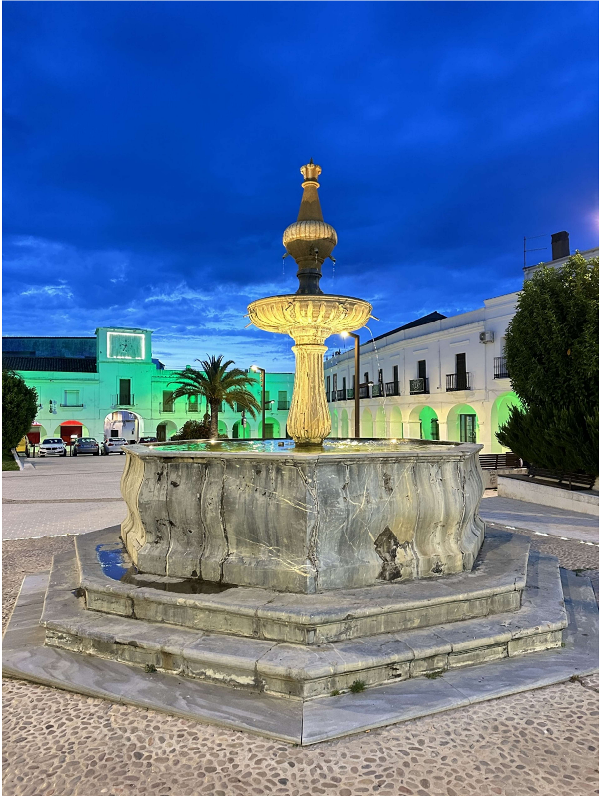
Night view of the octagonal fountain with the illuminated square.