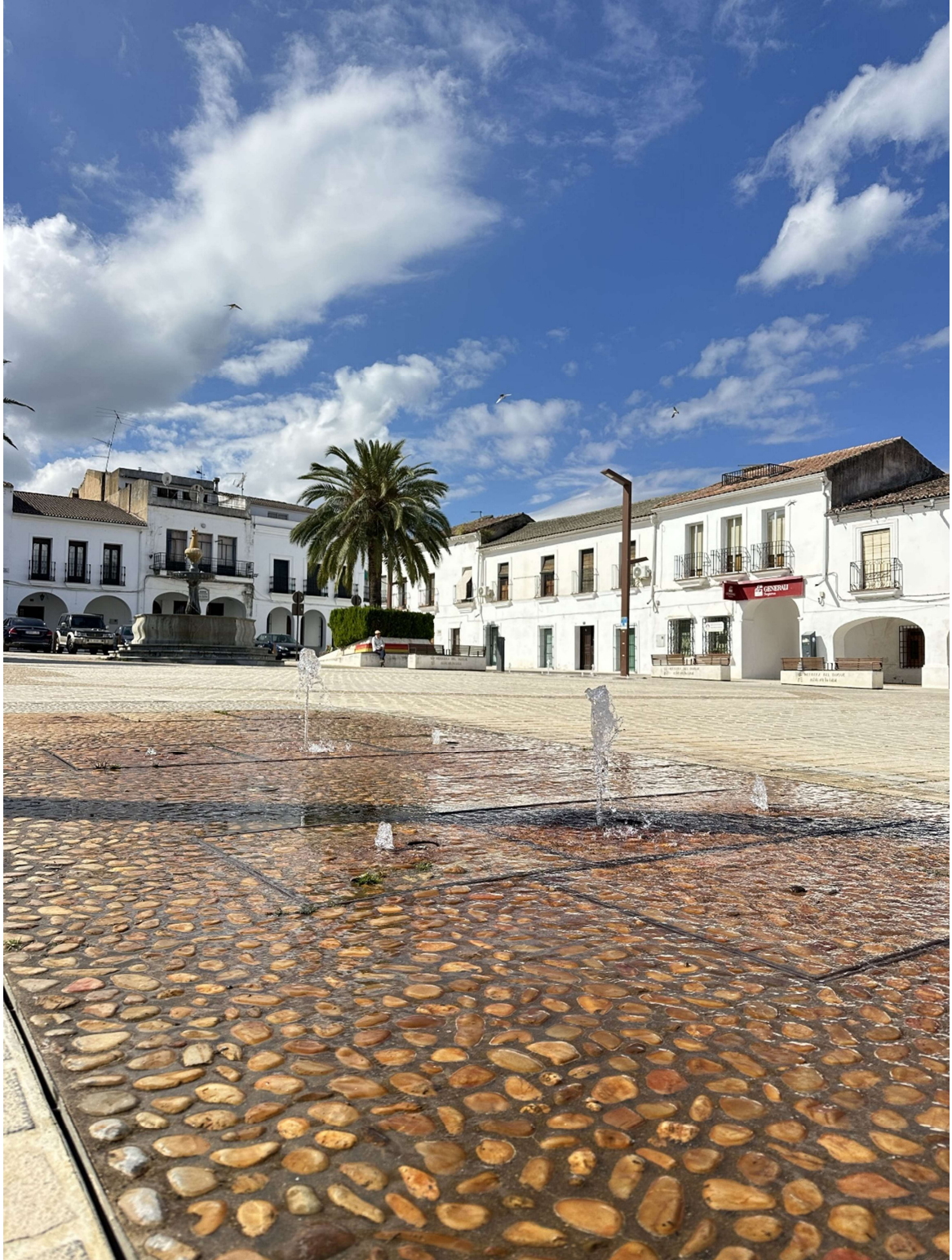
Water jets in the lower part of the square.