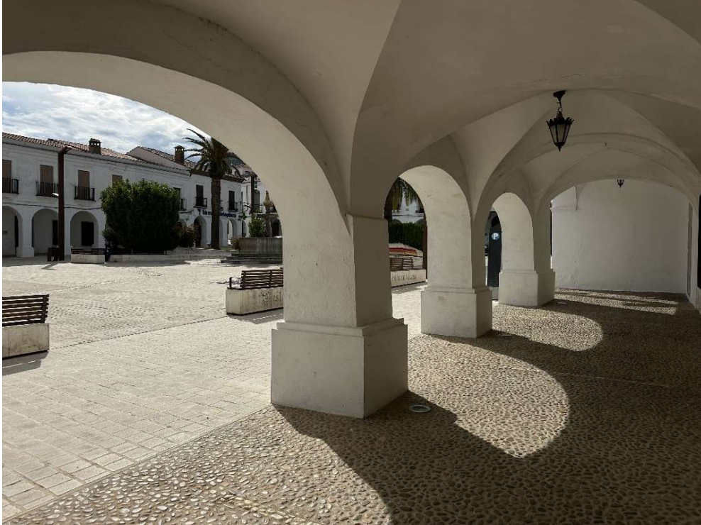
Arches in the arcaded square of Herrera del Duque.