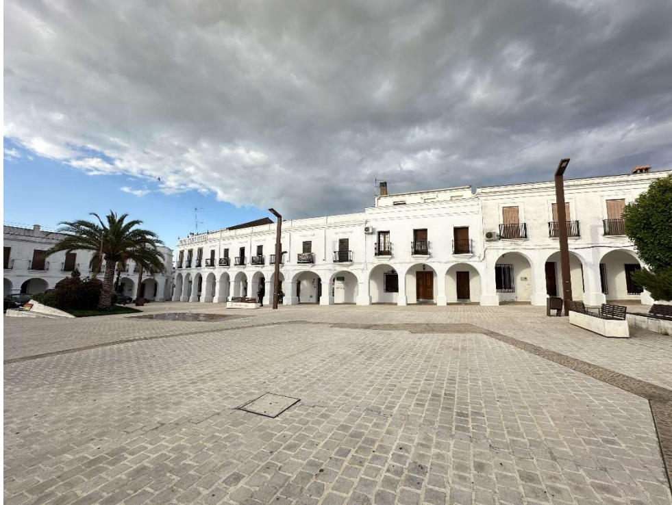
Above, image of Plaza de España. Below, the octagonal fountain.