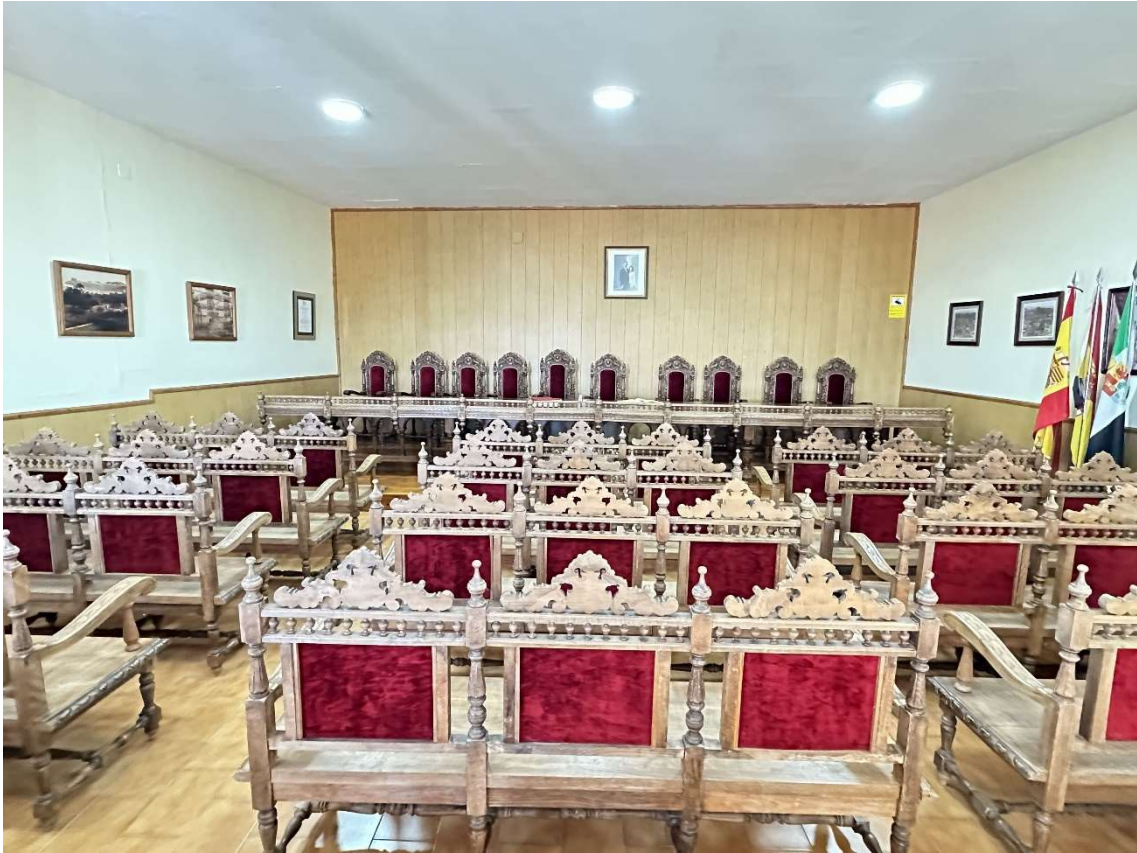
Image of the wooden seats that are still preserved in the town hall plenary chamber.