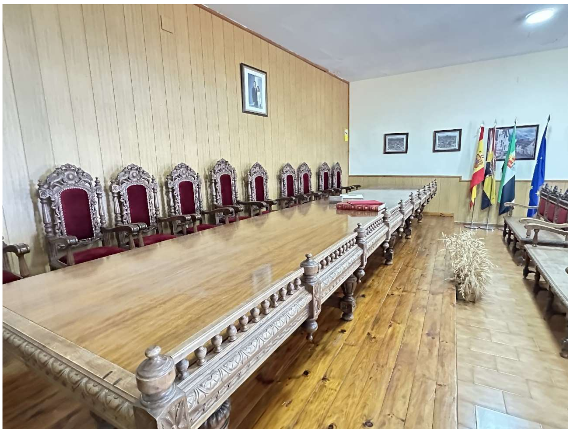
Above, table and seats of the plenary chamber. Below, heraldic coats of arms of Zúñiga and Sotomayor on the façade.