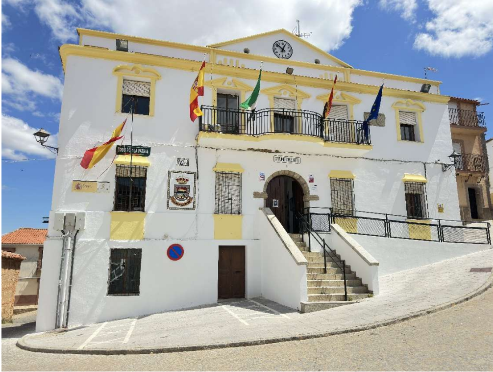
Town hall building from different perspectives.