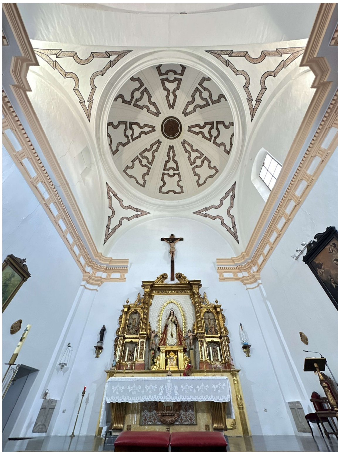
Presbytery and dome of the convent.