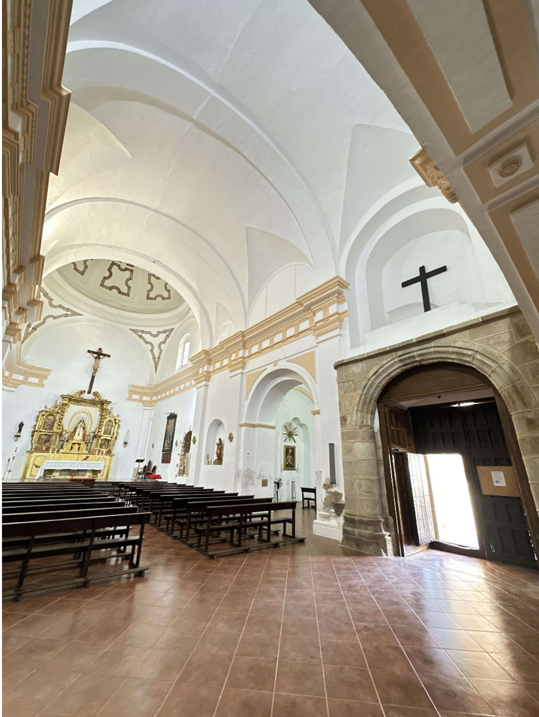
Interior of the Convent of San Francisco.