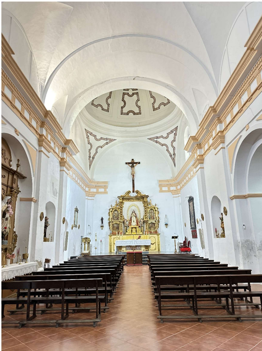
The convent was linked to the Franciscan community established in the town.