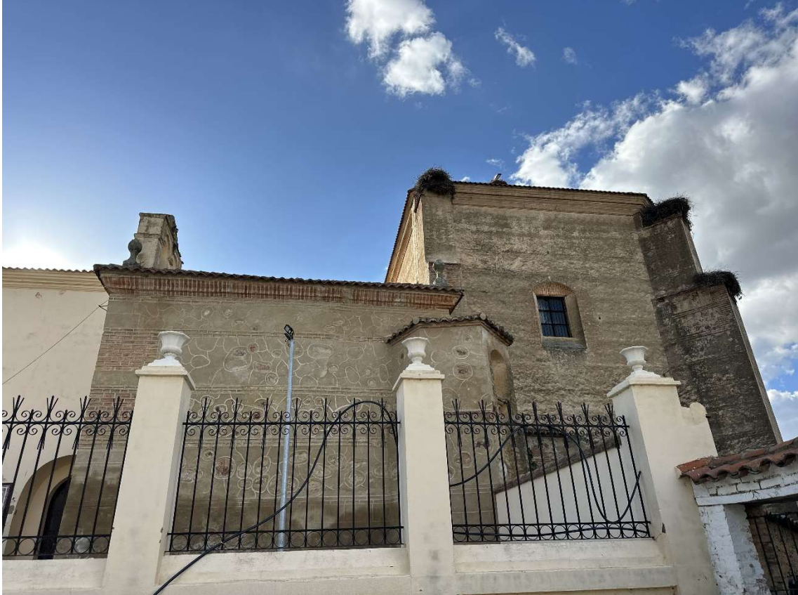
Exterior view of the convent.