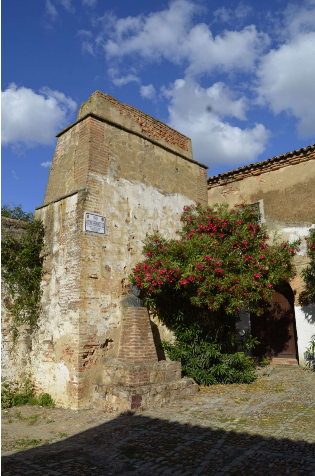
Exterior area of what is now the youth hostel.