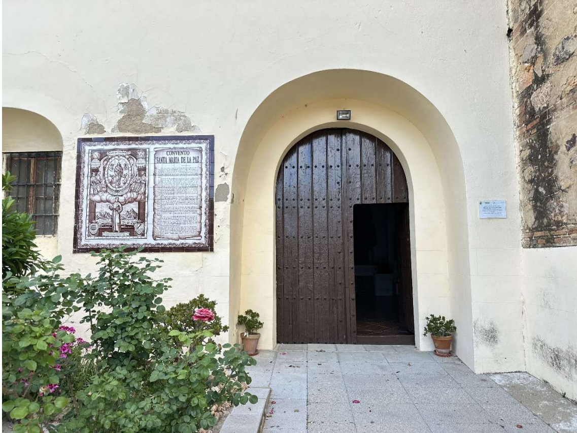
Access area to the convent..