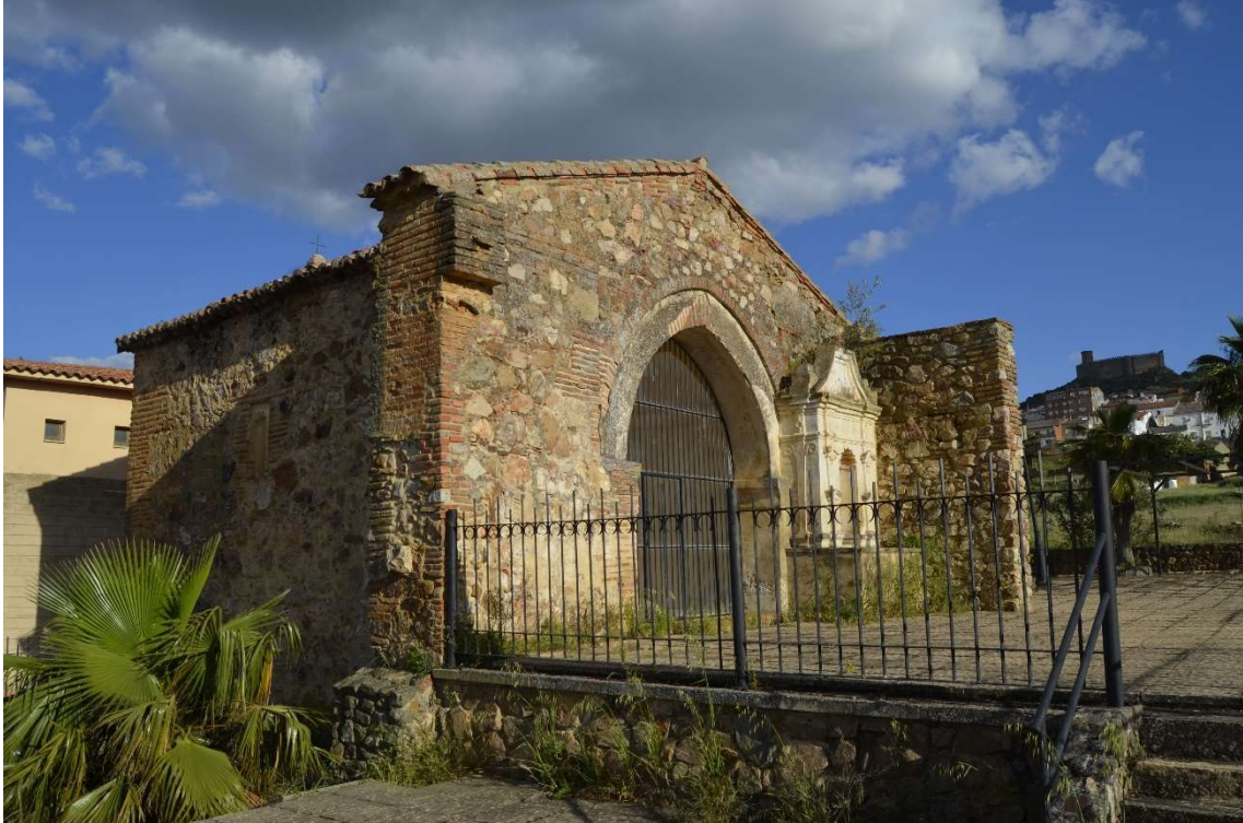
Side and front view of the Hermitage of San Antón.