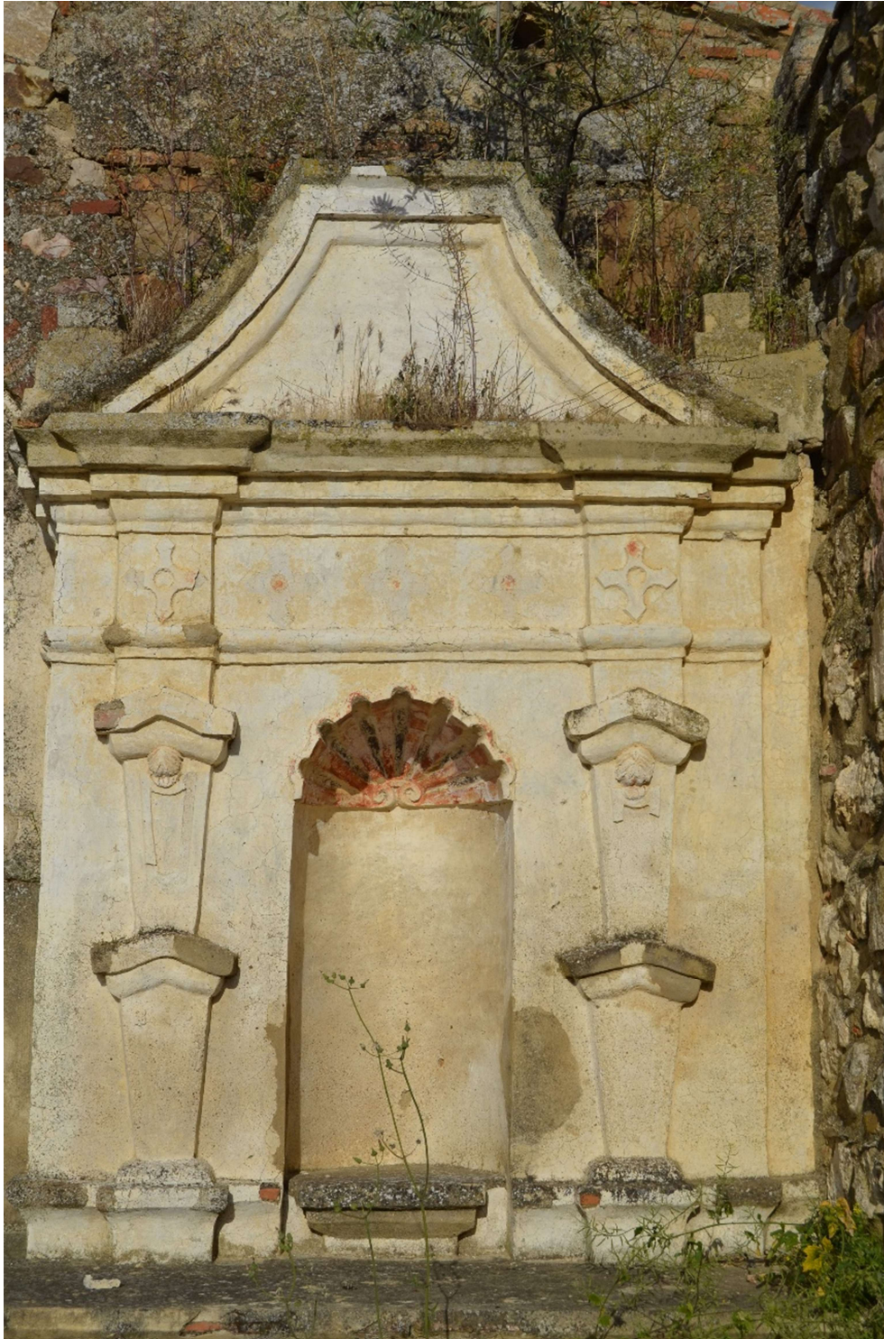
interior of the hermitage.