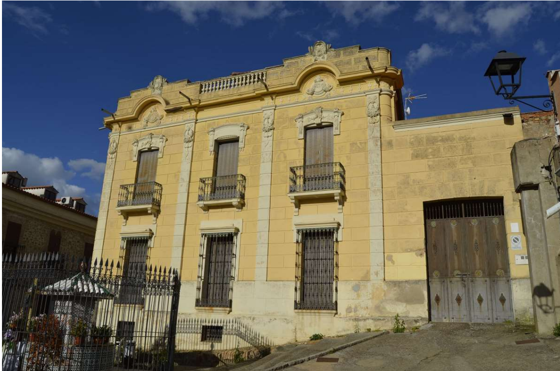
Image of one side of the building and the balcony on the main façade.