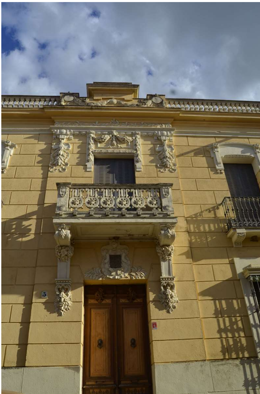
Image of the façade with reliefs and other decorative elements.