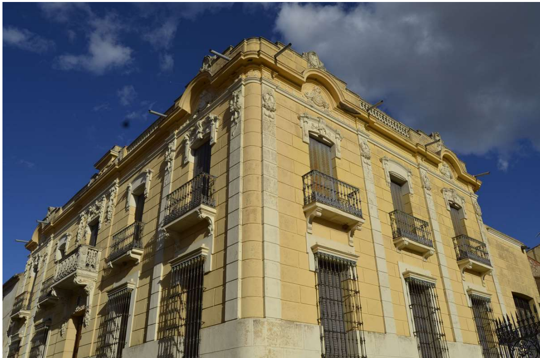
House of the Arévalo viewed from Calle San Francisco.