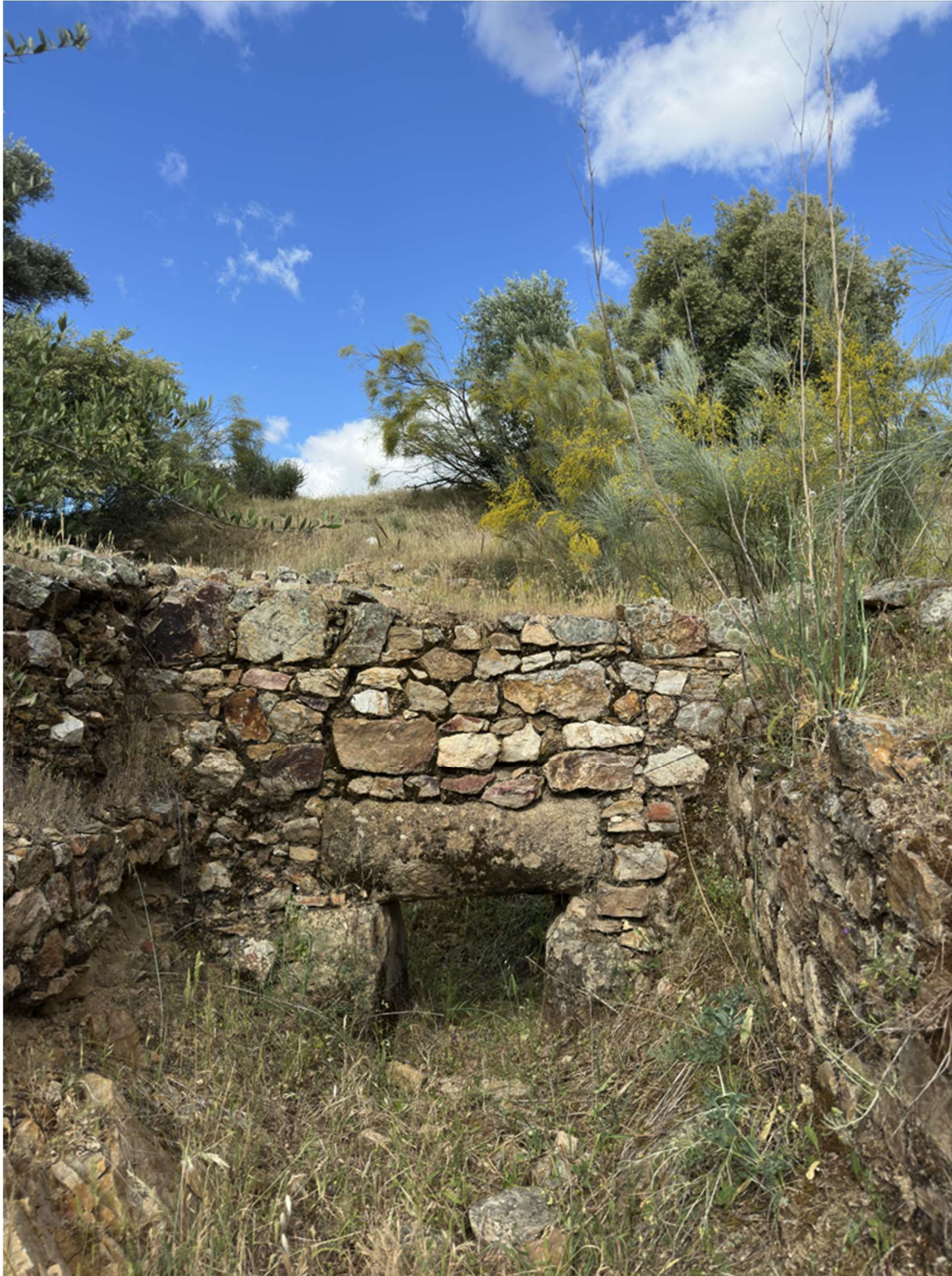
Part of the Roman building.