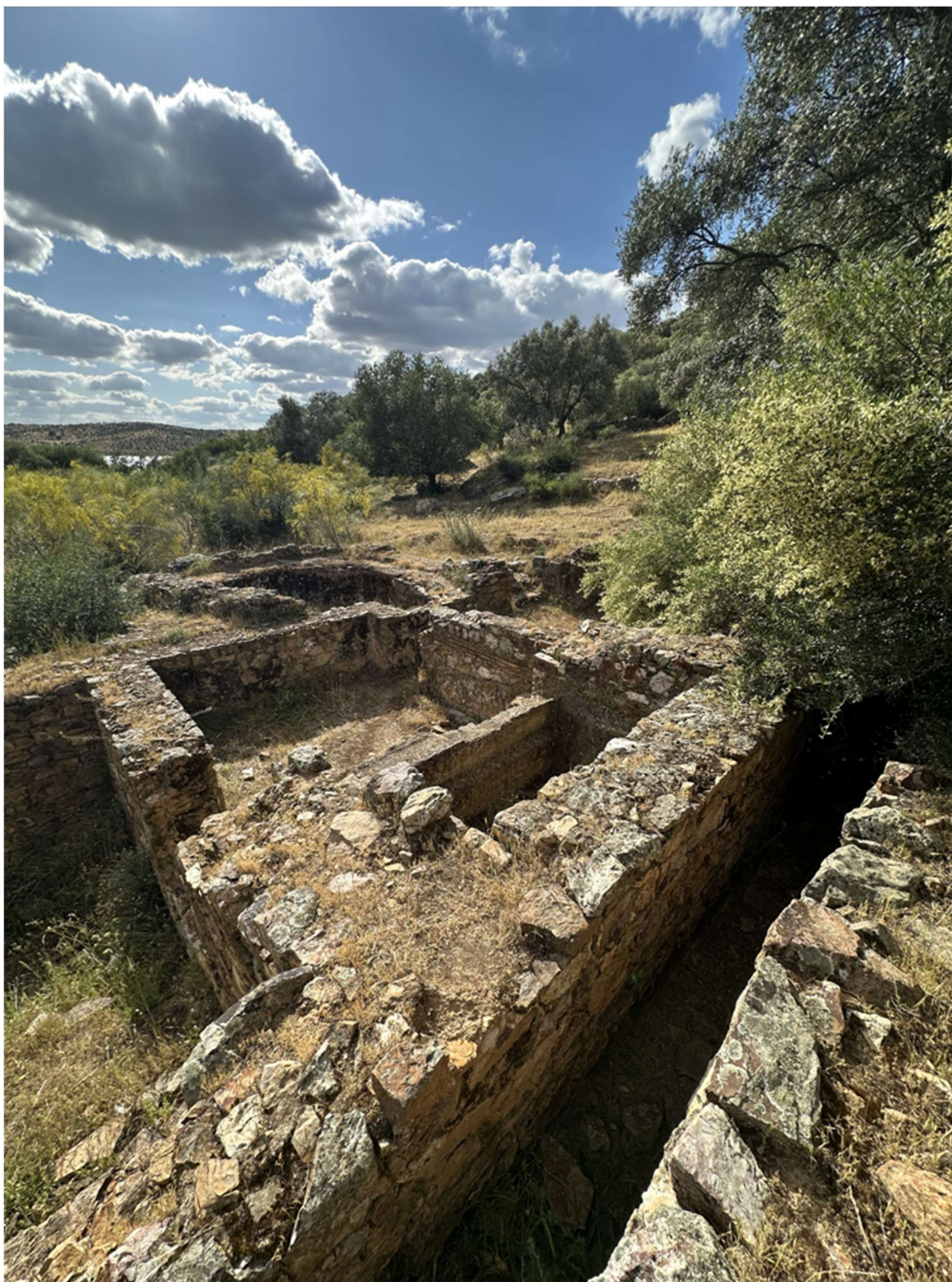
Remains of buildings found at Lacimurga.