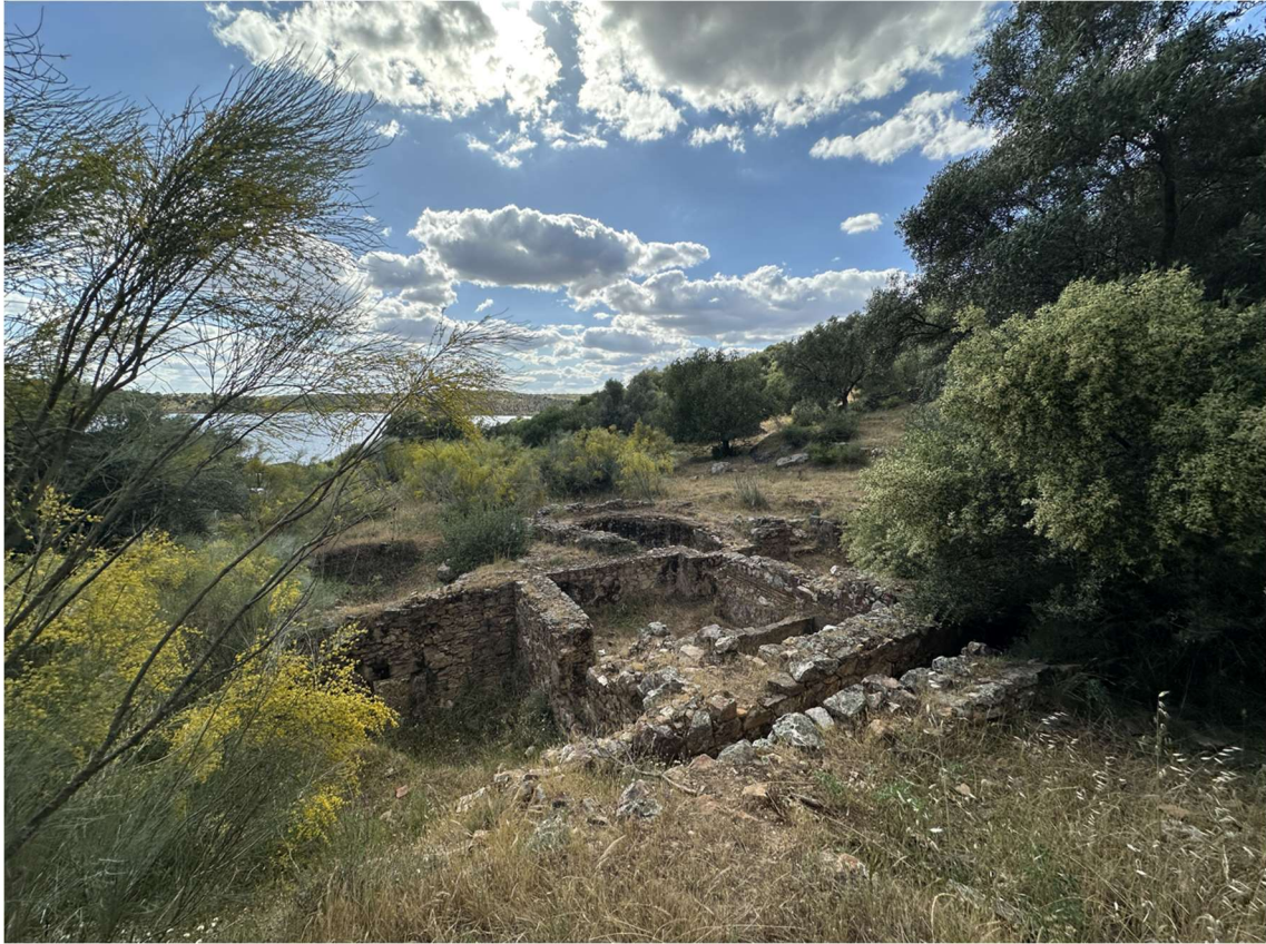
The dominant position of the hill favored its use as a defensive fortification.