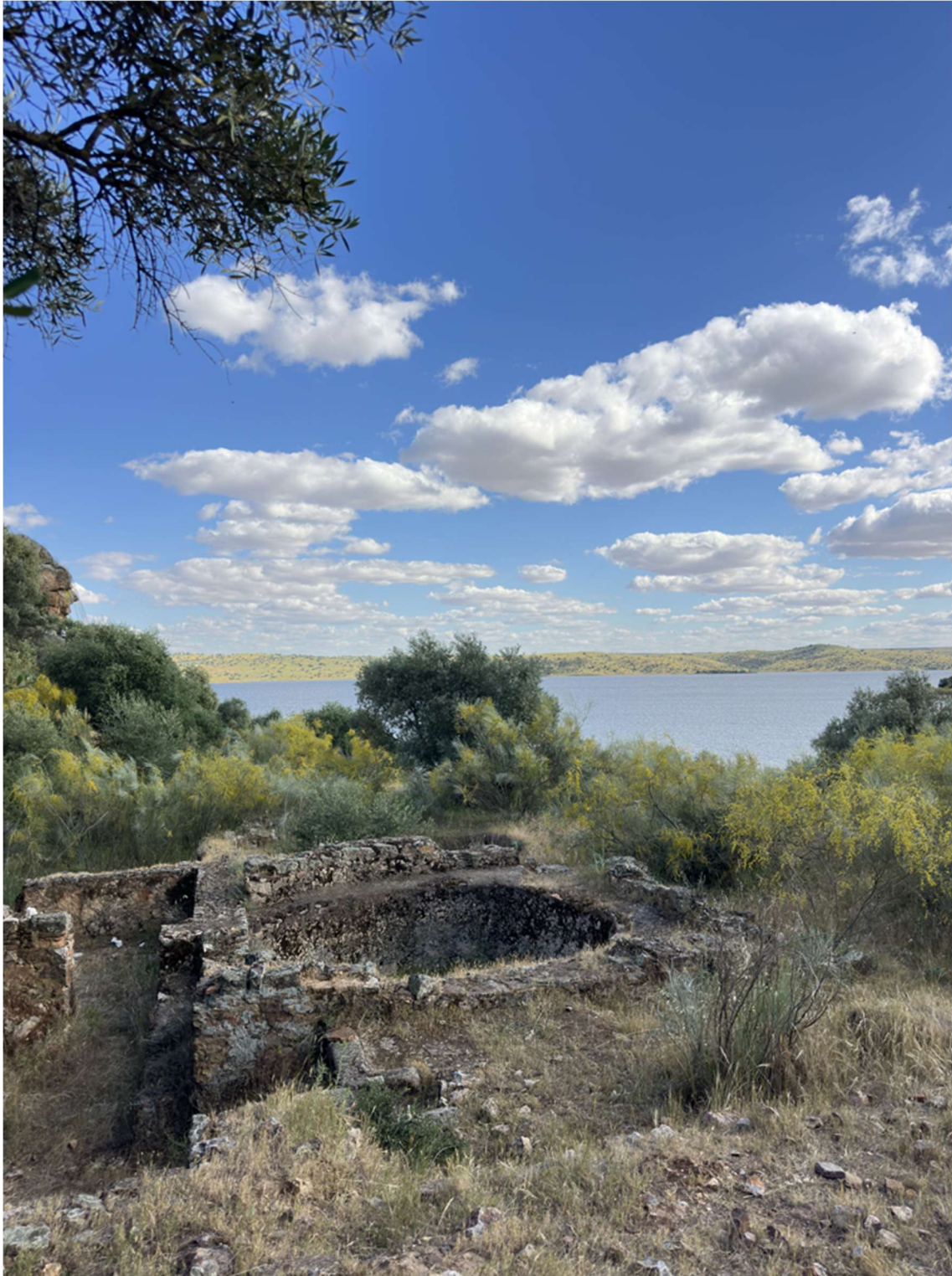
Roman site of Lacimurga, one of the most important in the La Siberia region of Extremadura.