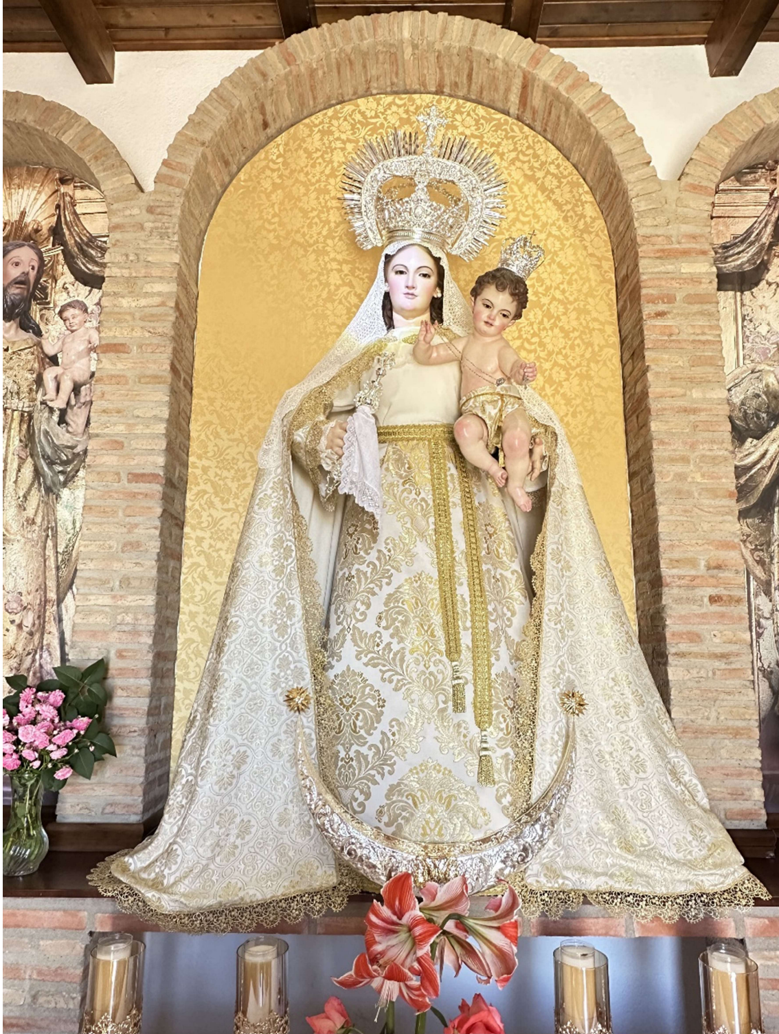
The hermitage houses the image of Nuestra Señora de la Buenadicha.