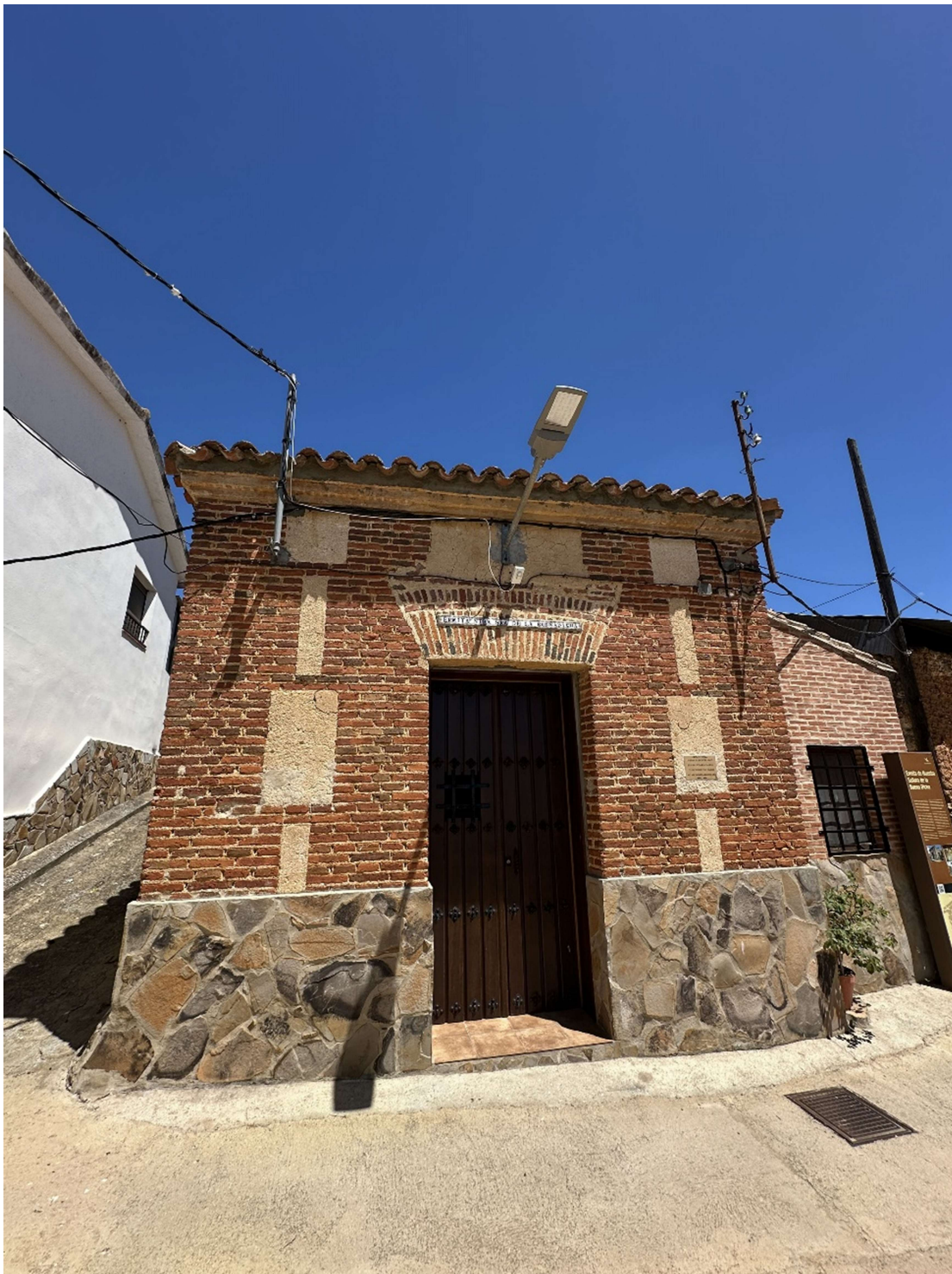
The hermitage is closely linked to the religious celebrations of Risco.