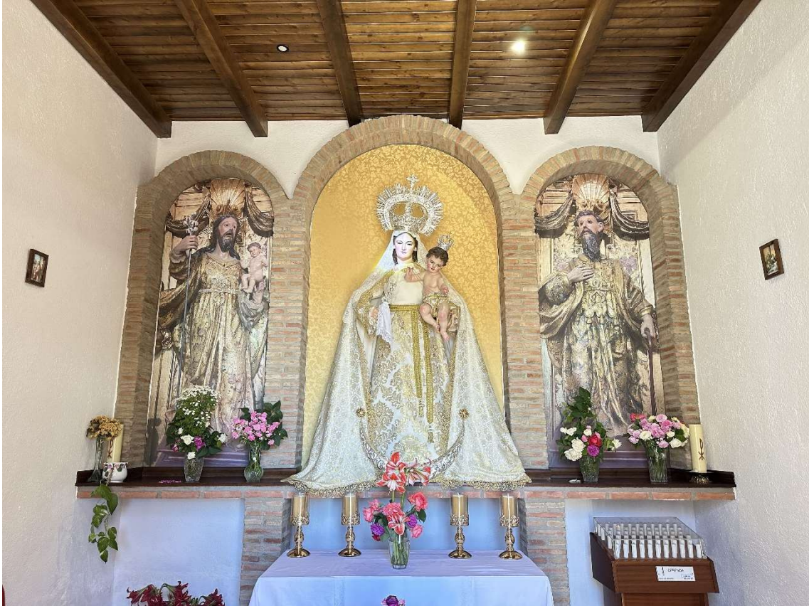
Interior of the hermitage.