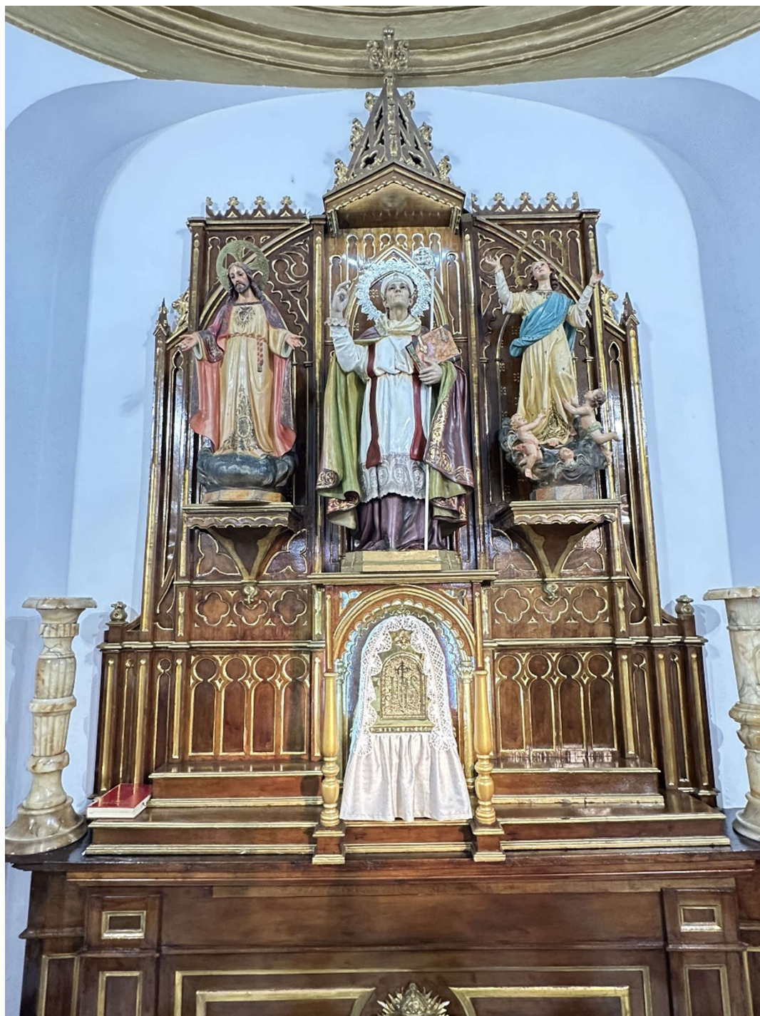
Altarpiece of the Church with the image of San Blas.