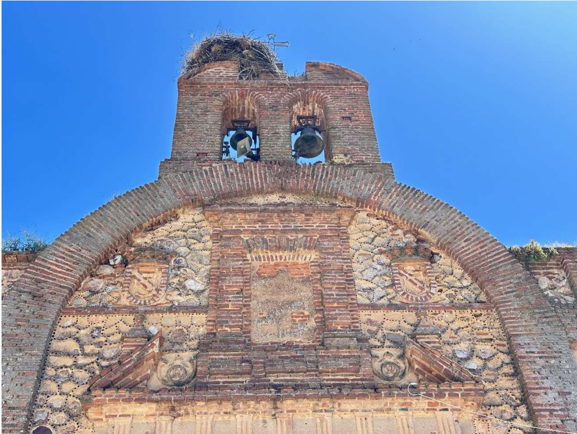
The façade features the coats of arms of the Zúñiga family and the reliefs of confronting snakes.