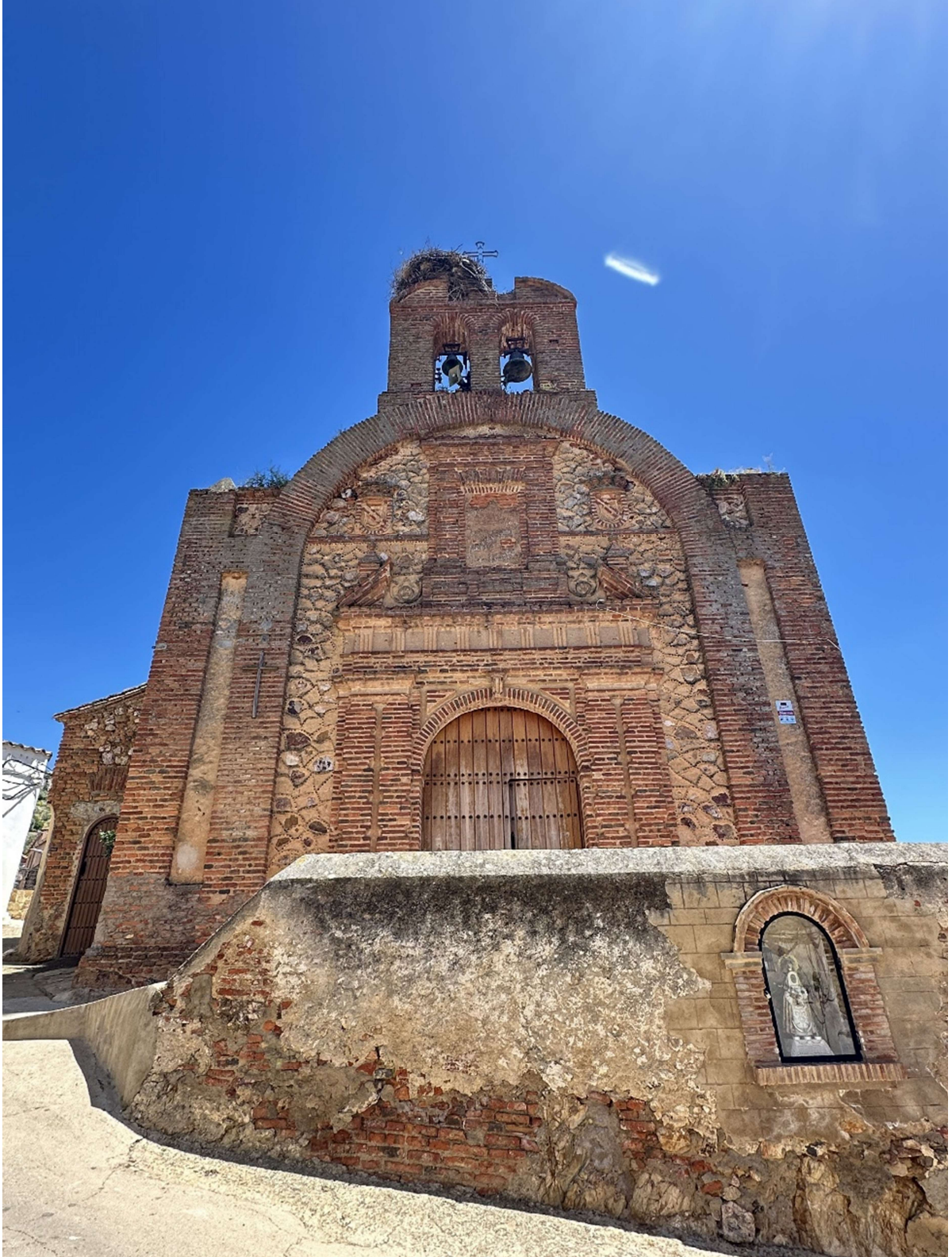
The temple is mainly constructed in solid brick and mortar.