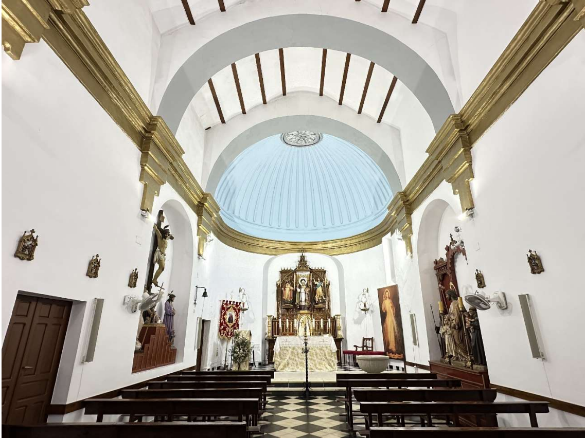
Interior of the Church.