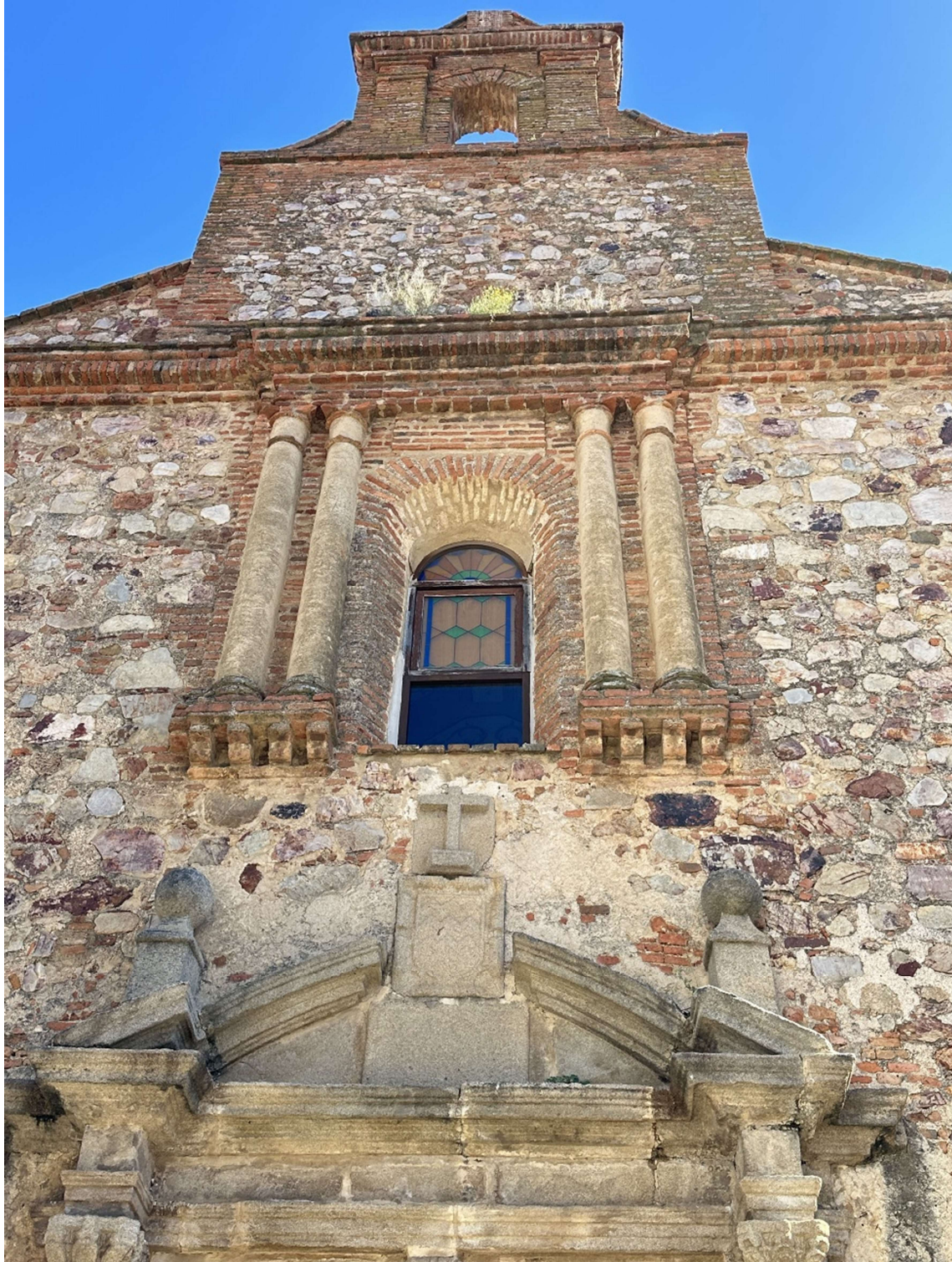
Front façade of the former chapel with granite columns.