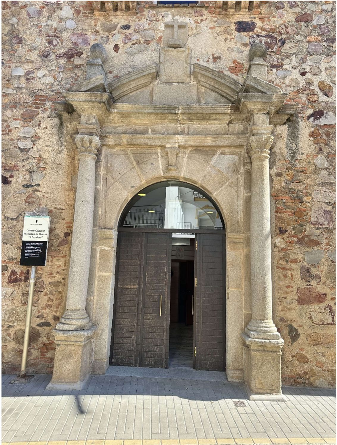
Entrance doorway to the building and heraldic coat of arms.