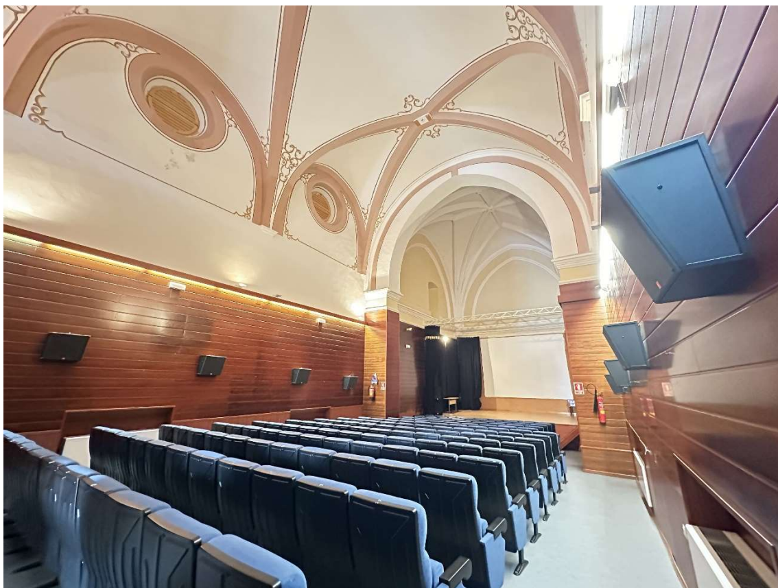
Image of the chapel after restoration.