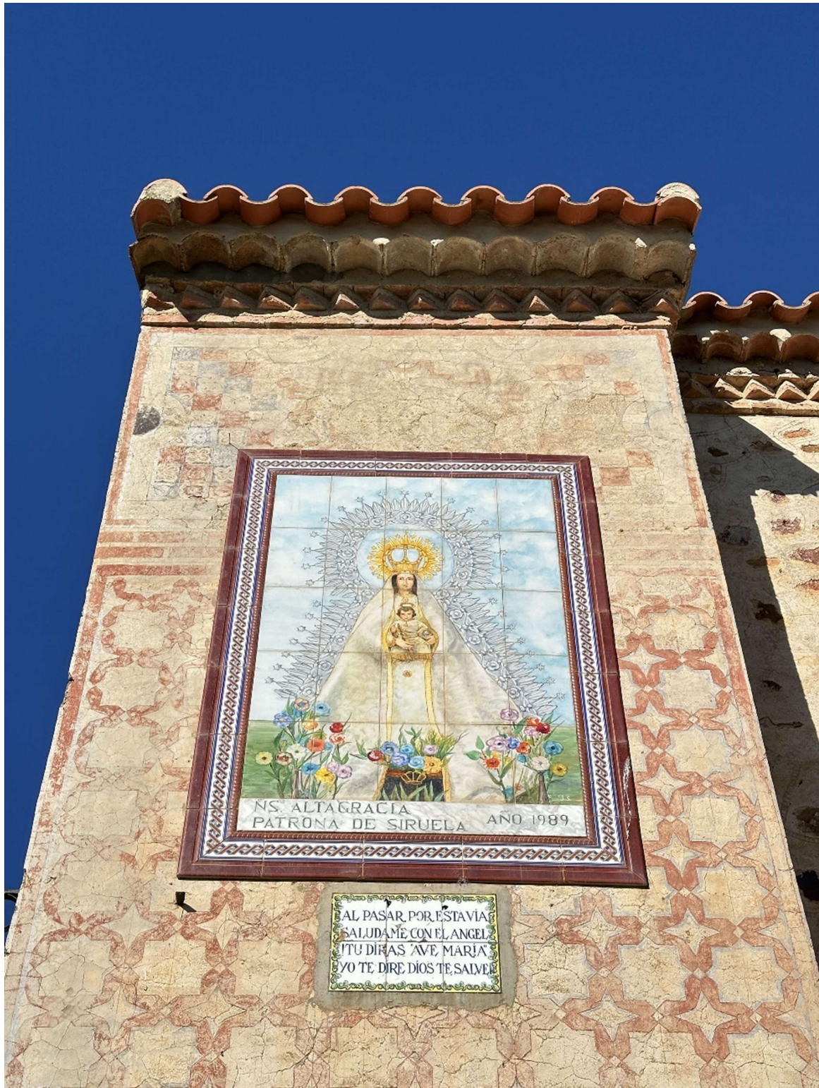
Tile detail on one of the hermitage walls featuring the image of Nuestra Señora de Altagracia.