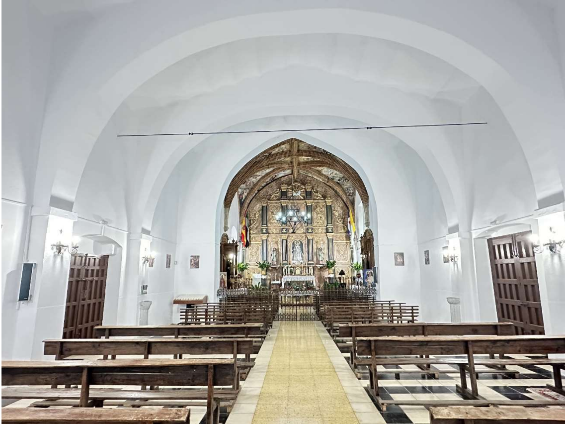
The Main Chapel dates from the early 16th century.