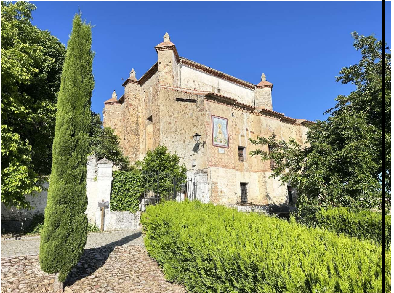
Exterior of the hermitage, located in an area of great beauty.