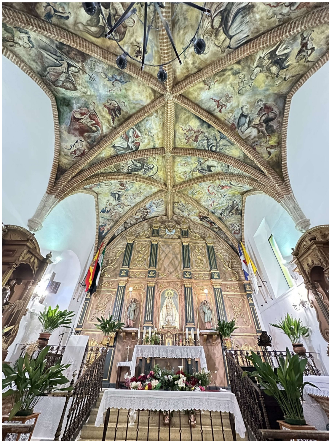
The building presents a heterogeneous structure resulting from different construction phases.