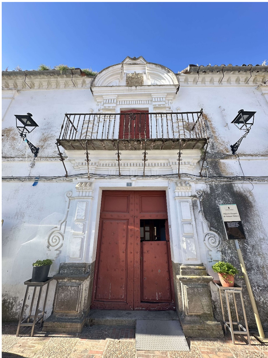
Façade of the palace in Plaza de España, Siruela.