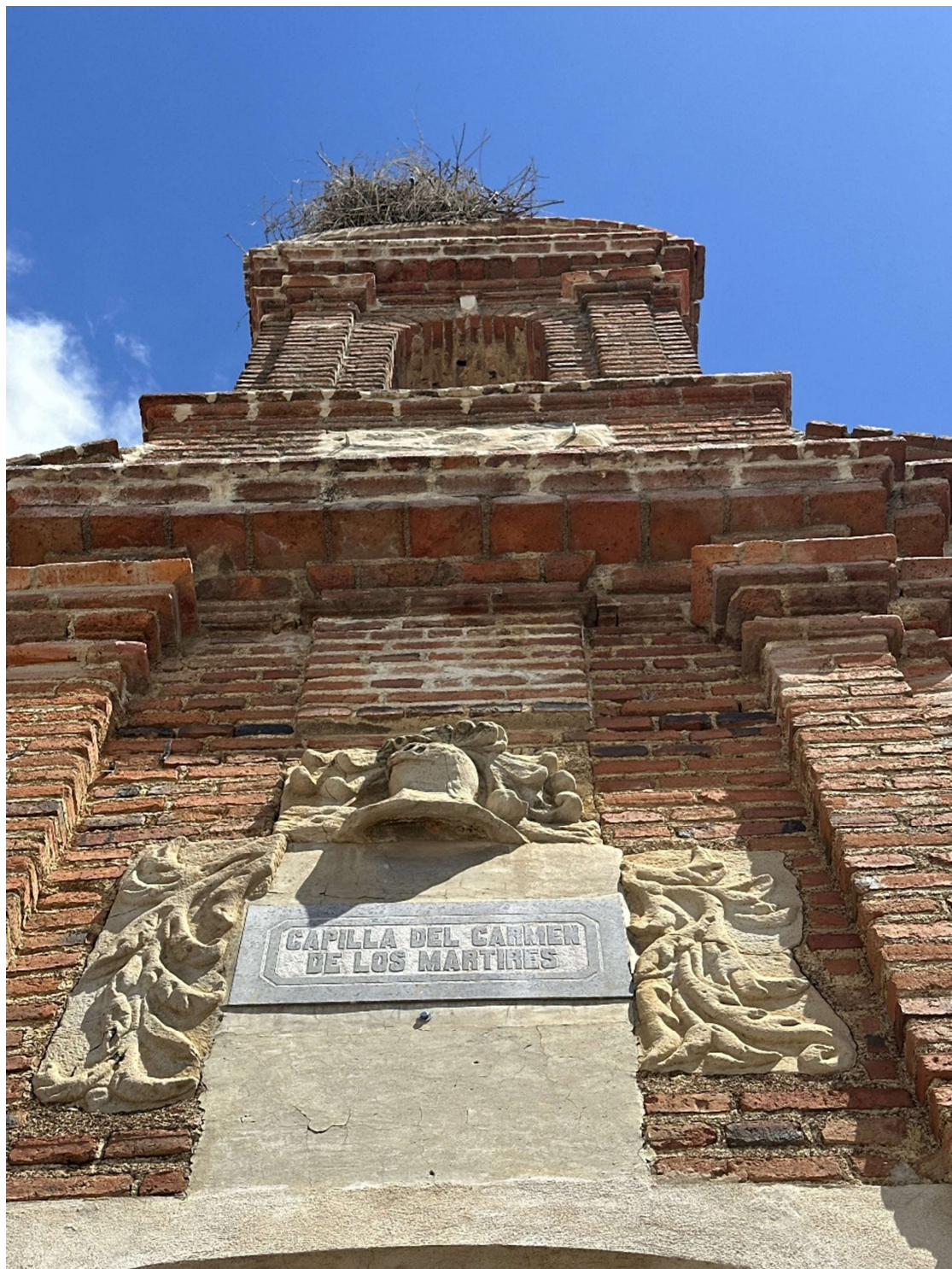
The chapel has a brick facade with sober lines.