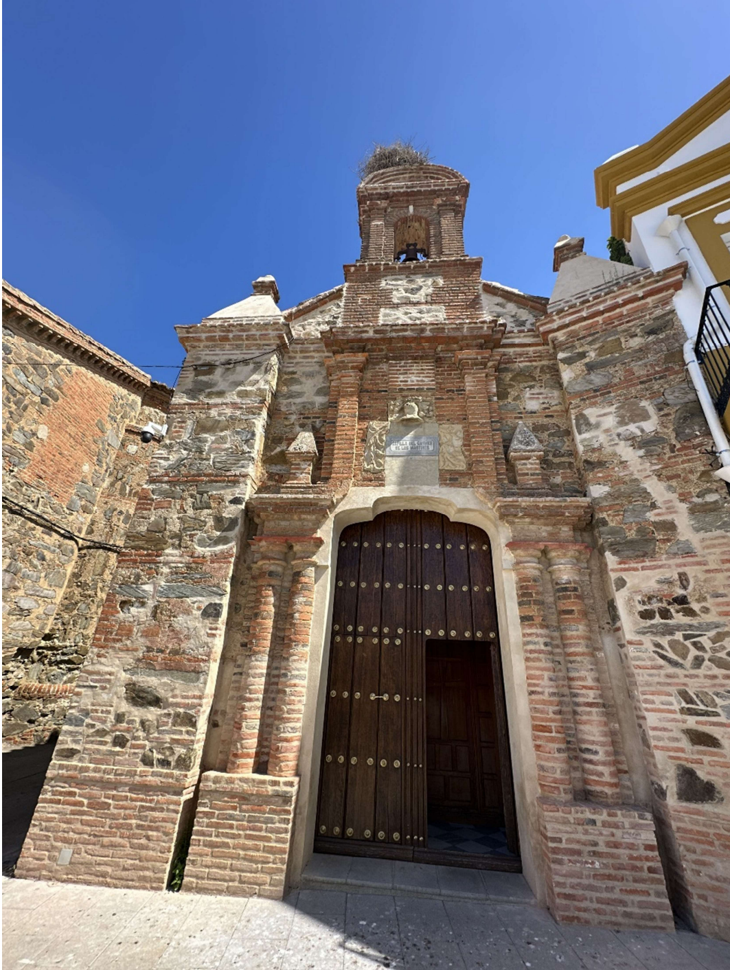
The building features a typology that places it between the Baroque and Rococo styles.