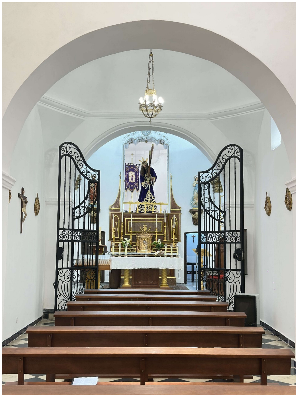
Image of the interior of the temple.