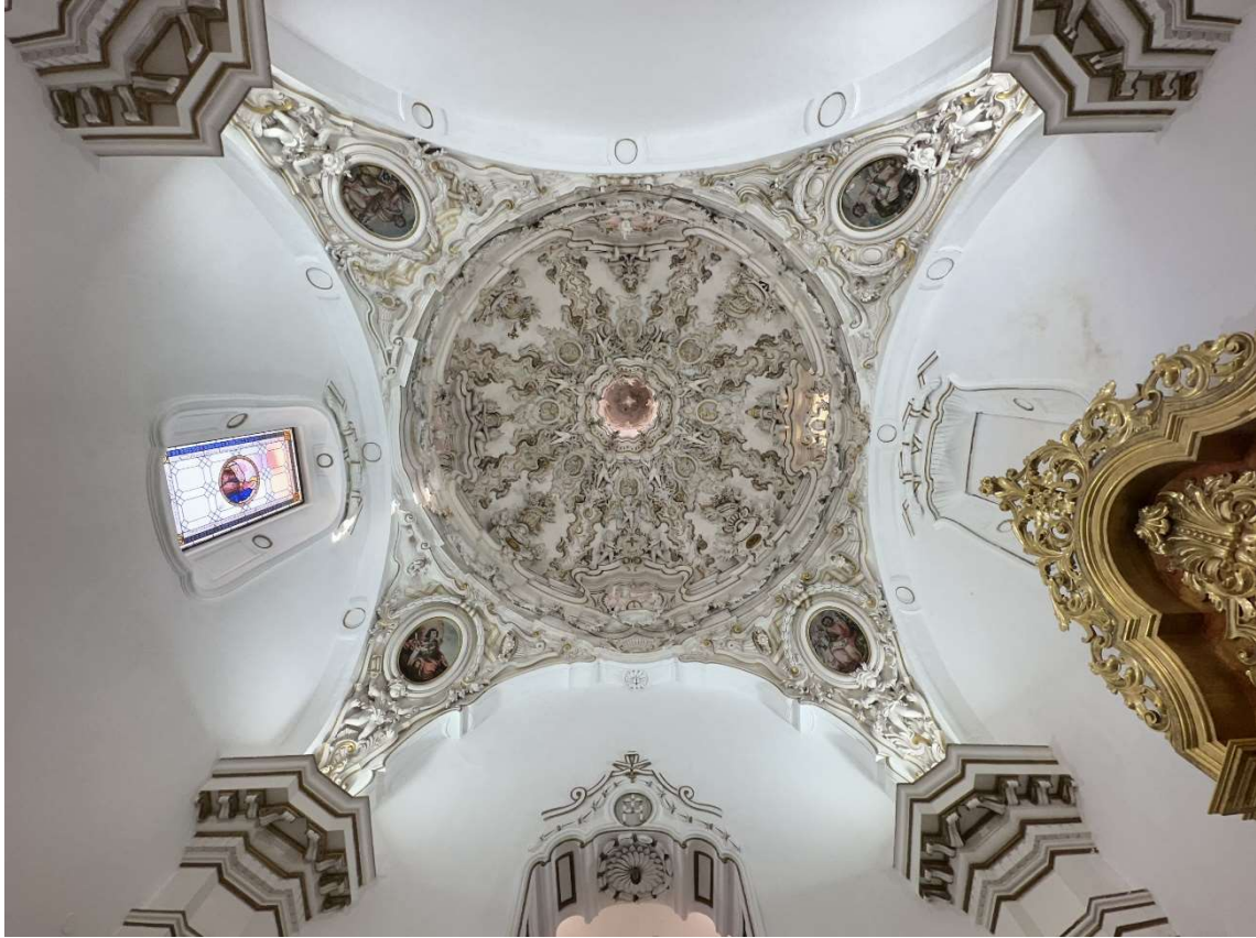
Dome decorated with plasterwork.