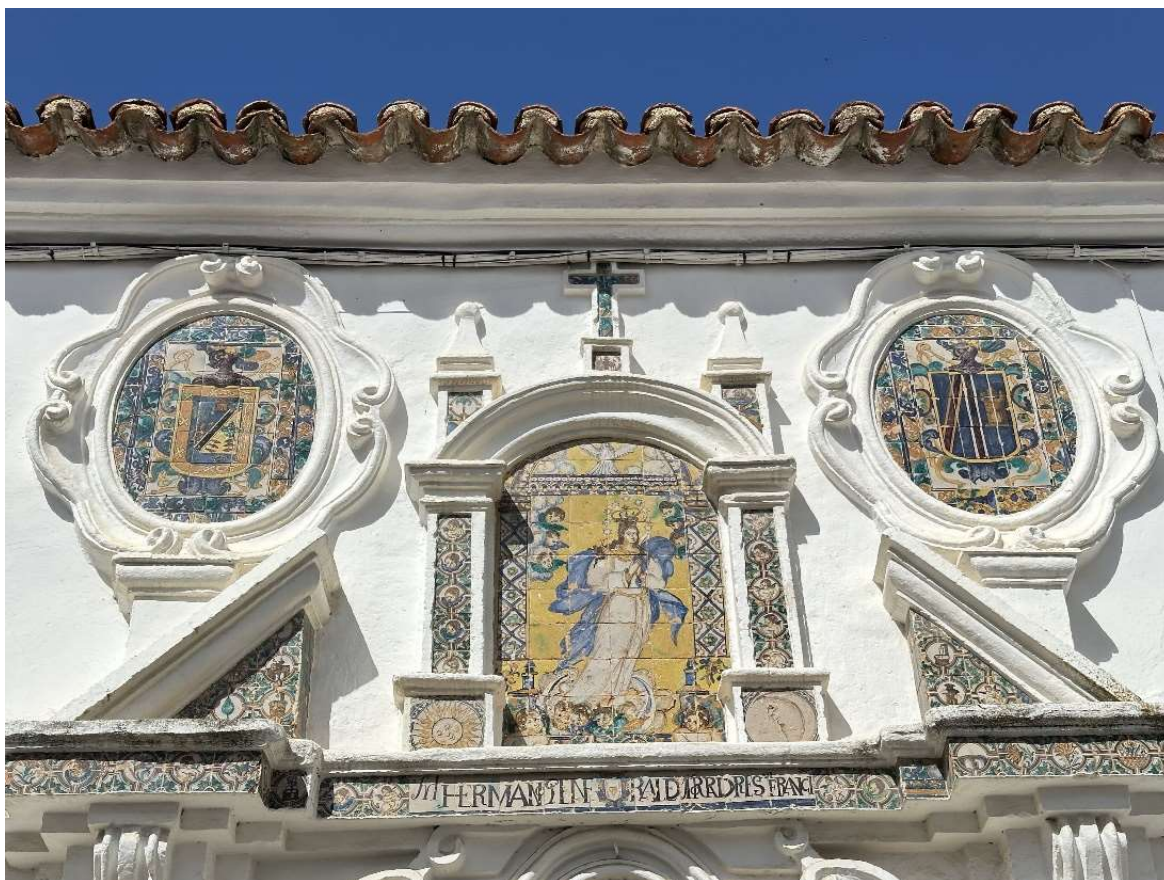
Detail of the tiles located in the upper part of the house.