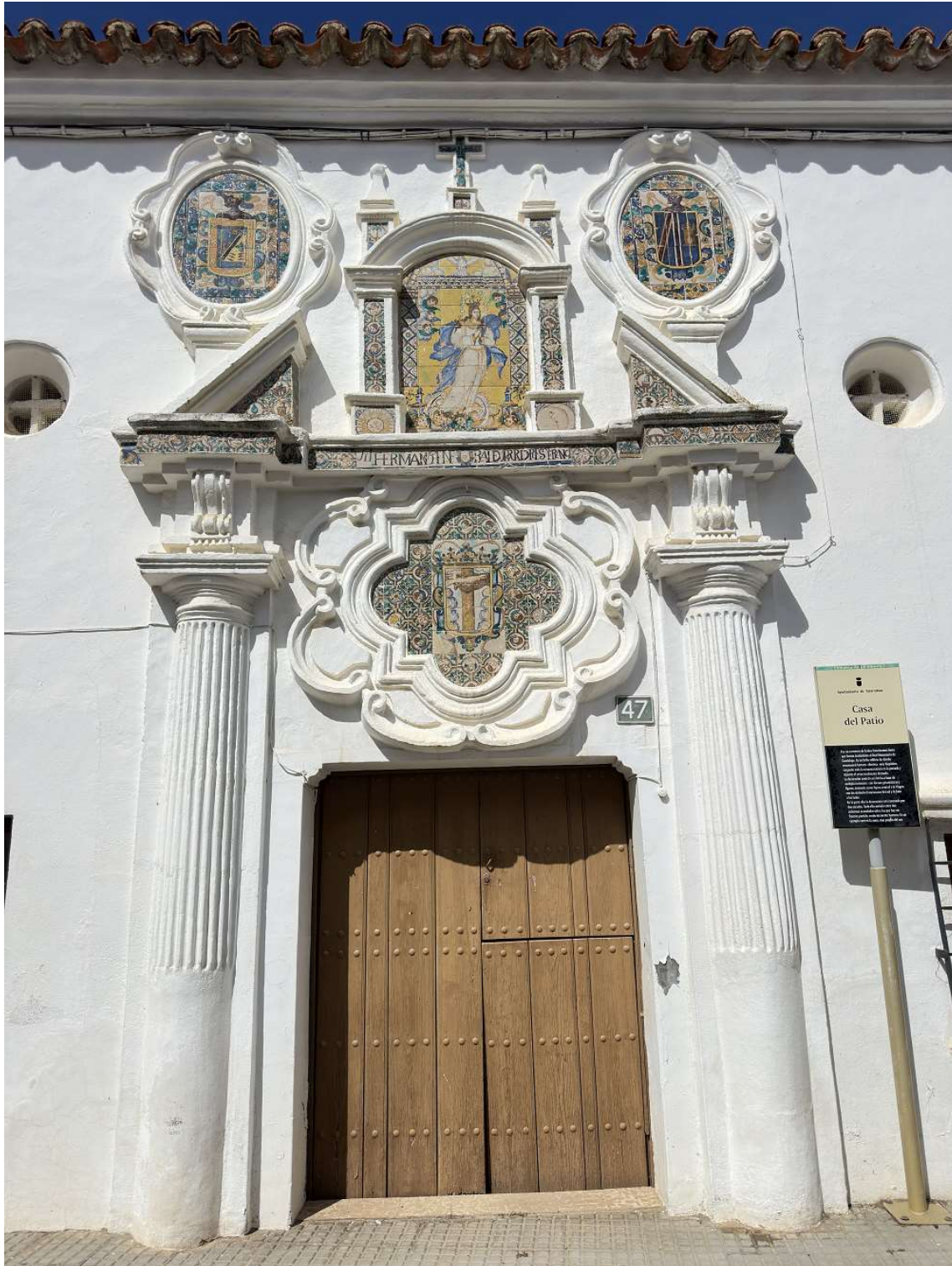
Tiles with geometric compositions and figurative motifs on the façade of the house.