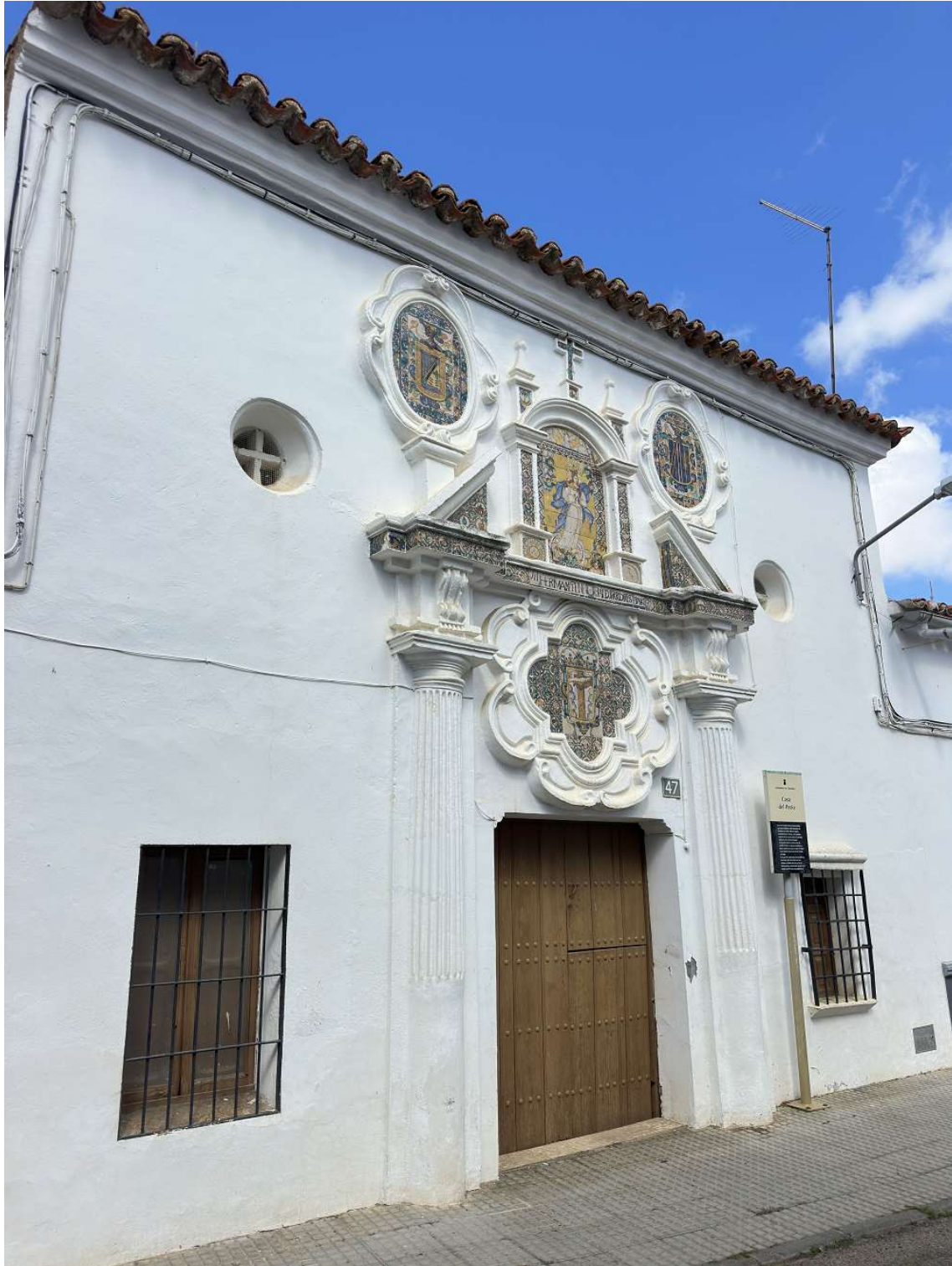
The house underwent ornamental renovations.