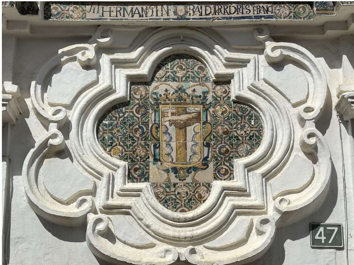
Inscription of the Brotherhood of Franciscan Fathers.