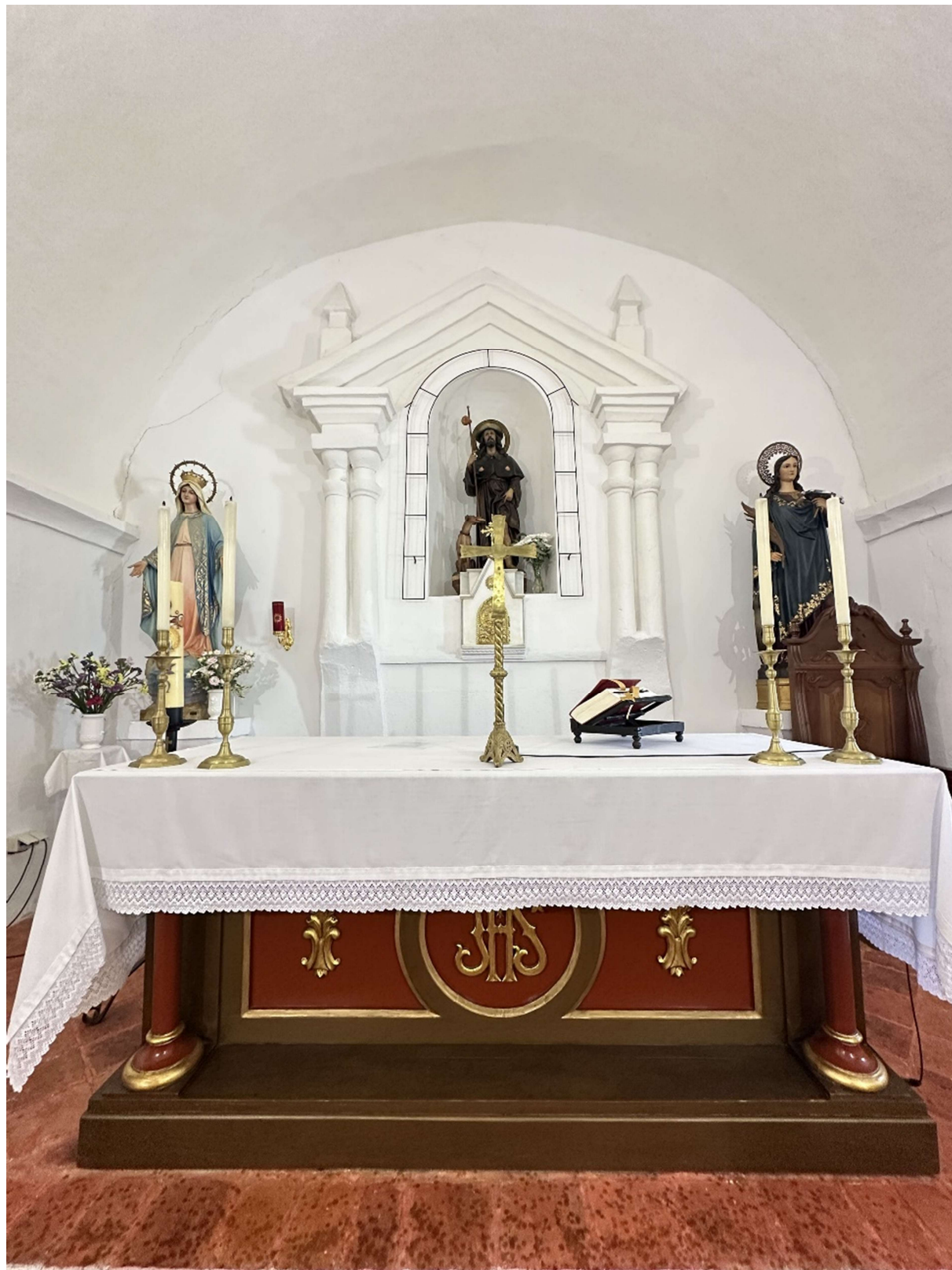
Interior of the temple with the image of San Roque in the background.