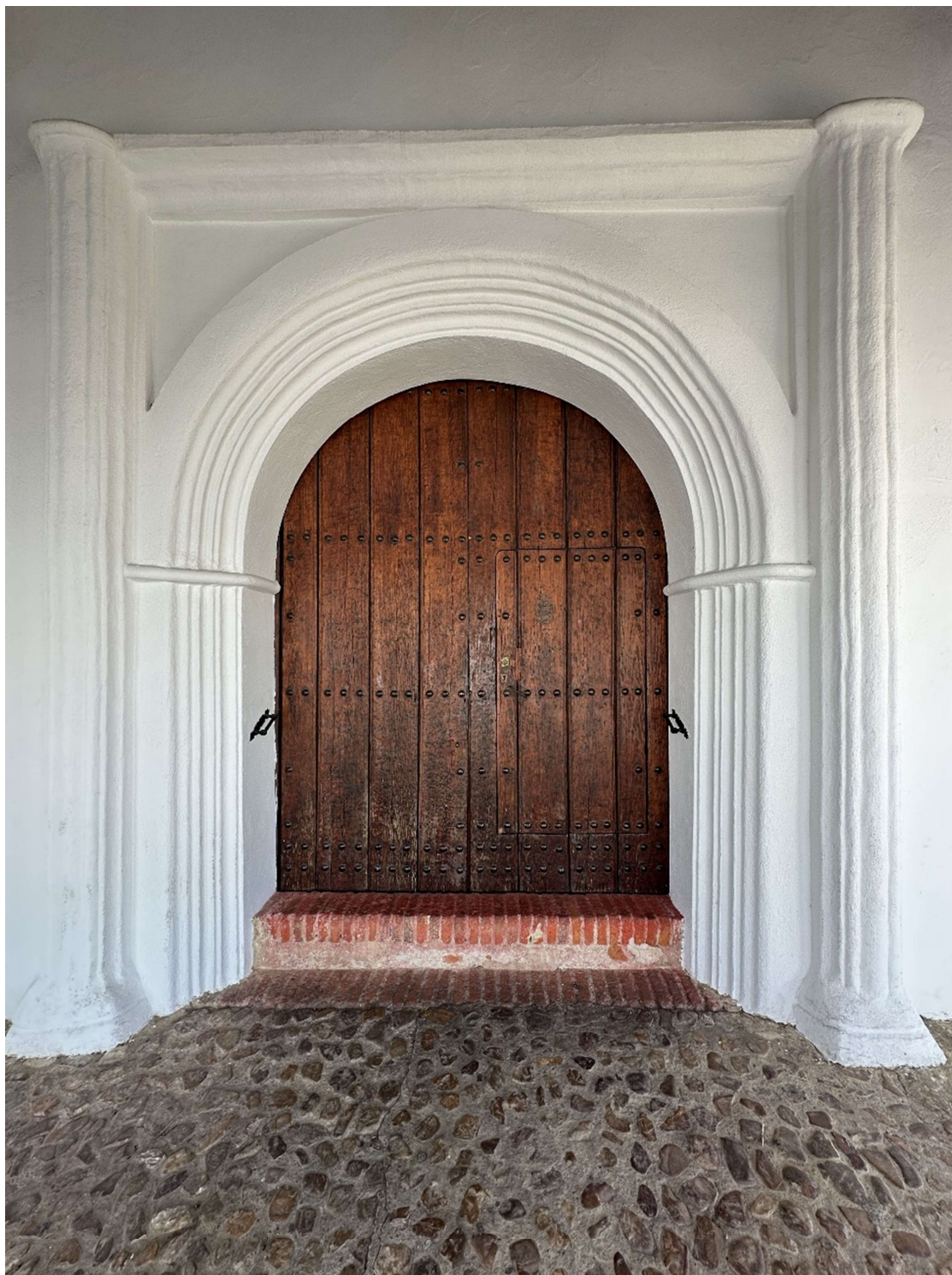
Entrance door.