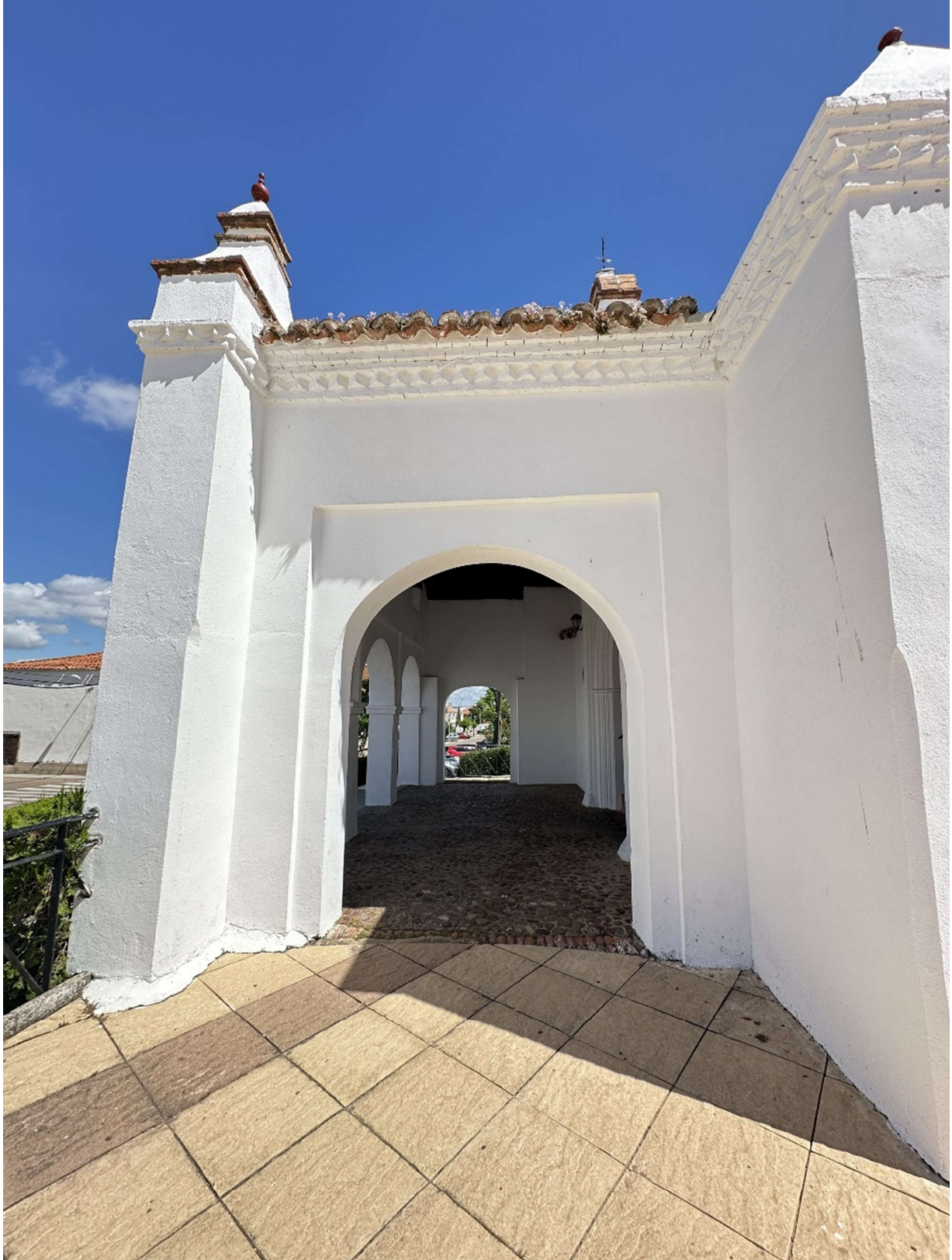
Porticoed Access are ato the hermitage.