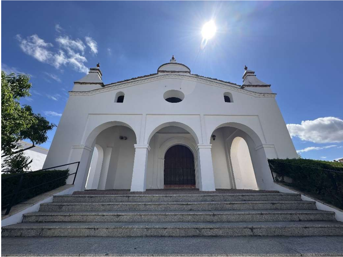
Front view of the hermitage.