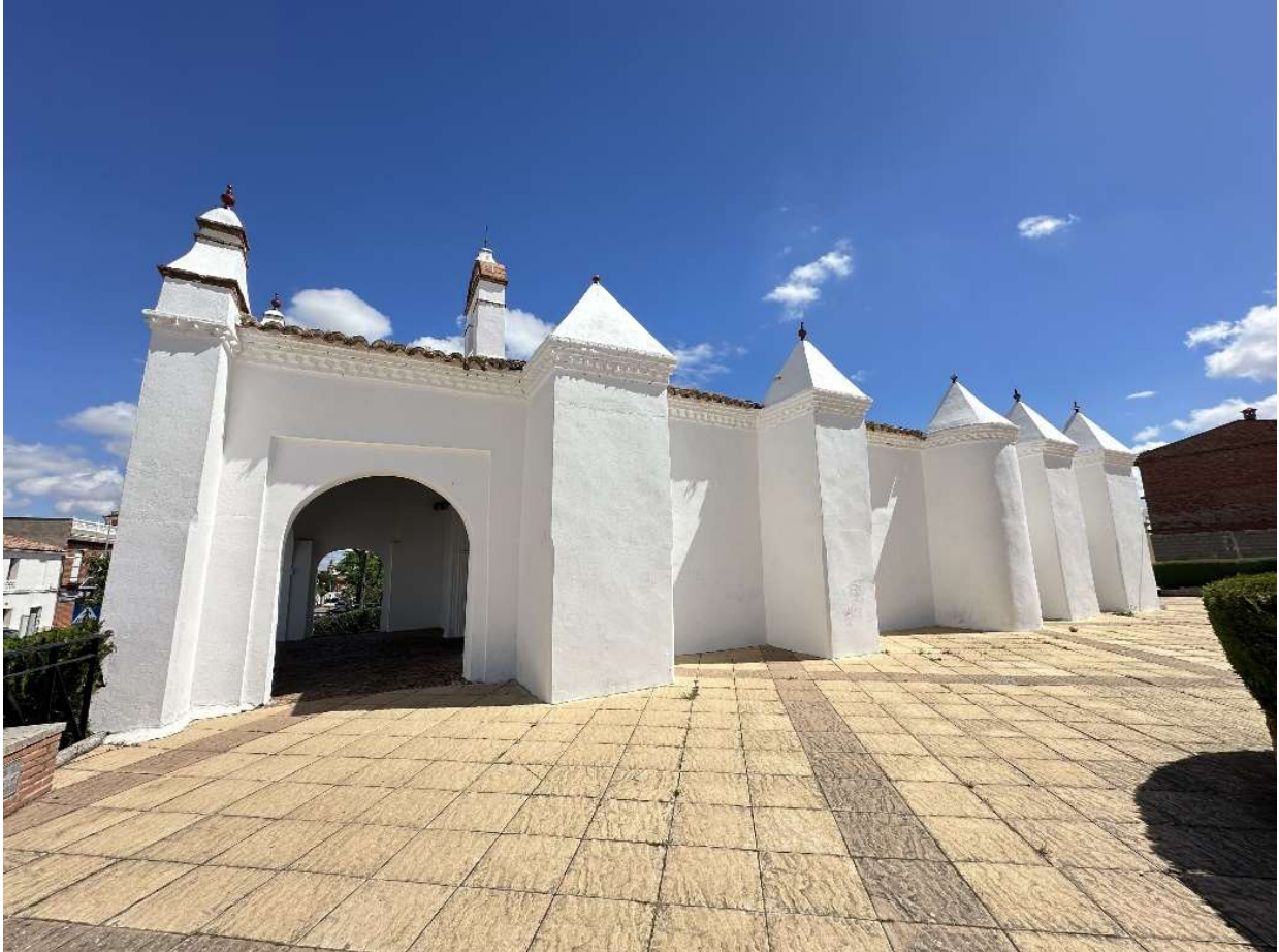
Detail of the sober architecture of the Hermitage of San Roque.