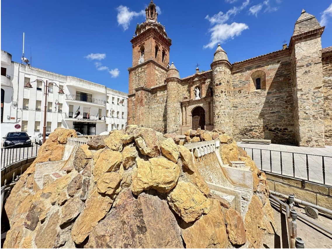
Fountain of the Four Reservoirs with the Church of Santa Catalina de Alejandría in the background.