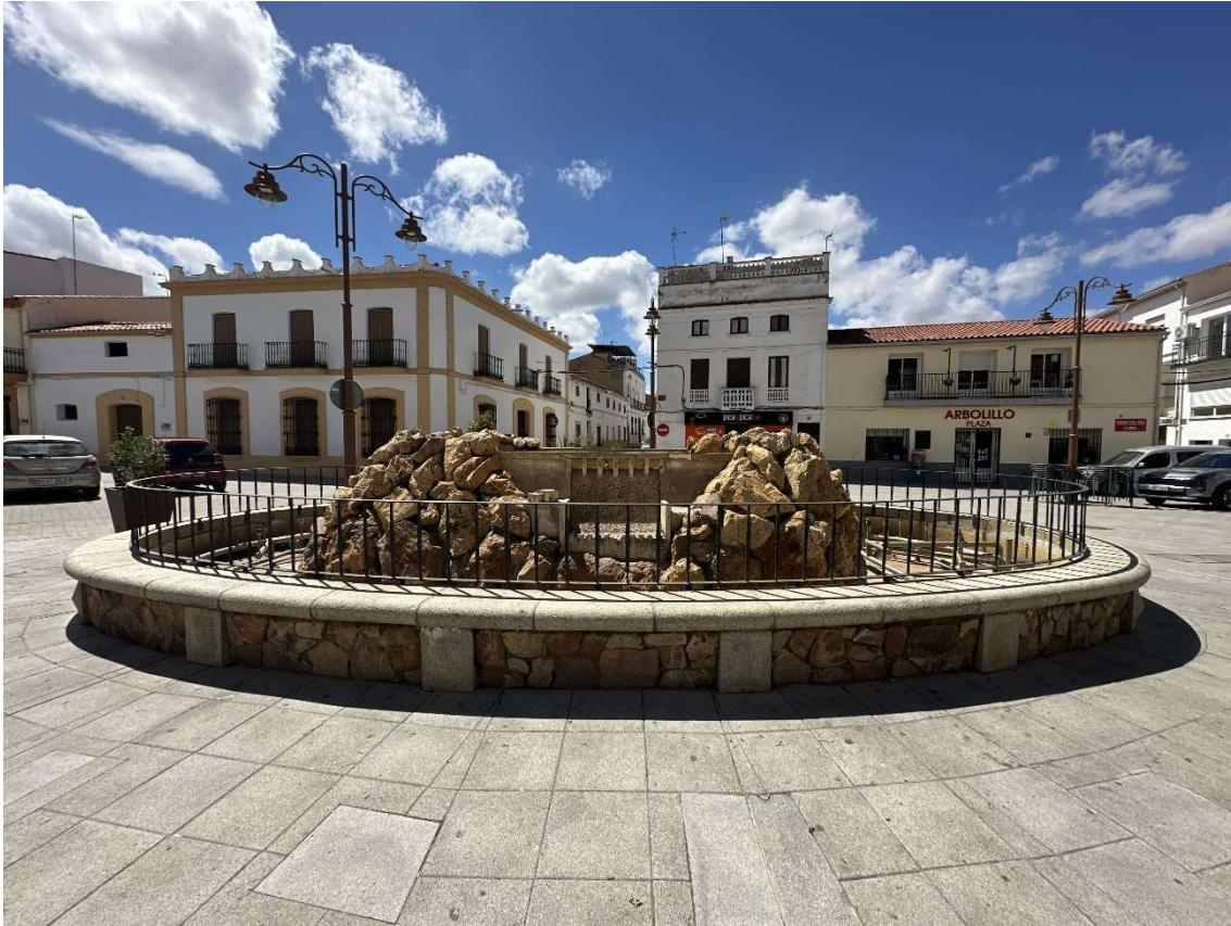
The fountain is located in the centre of Plaza de España in Talarrubias.