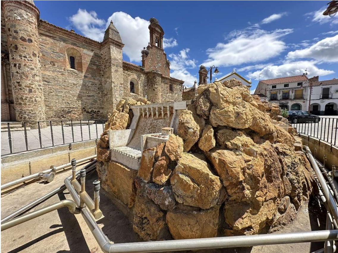
The fountain represents the reservoirs of Zújar, Orellana, Cijara and García de Sola.