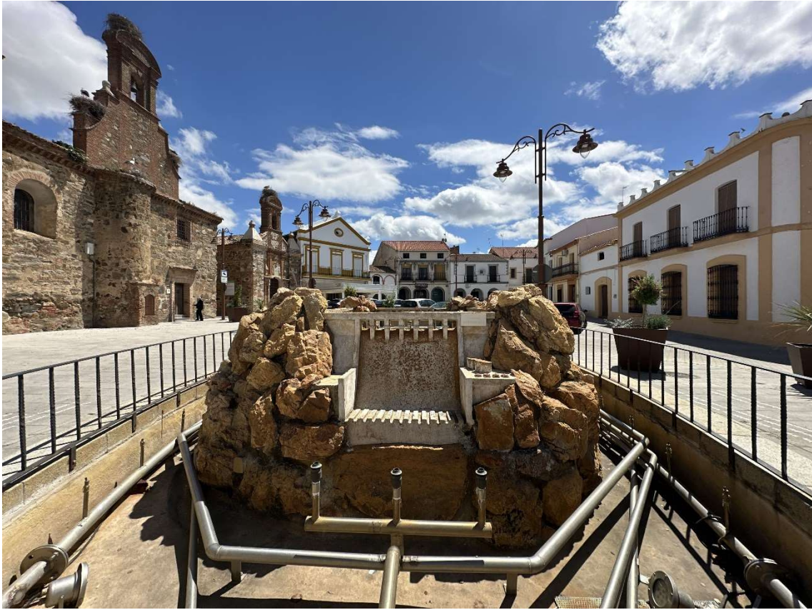
Image of the fountain from another perspective.