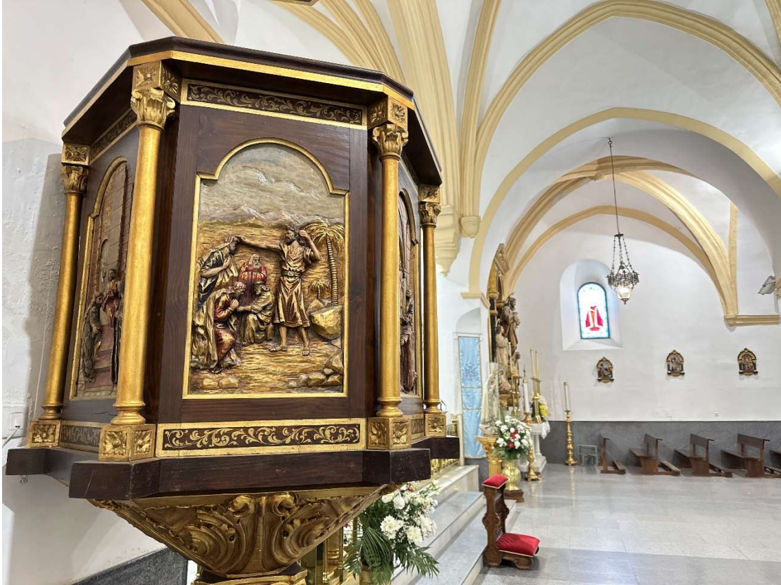
Detail of the old pulpit inside the church.