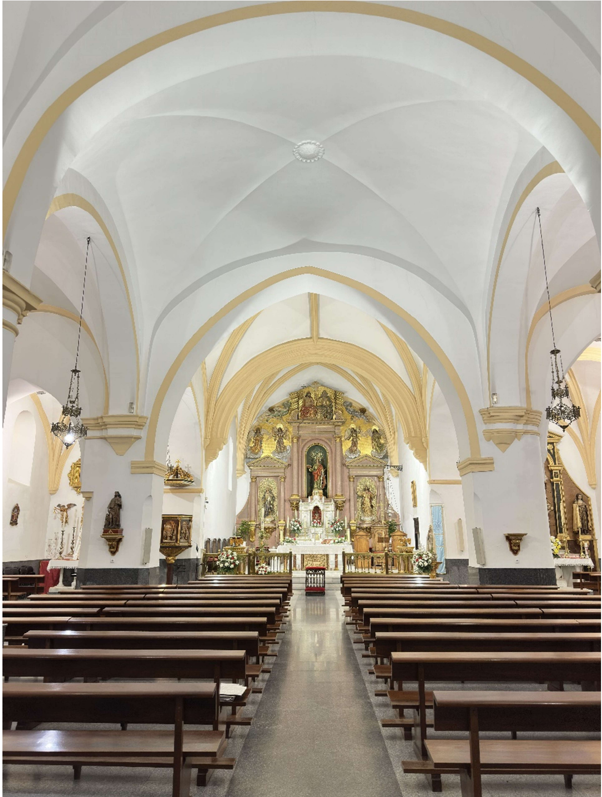
The church has a length of 45 meters. © ARZOBISPADO DE TOLEDO. TOLEDO. ESPAÑA