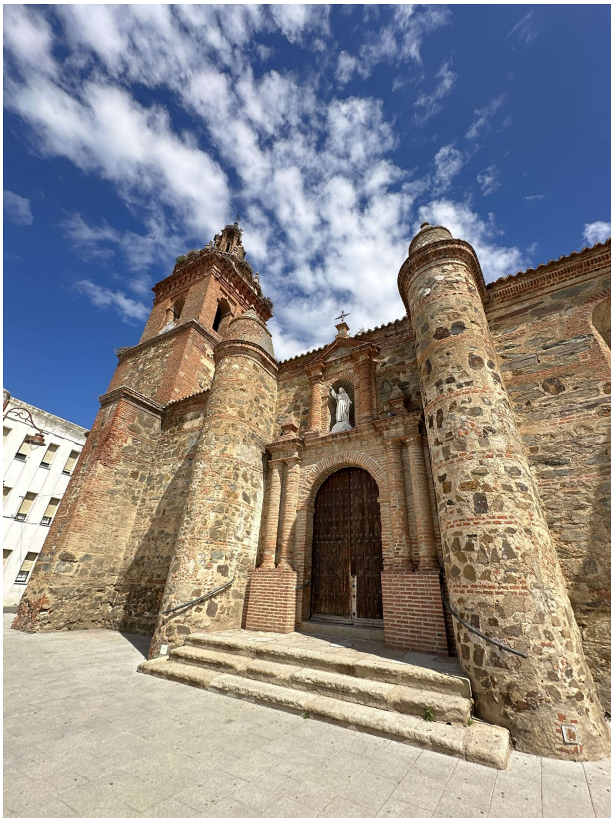
The tower has a height of 31 meters up to the base of the weather vane and the cross.