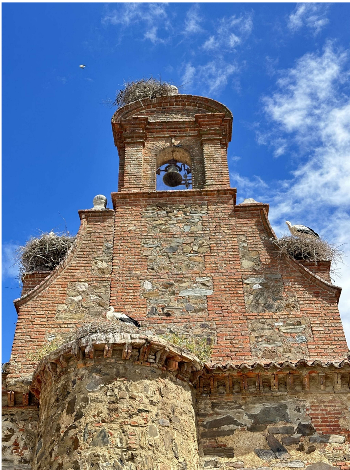
Detail of the bell gable crowning the parish church, with a single bell..