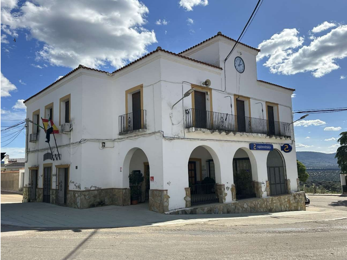
General view of the Town Hall of Tamurejo.