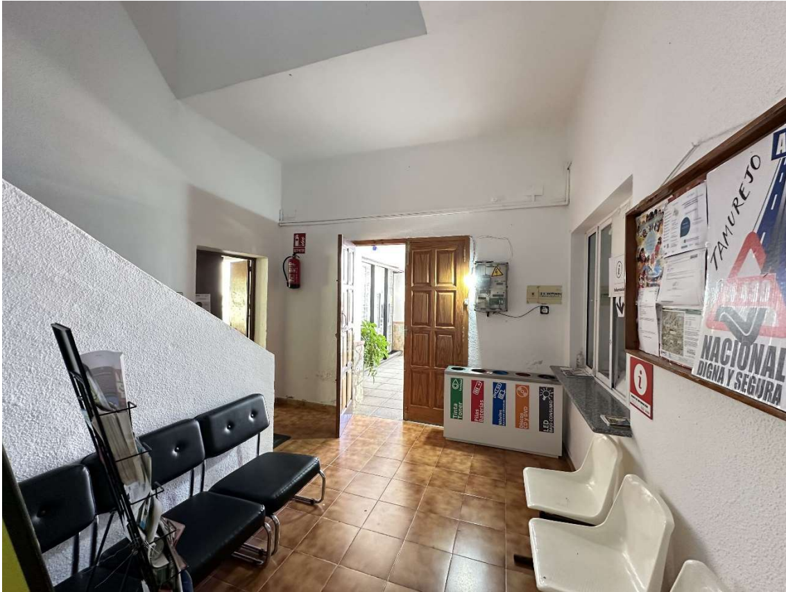
Access to the facilities viewed from inside.