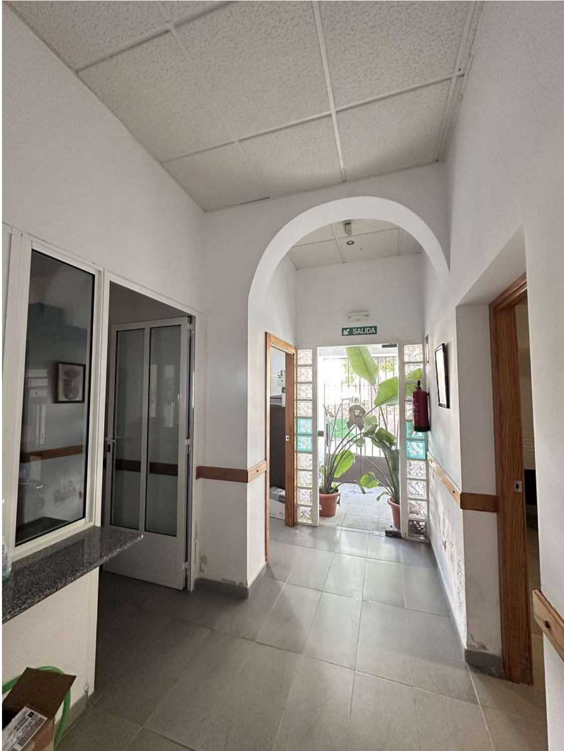
Entrance and reception area.