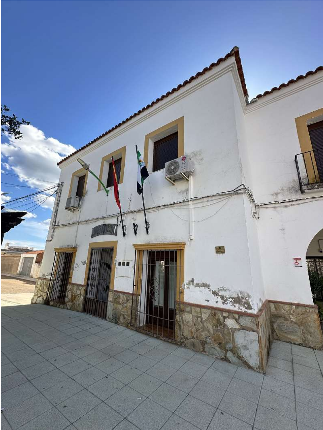
Main façade of the Town Hall.