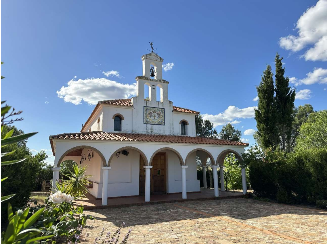
Image of the hermitage, with a front porticoed area featuring five arches.