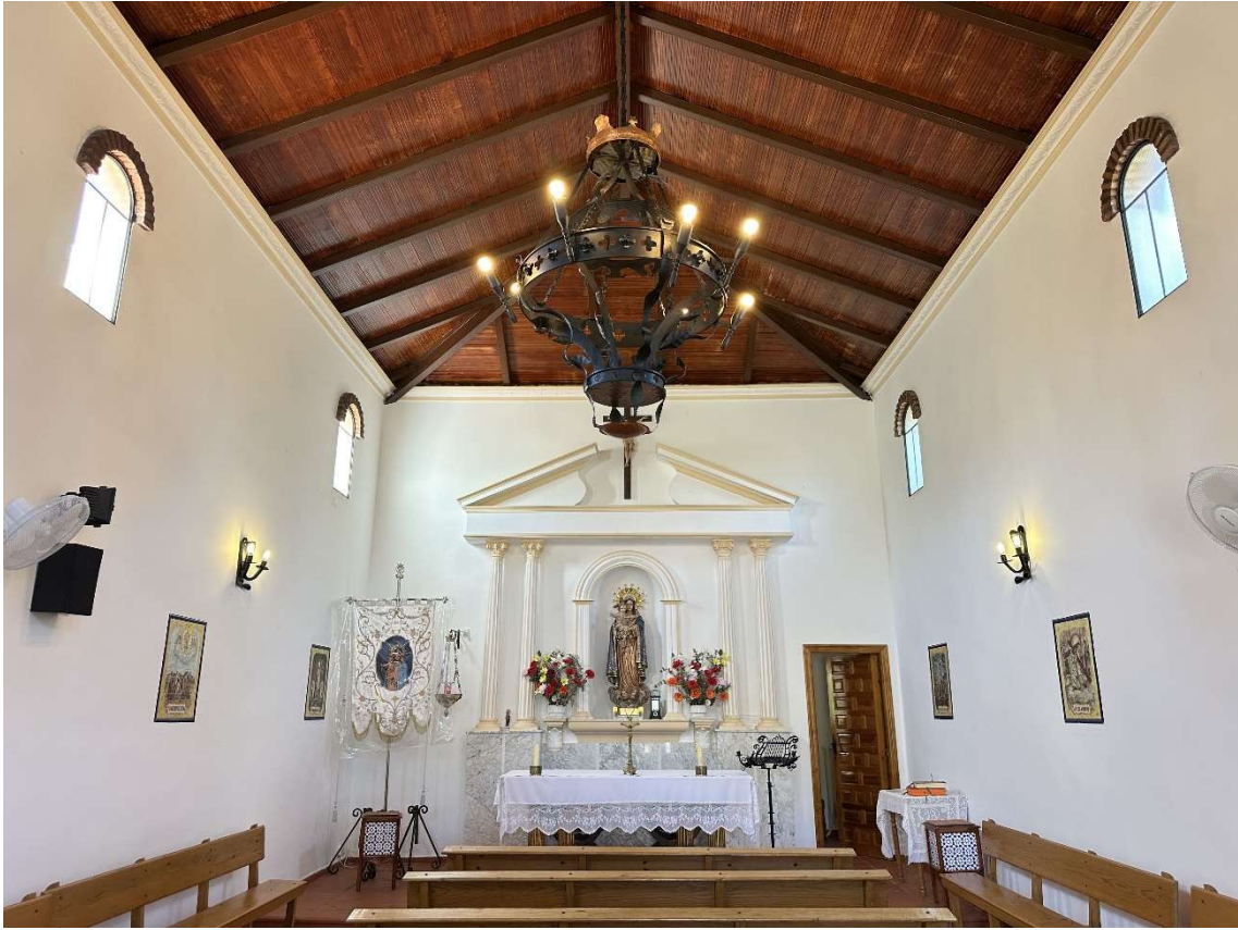
Interior of the hermitage.