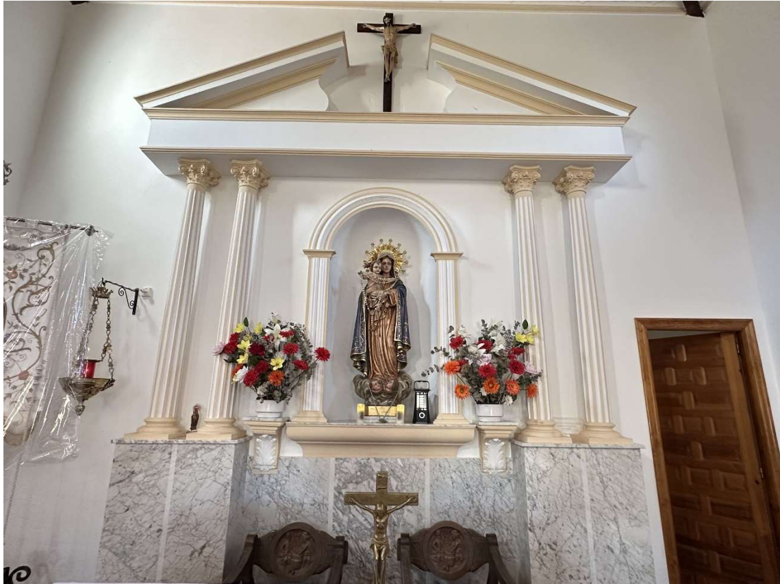
Image of the altar and the access door to the sacristy.