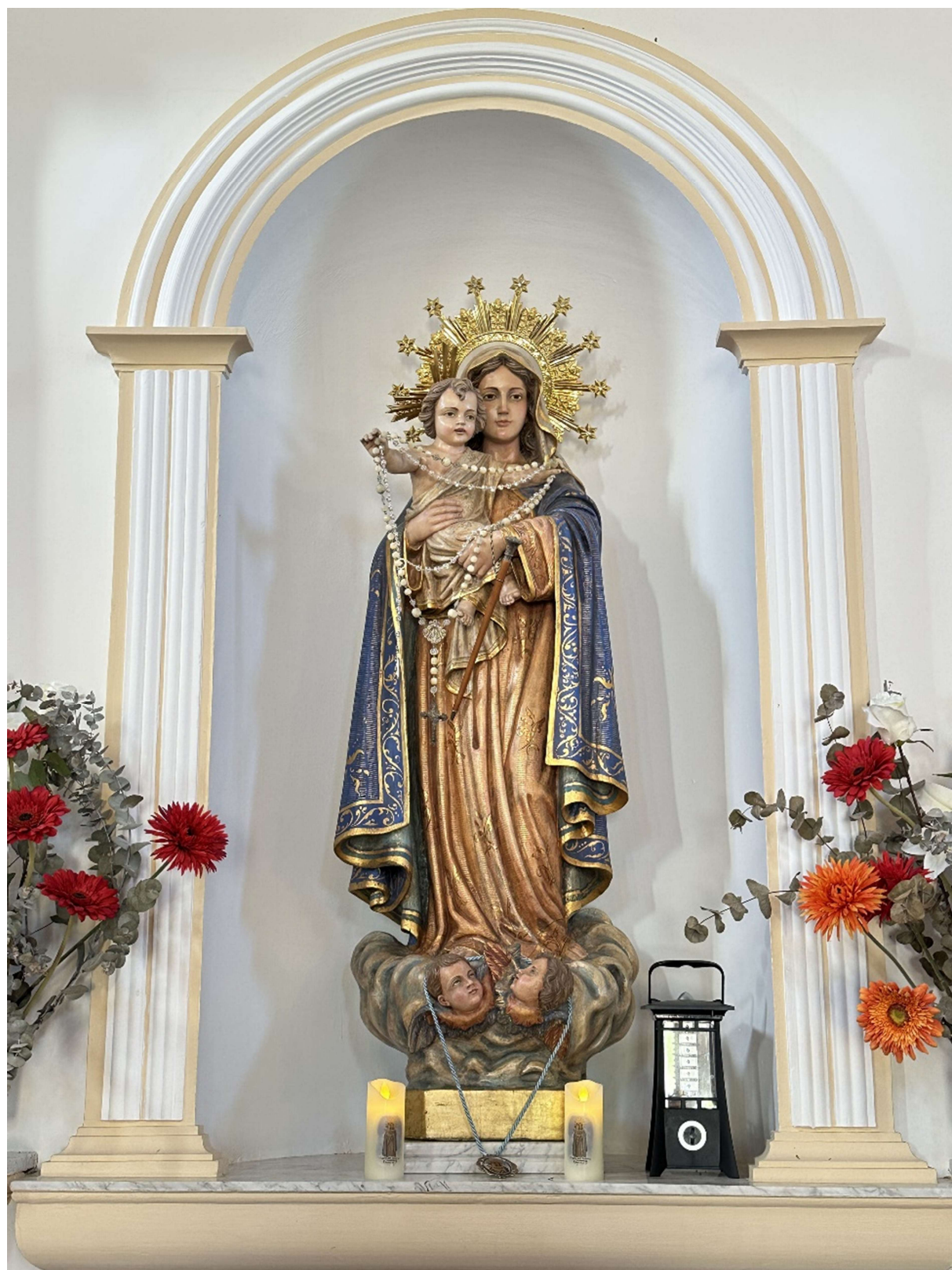
Image of Nuestra Señora del Rosario.