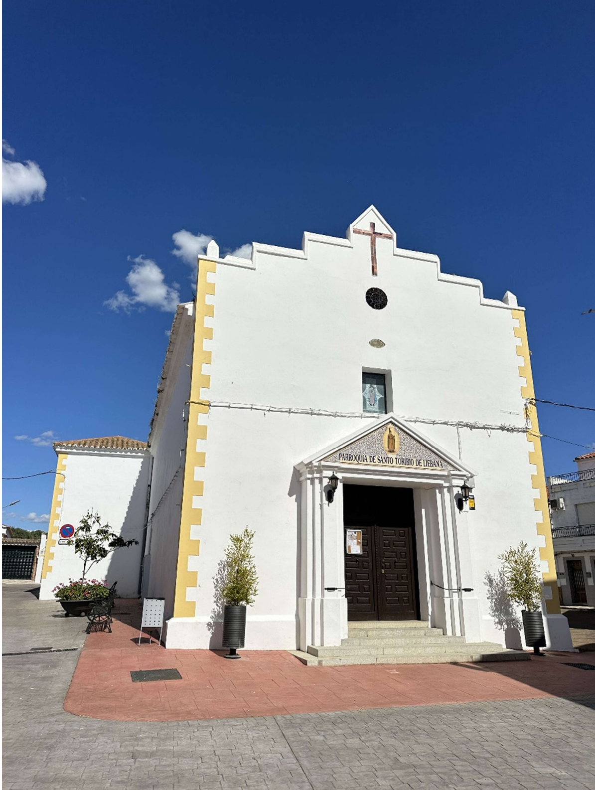
General view of the church.