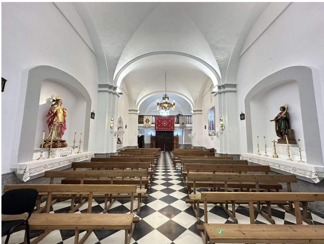
Image of the temple taken from the altar.