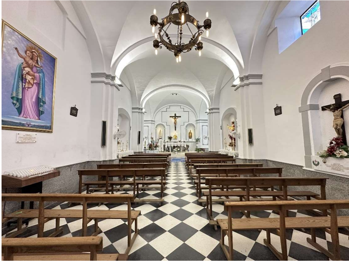
Two images of the interior of the parish church, in a sober style.