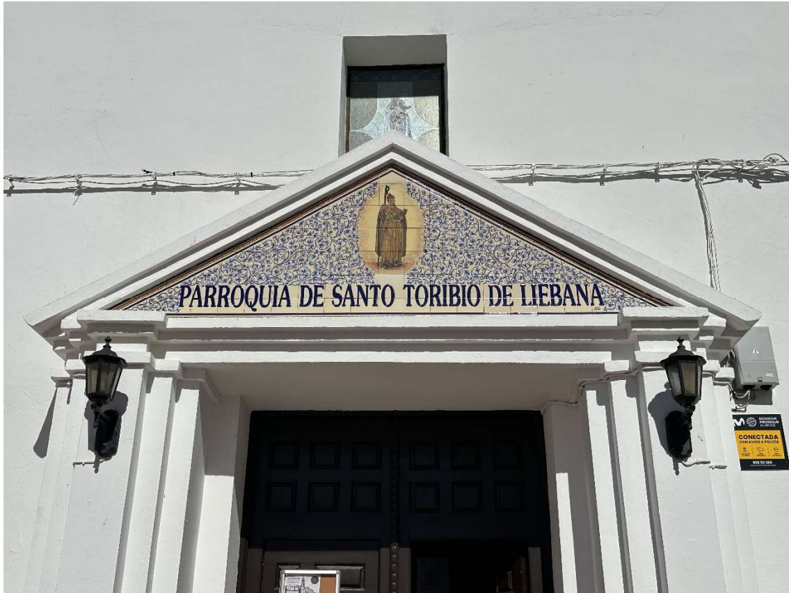
Image of the entrance to the Parish Church of Santo Toribio de Liébana.