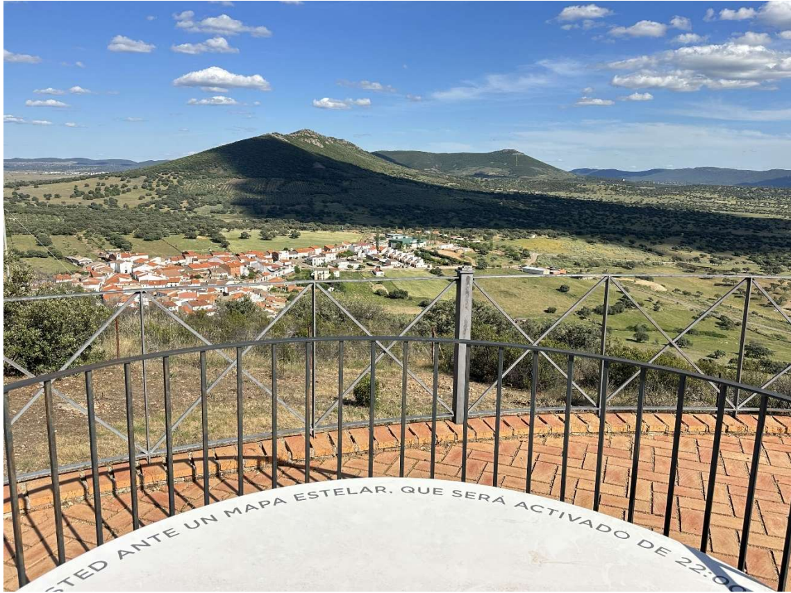
Tamurejo viewed from the viewpoint.