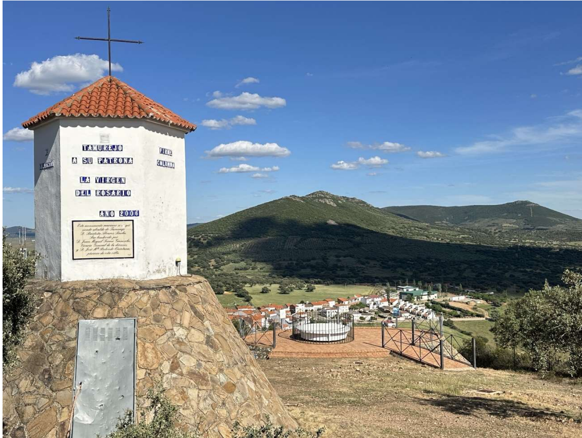
Mirador de la Pinguta del Morro, with excellent panoramic views.