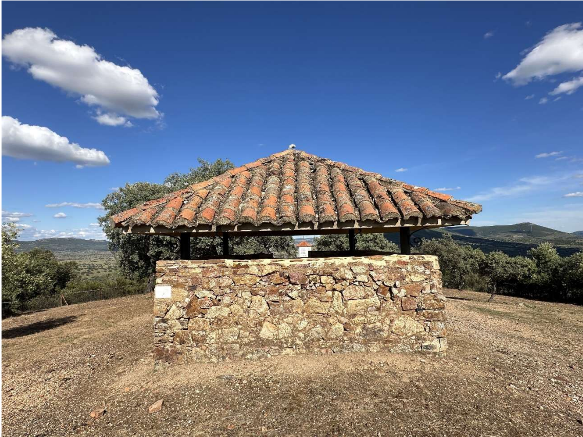
Various enhancement initiatives have been carried out at the viewpoints.