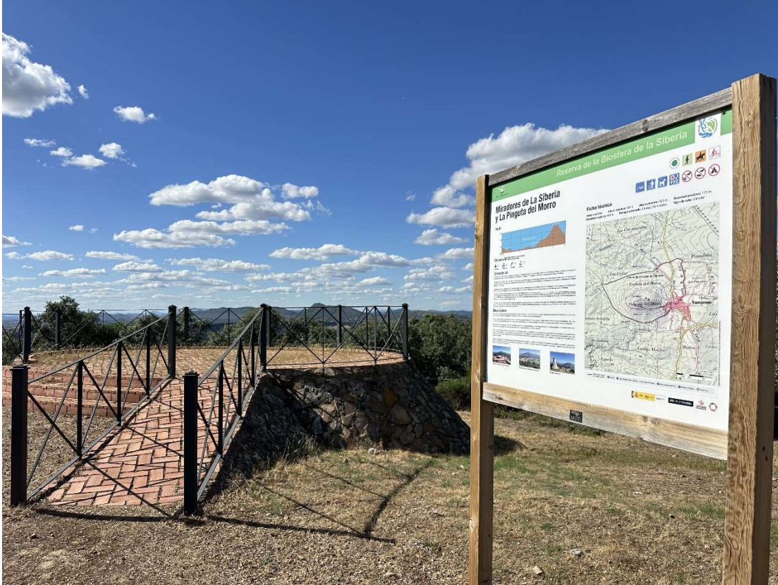
The viewpoints help to highlight the natural and scenic richness of the area.