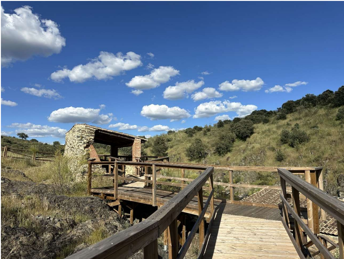
Constructed wooden walkway linking the mill with the bridge over the river.