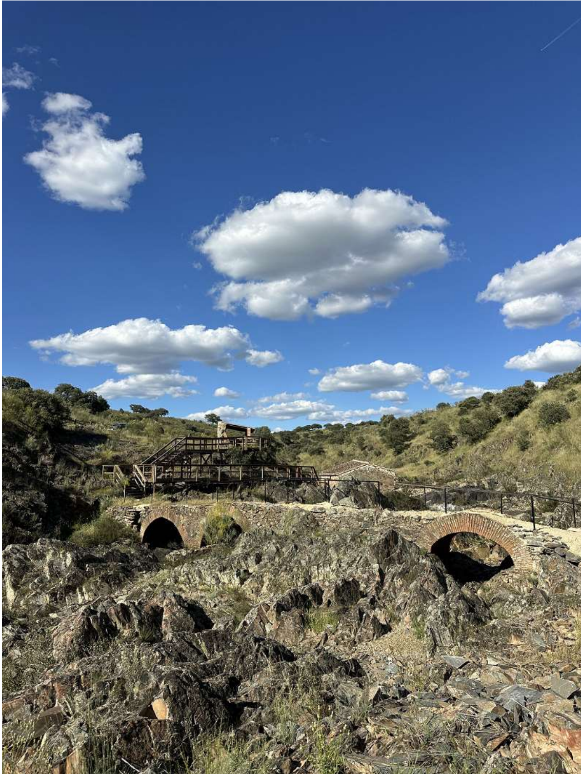
The bridge has three double-ring brick arches distributed across two sections.