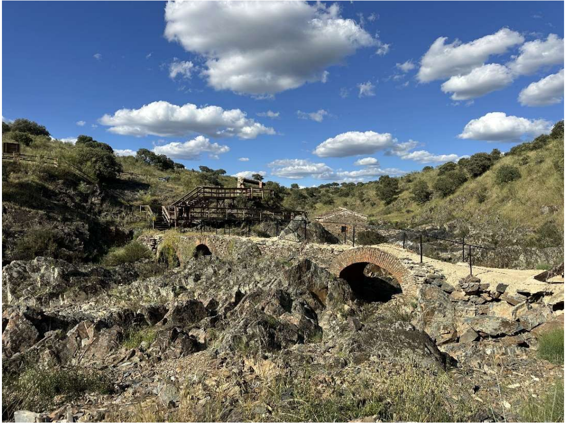
Above, the bridge over the Río Agudo. Below, the interior of the mill, adapted as an interpretation centre.