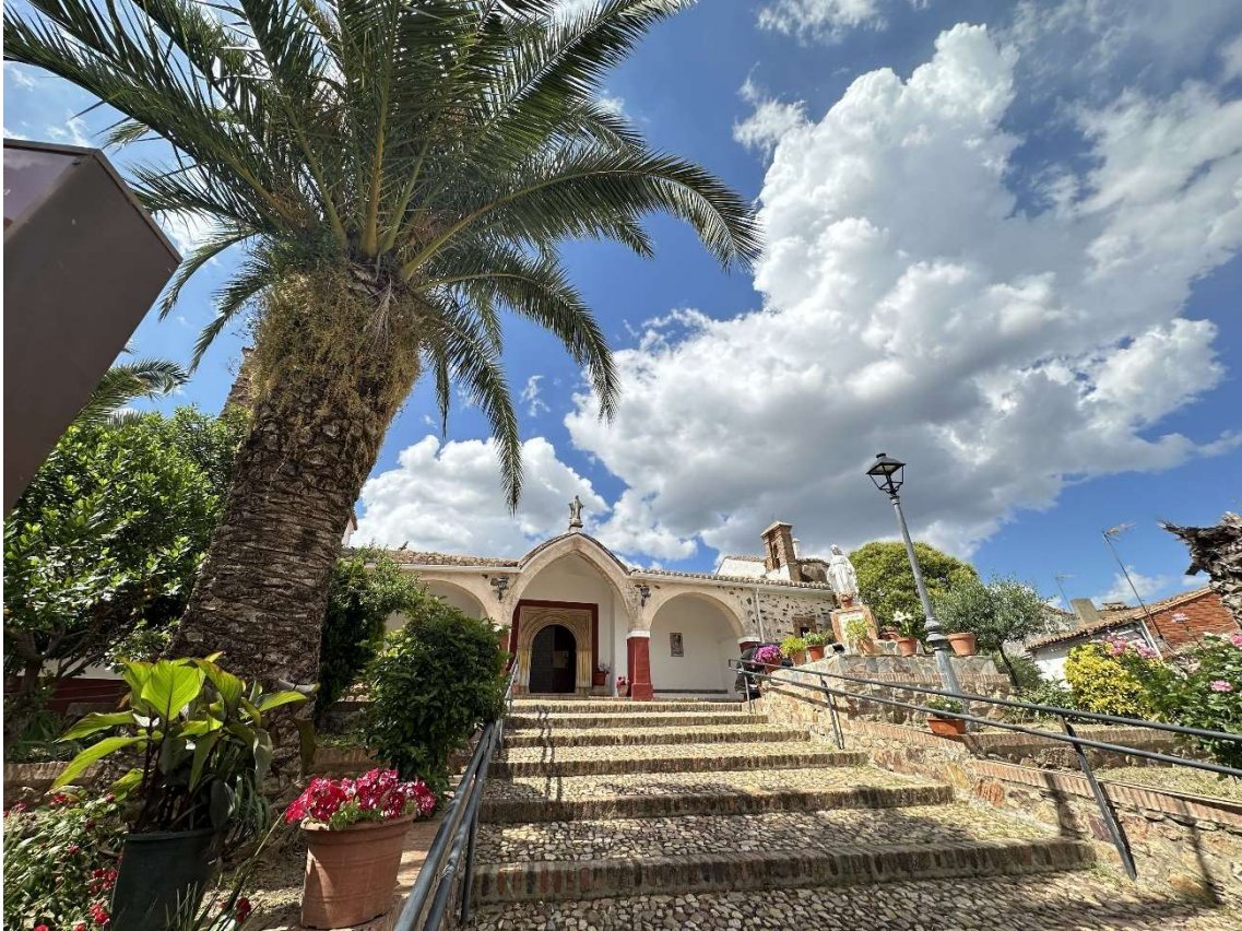
Exterior view of the Church.