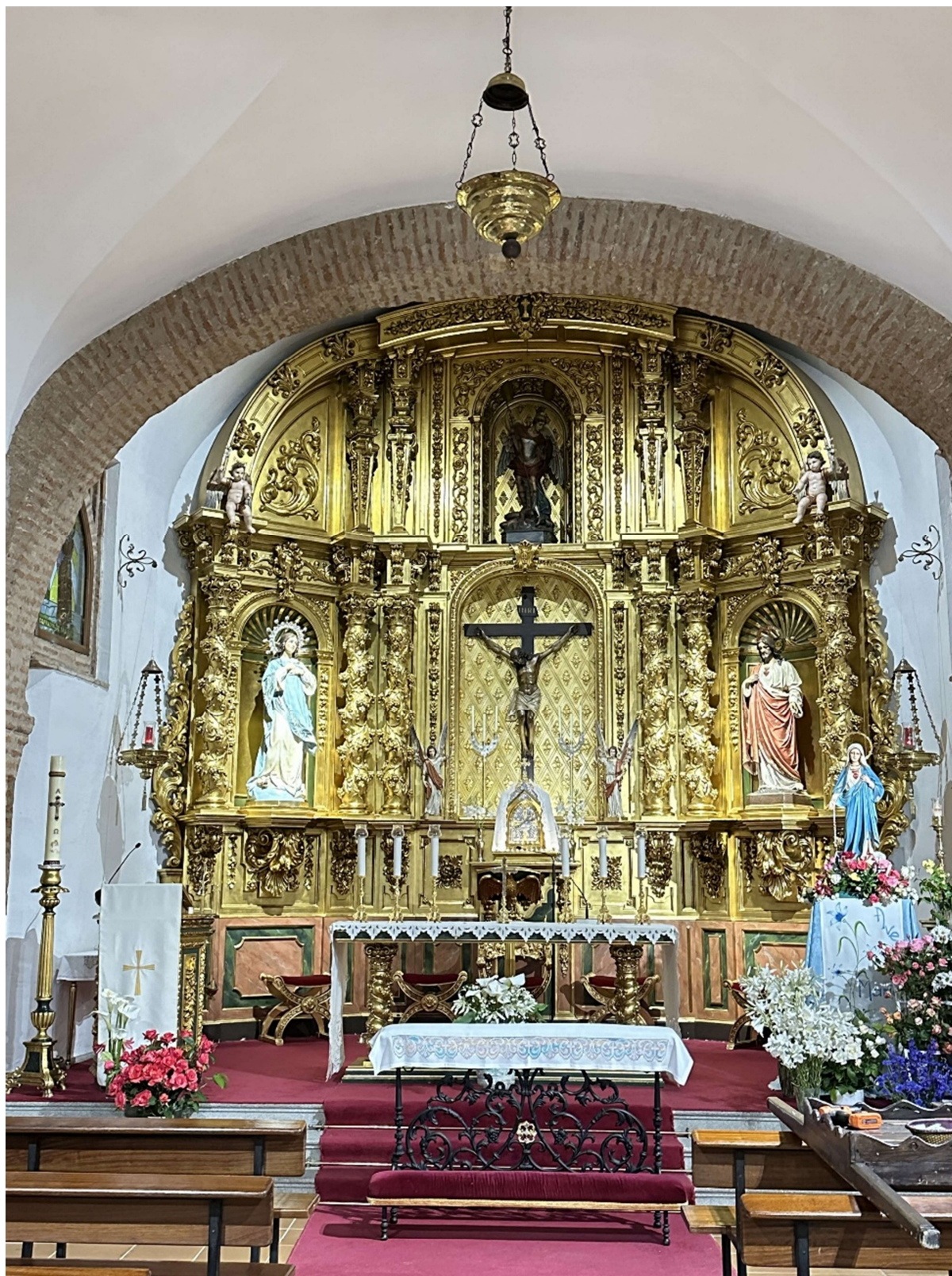
Detail of the church altarpiece.