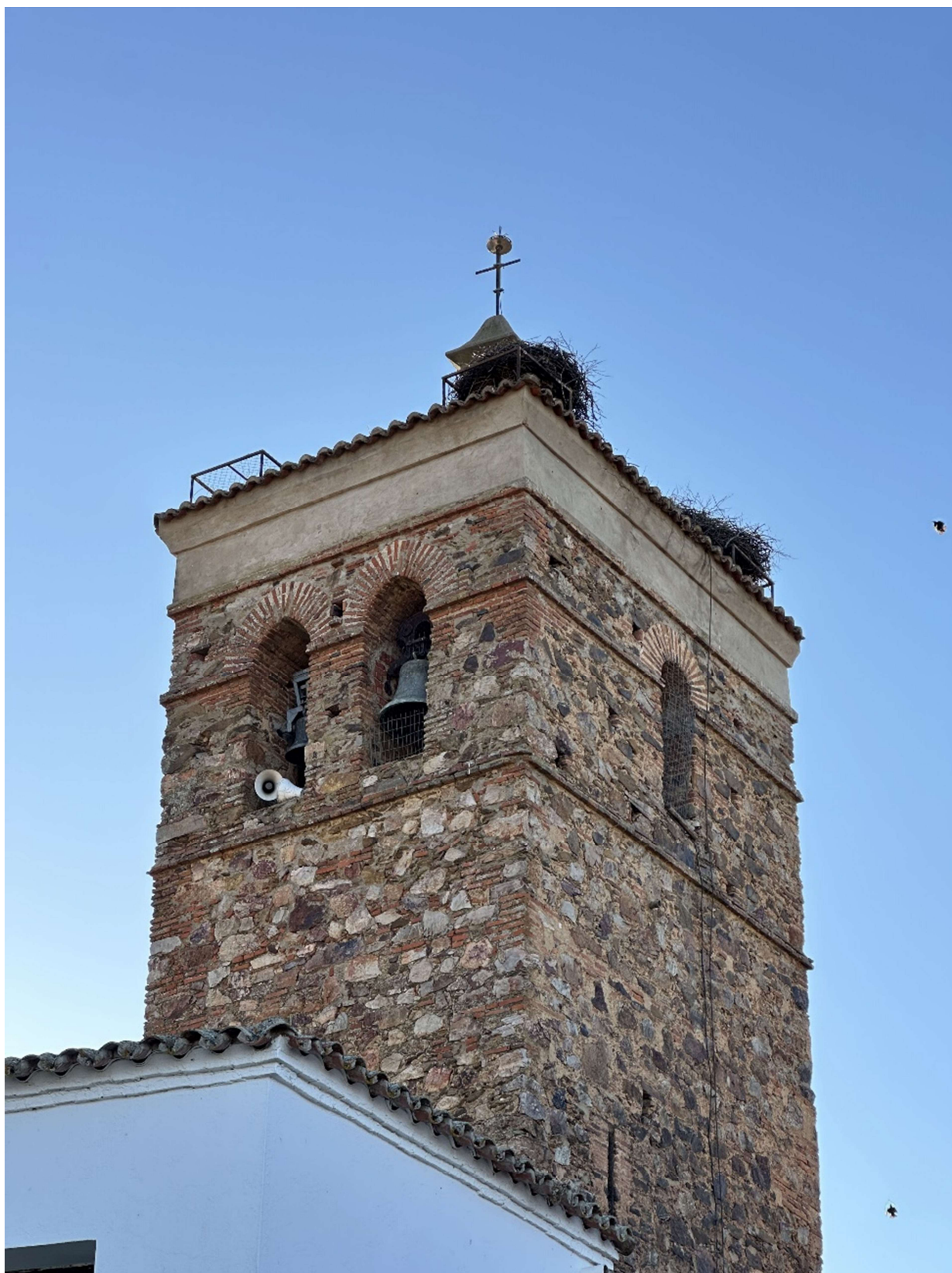
Detail of the tower, built with stone and brick.