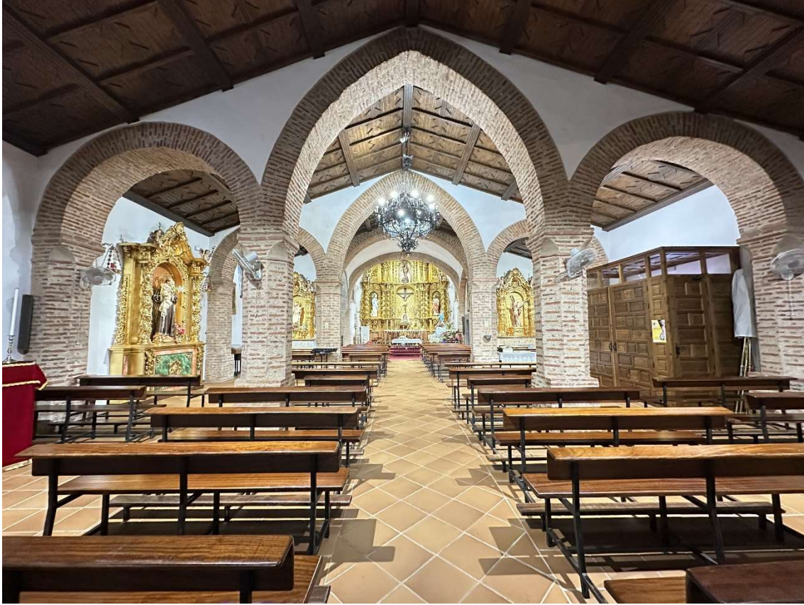
The church has a basilical floor plan with three naves separated by thick pillars and masonry walls.