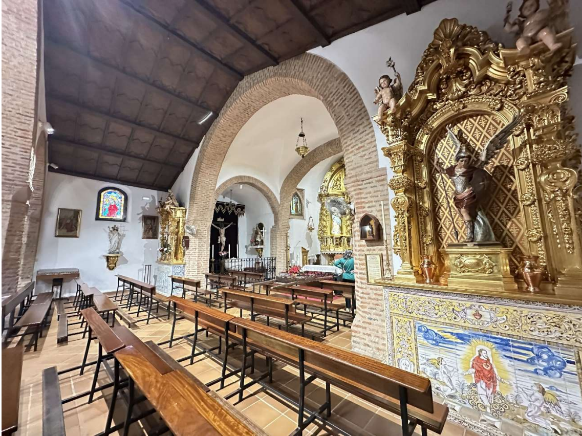
Inside the temple, various elements of heritage and devotional interest are preserved.