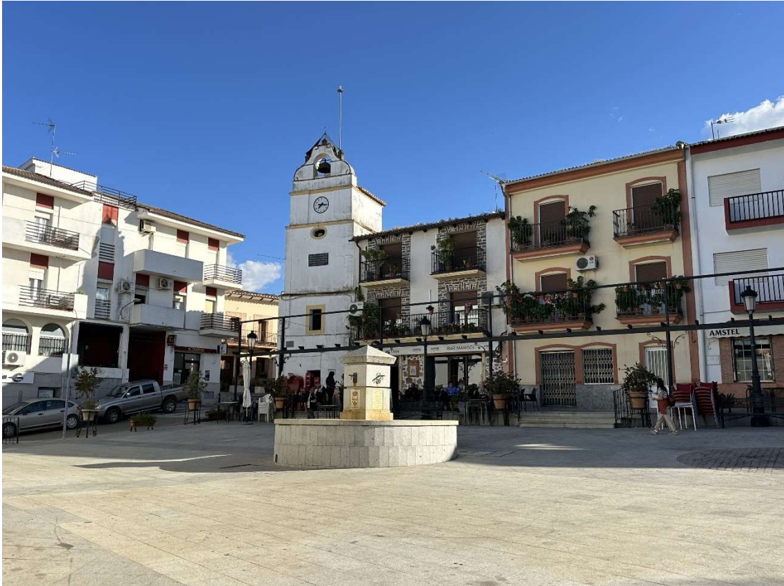
Plaza de España, with the fountain in the foreground and “El Reloj” in the background.