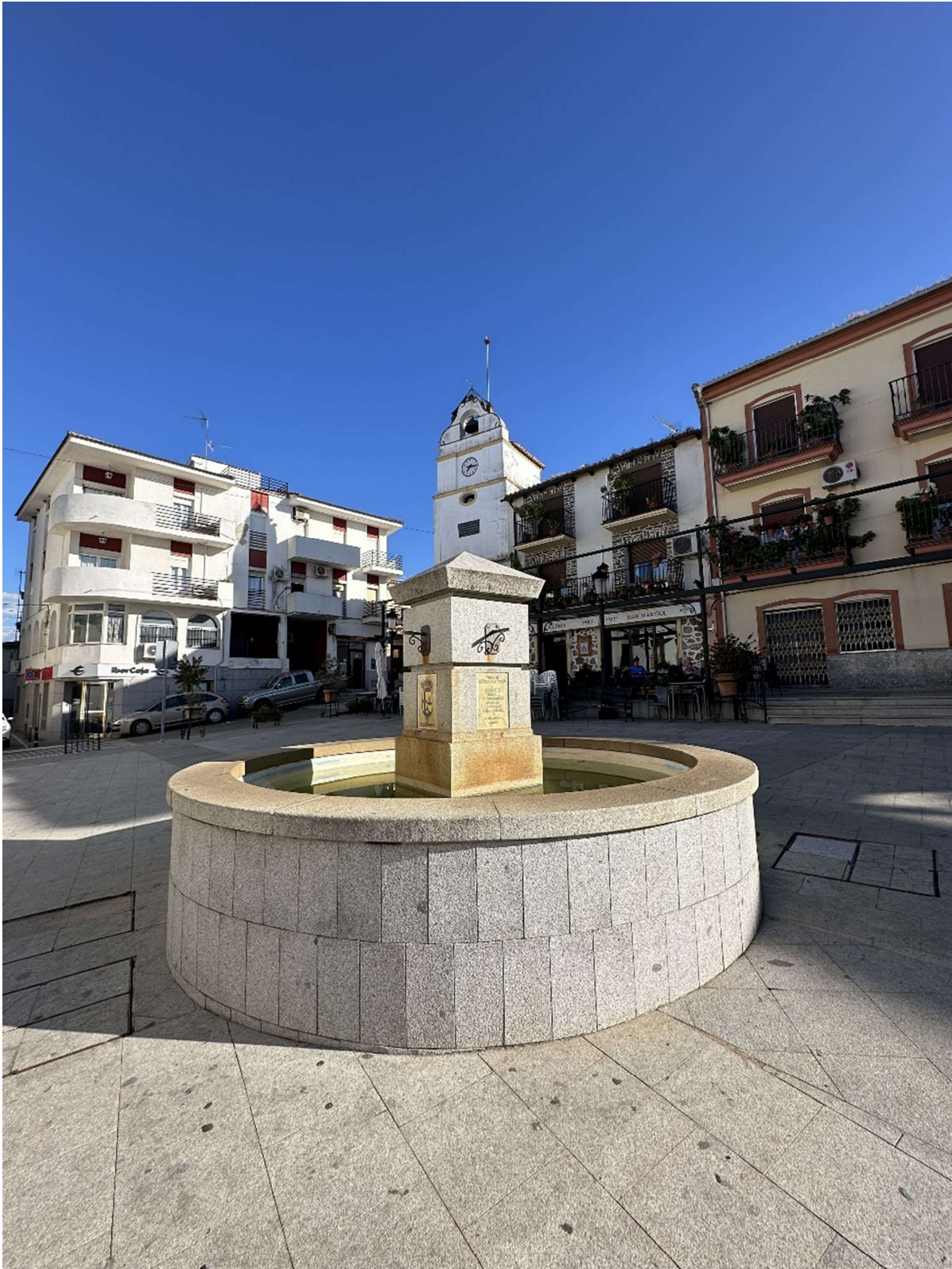
Fountain in Plaza de España in Valdecaballeros.