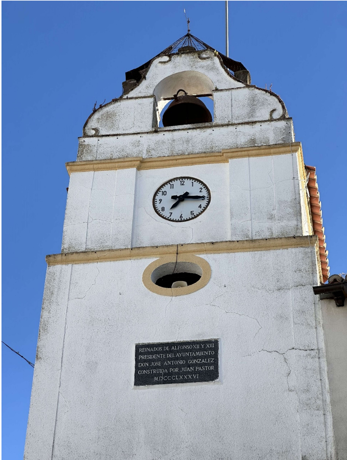
Inscription on the front wall of "El Reloj".