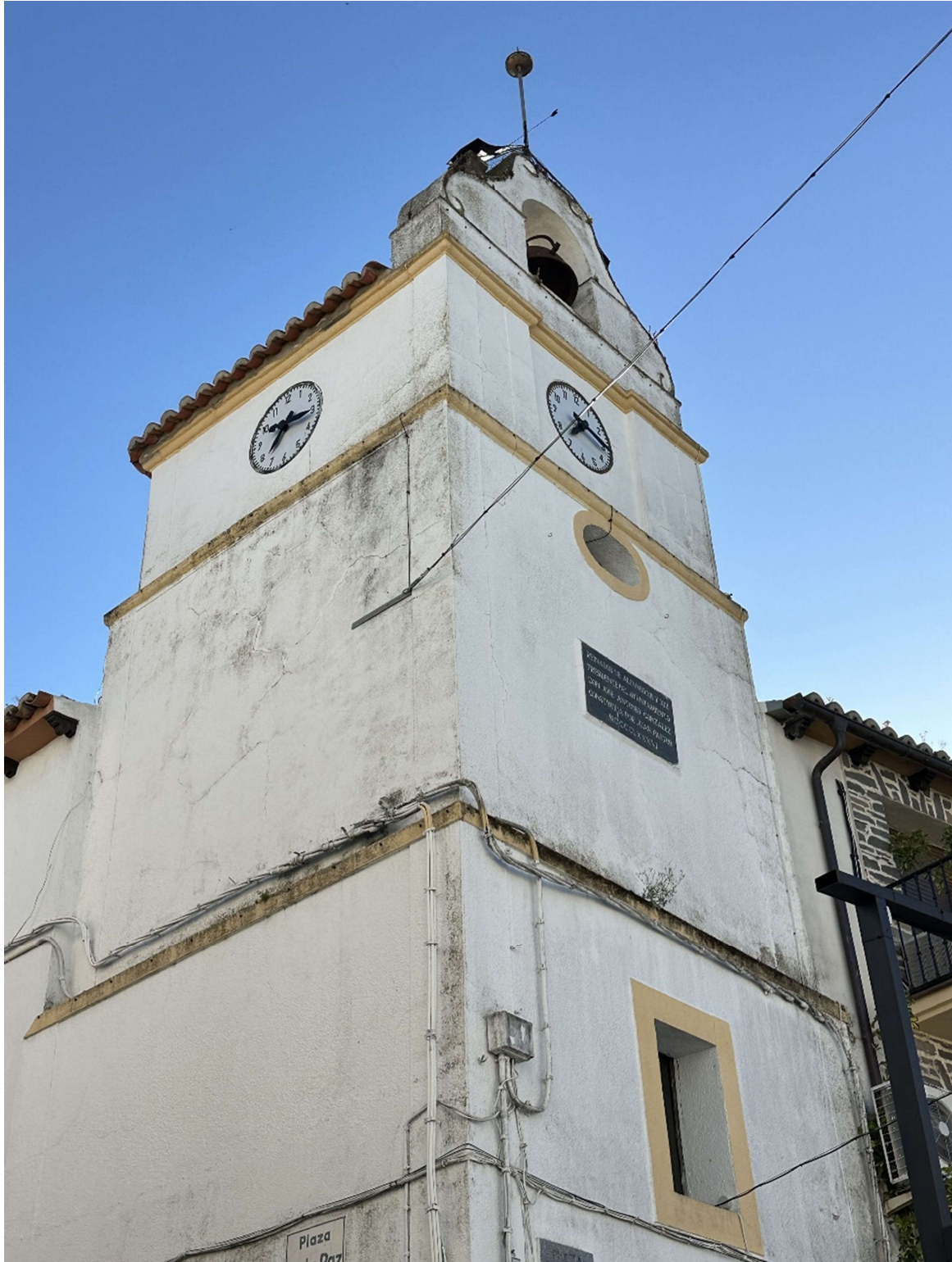
Tower showing one clock on the front and another on the side wall.