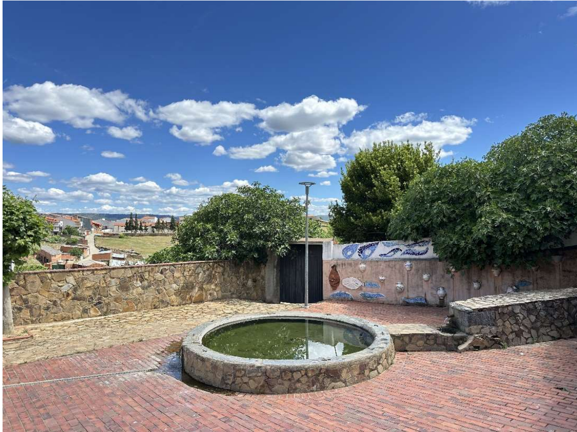
Different images of the fountain, very close to the parish church.