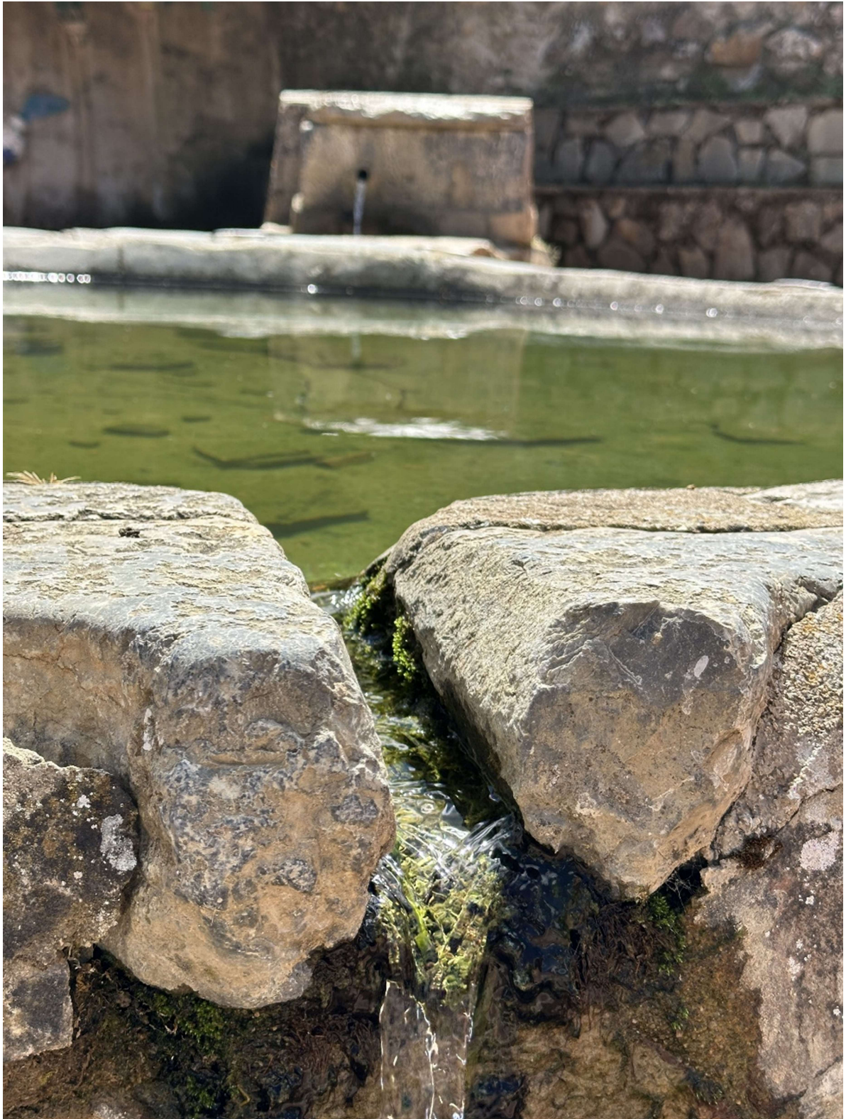
The fountain follows a simple typology, typical of traditional rural fountains.