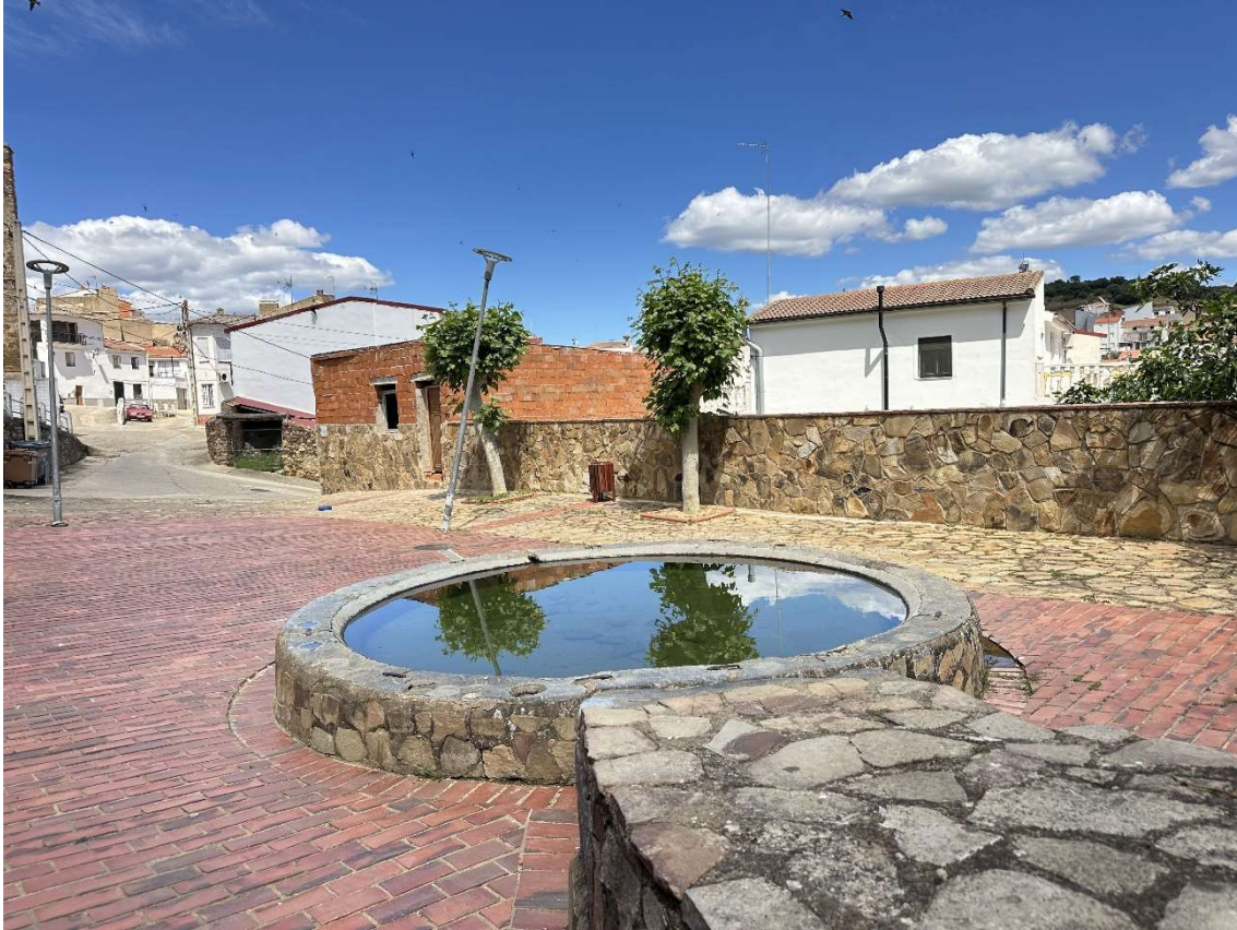
Image of the “El Chorro Viejo” Fountain, a meeting place for local residents.