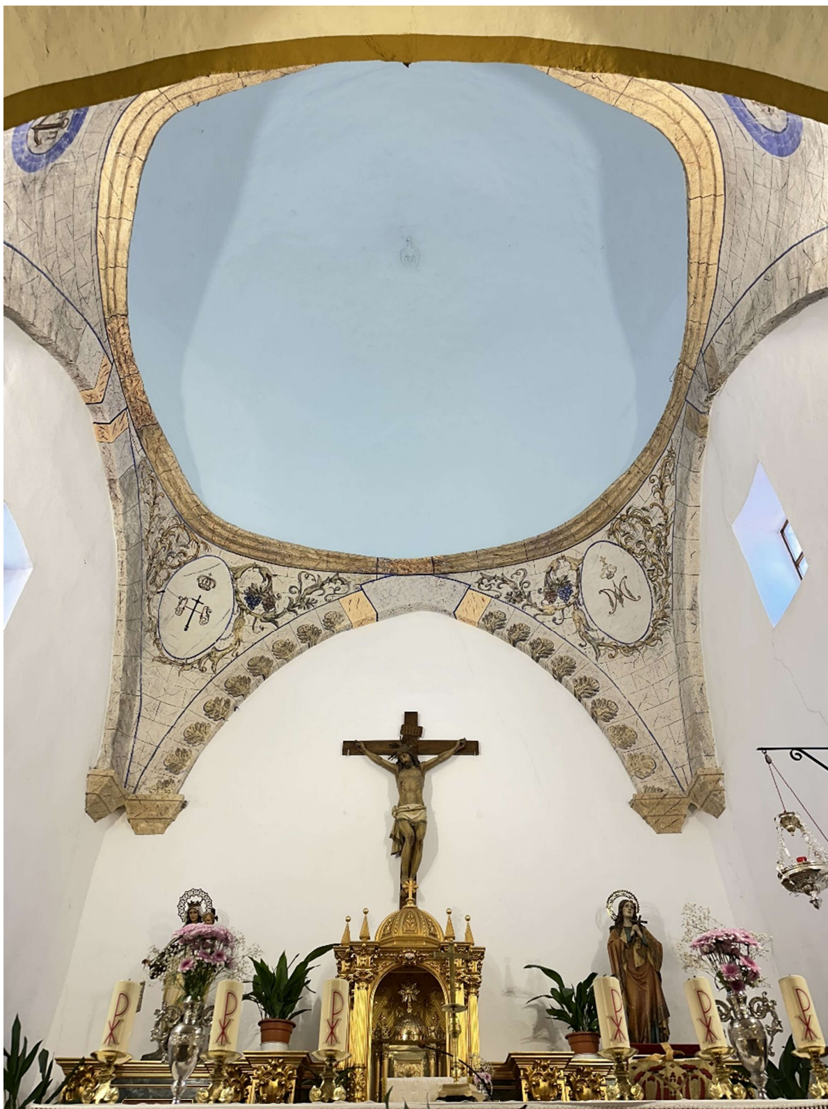
Irregular dome of the Church of Santa María Magdalena.