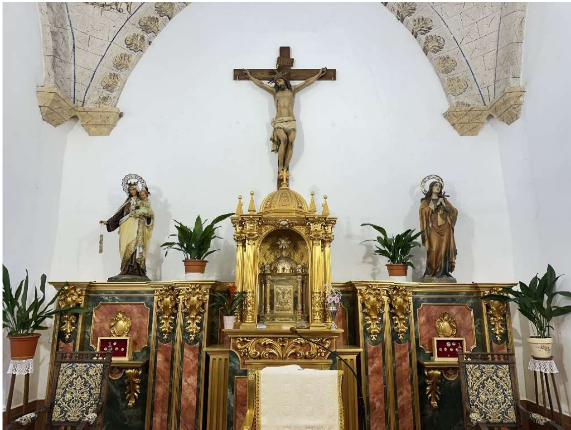
The church has a three-nave floor plan separated by diaphragm arches and gabled roofs.