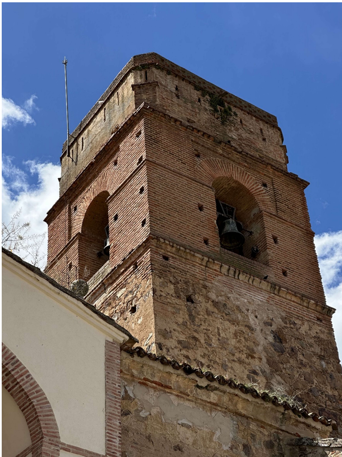
Quadrangular tower at one end, giving singularity to the complex..