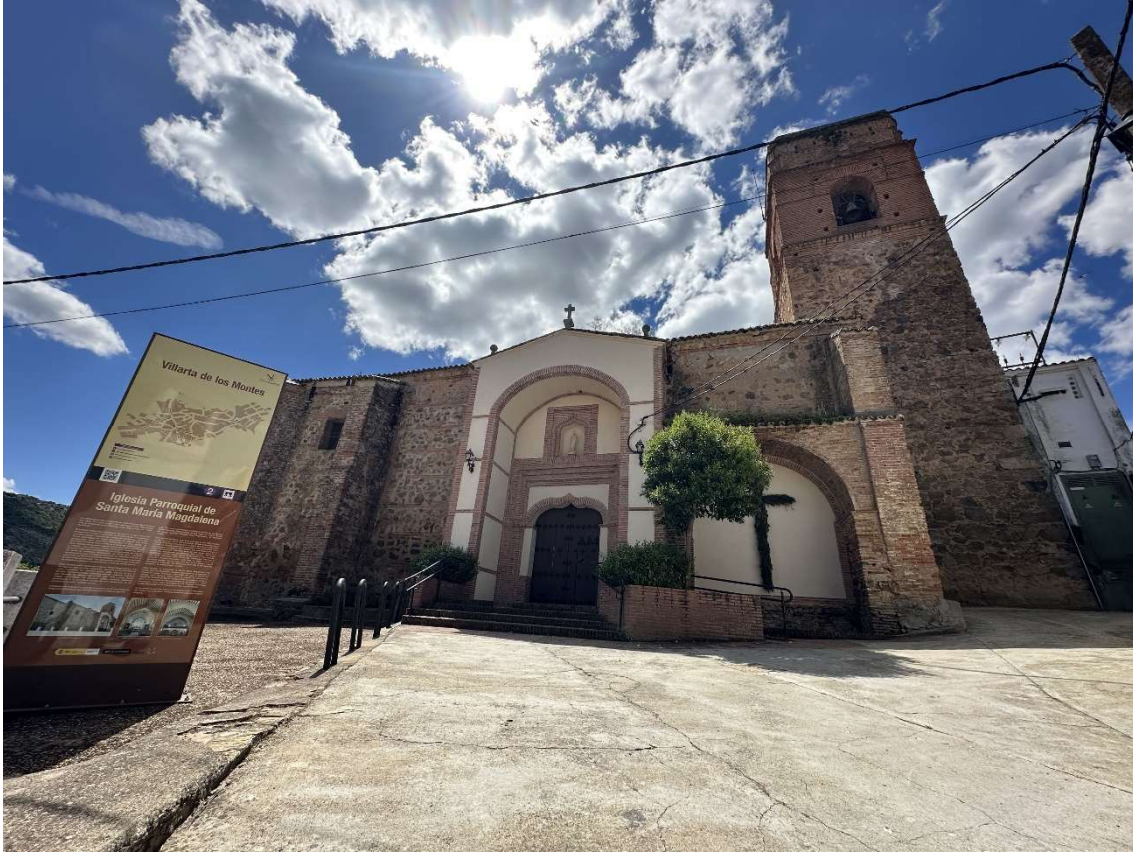
Exterior view with an austere appearance, in which the portal and a quadrangular tower stand out.