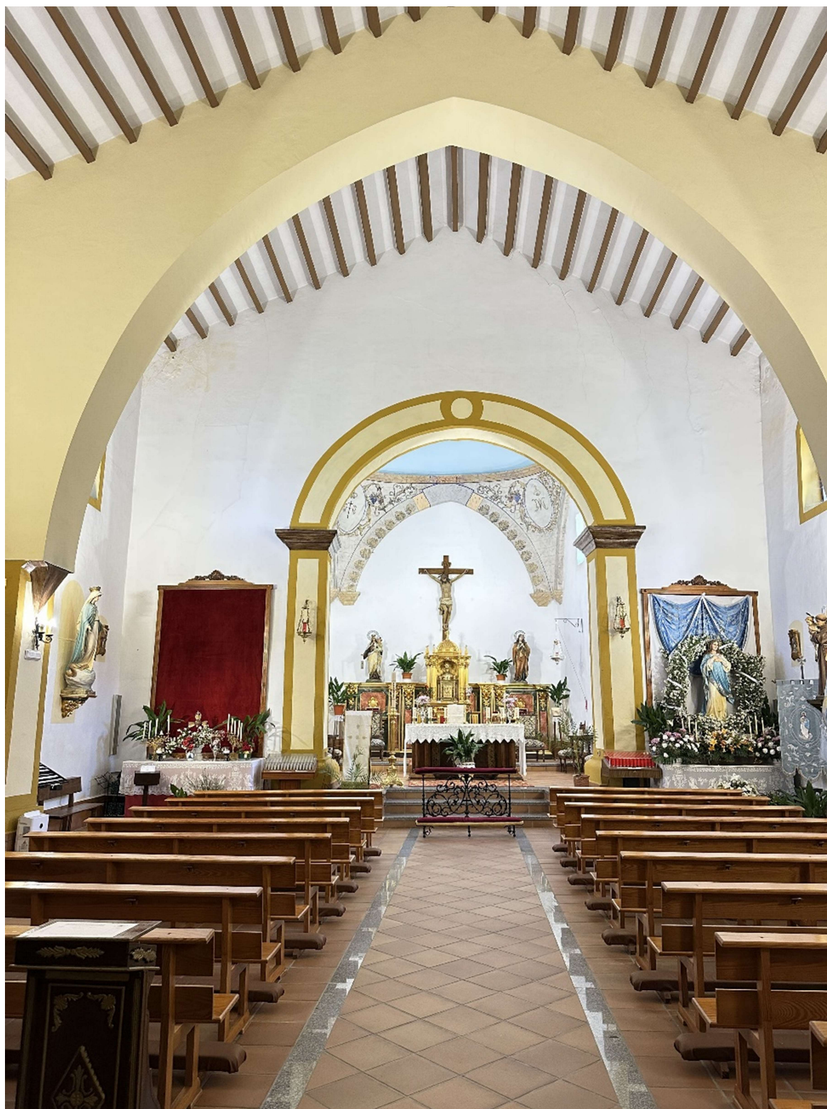
The presbytery features a semicircular triumphal arch, while the apse is covered with a ribbed dome.