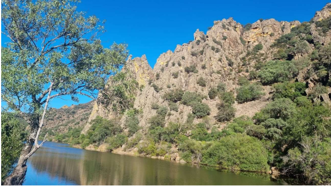
Two images showing the landscape hidden within Las Hoces del Guadiana in Villarta de los Montes.