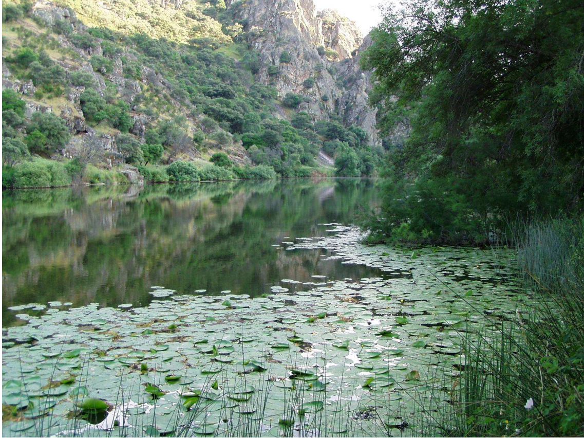
Las Hoces del Guadiana are a natural refuge for numerous species in an area of great environmental value.