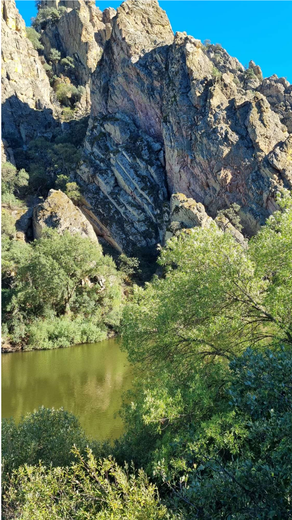
The river winds between the rocks, creating an exceptional landscape.