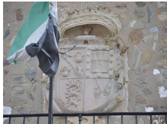
View of the Town Hall courtyard and detail of the heraldic granite coat of arms presiding over the building façade.