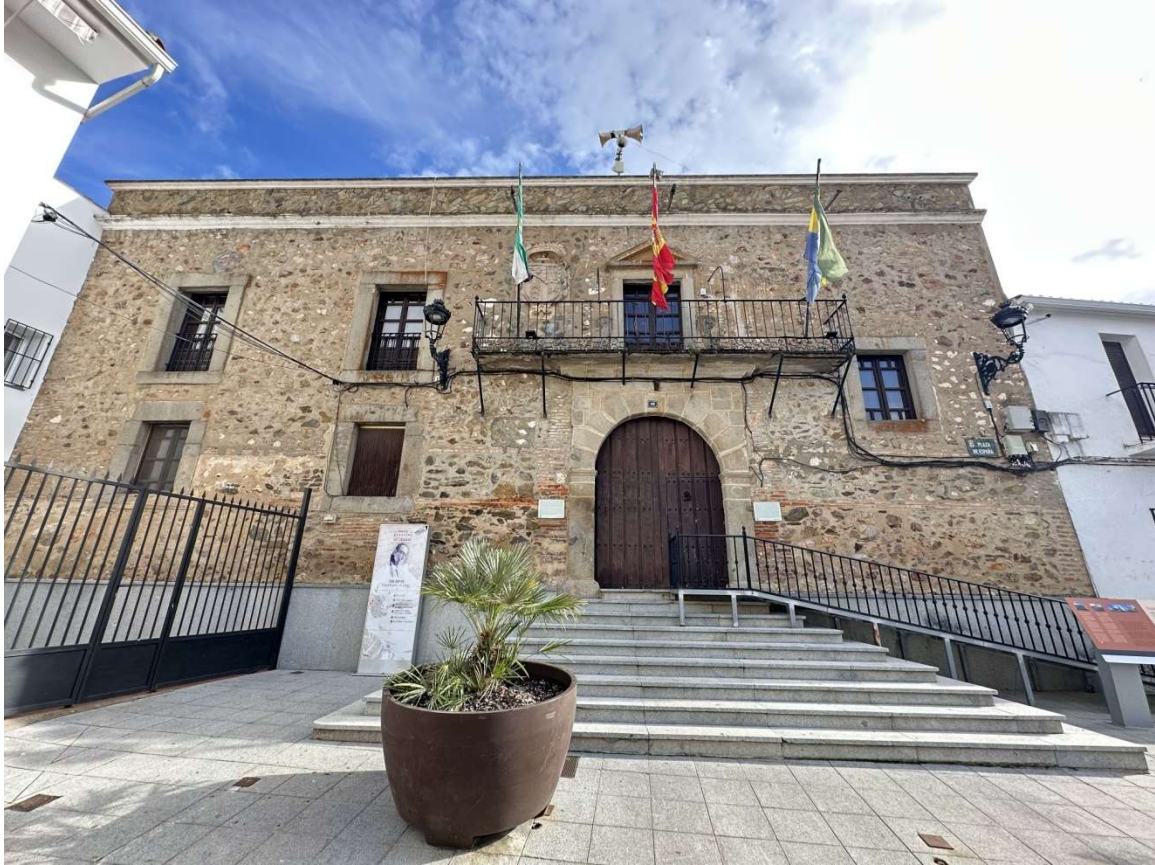
Façade of the Town Hall, fountain in the square and general view from an arch.