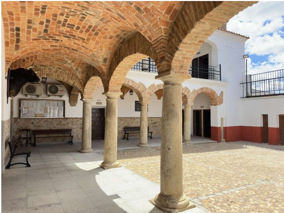
Openings with stone lintels in the interior courtyard.